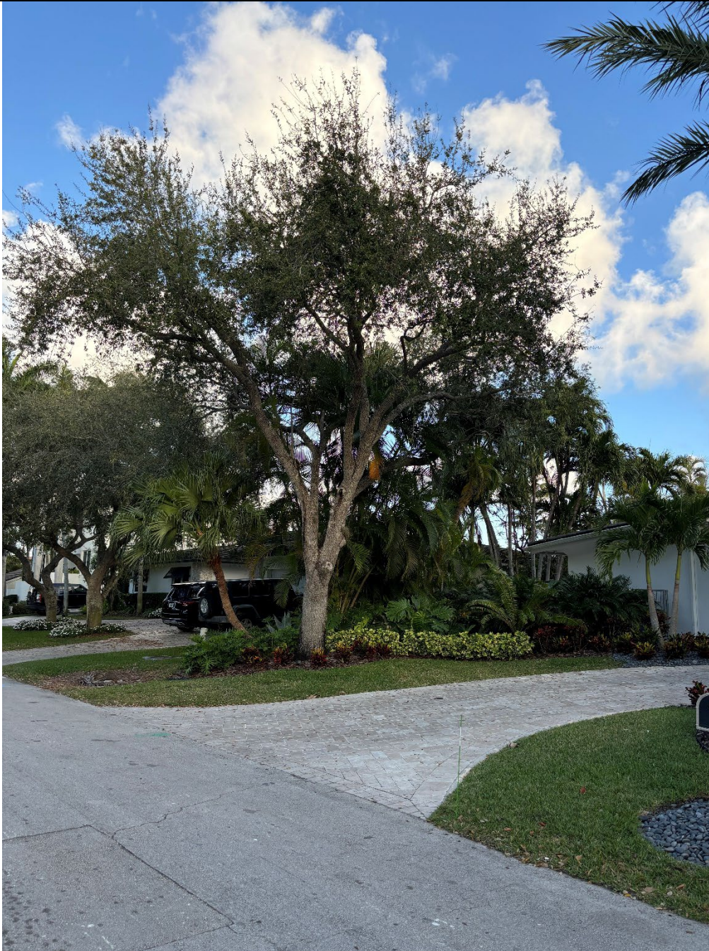
Tree ID #2 – Live Oak