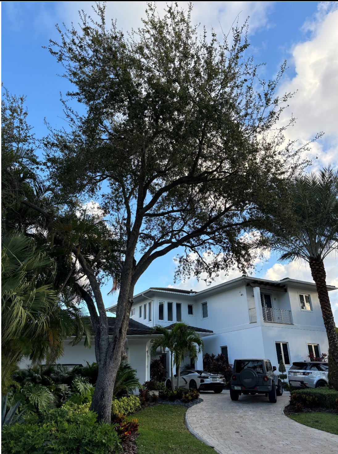
Tree ID #2 – Live Oak