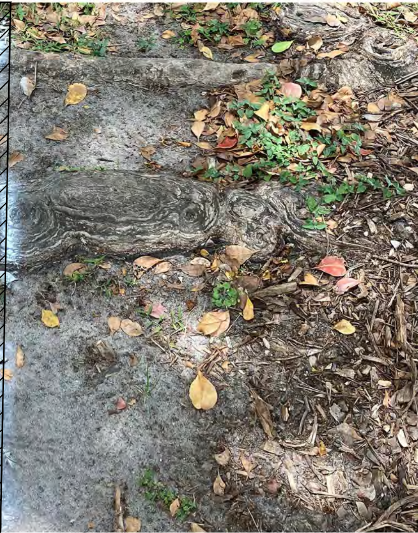
EXISTING TREE #5 - BLACK OLIVE APPROX. 32" DBH, 40' HT, 45' SPR.