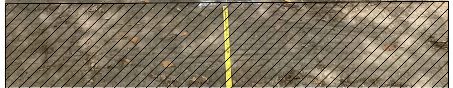
EXISTING TREE #2 - BLACK OLIVE APPROX. 6" DBH, 30' HT, 15' SPR.