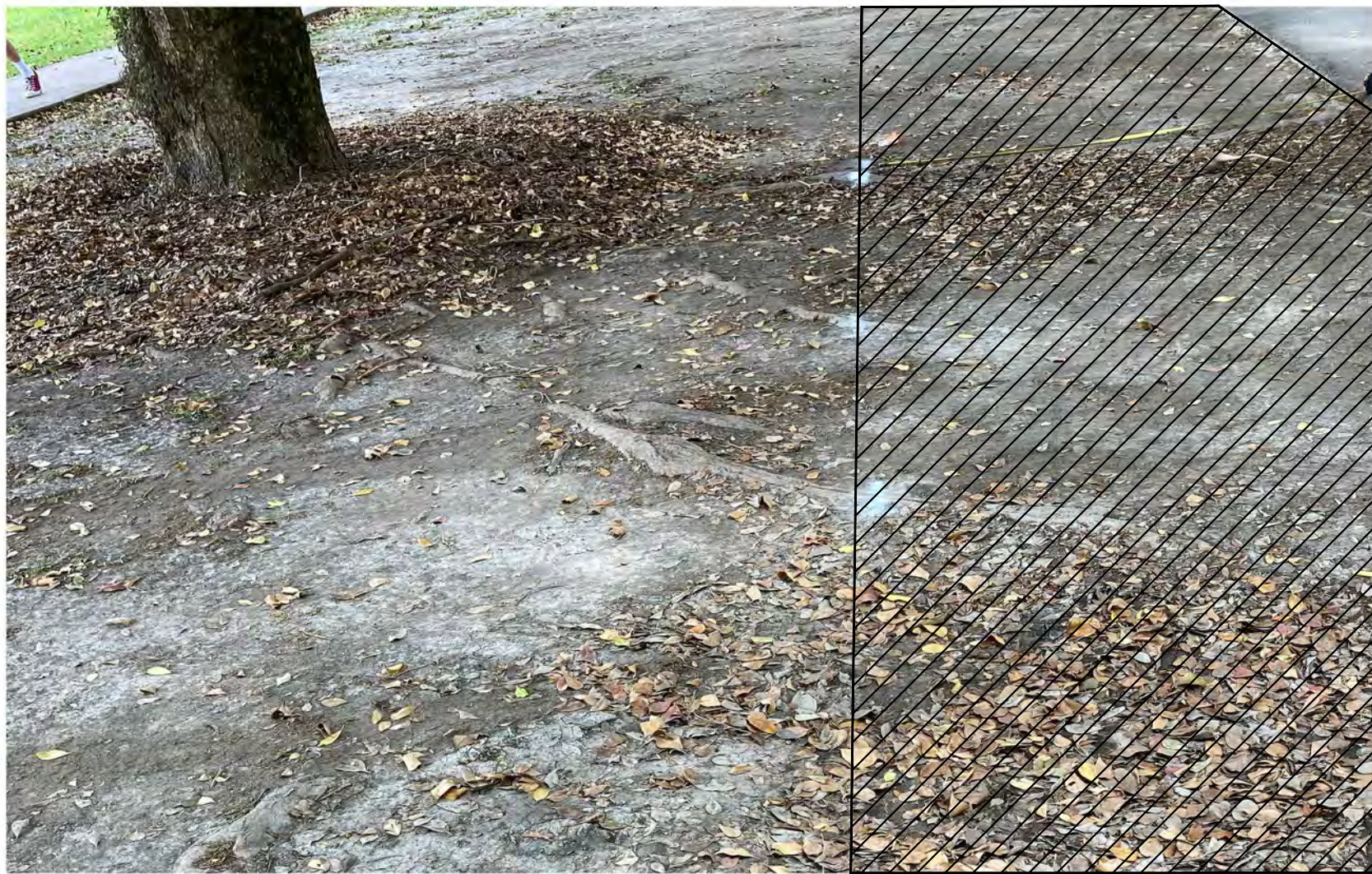
EXISTING TREE #4 - BLACK OLIVE APPROX. 38" DBH, 45' HT, 60' SPR.