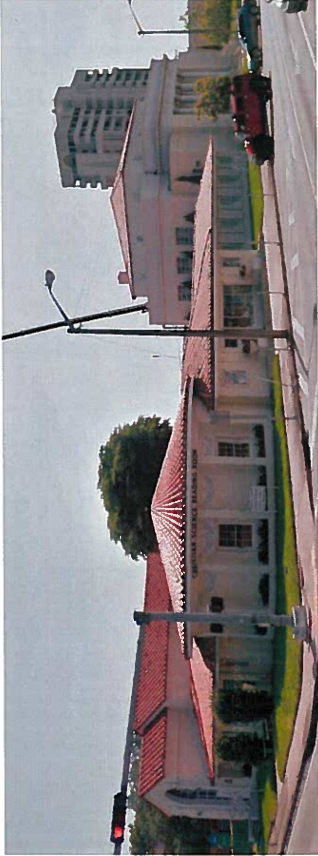
410 Andalusia Ave