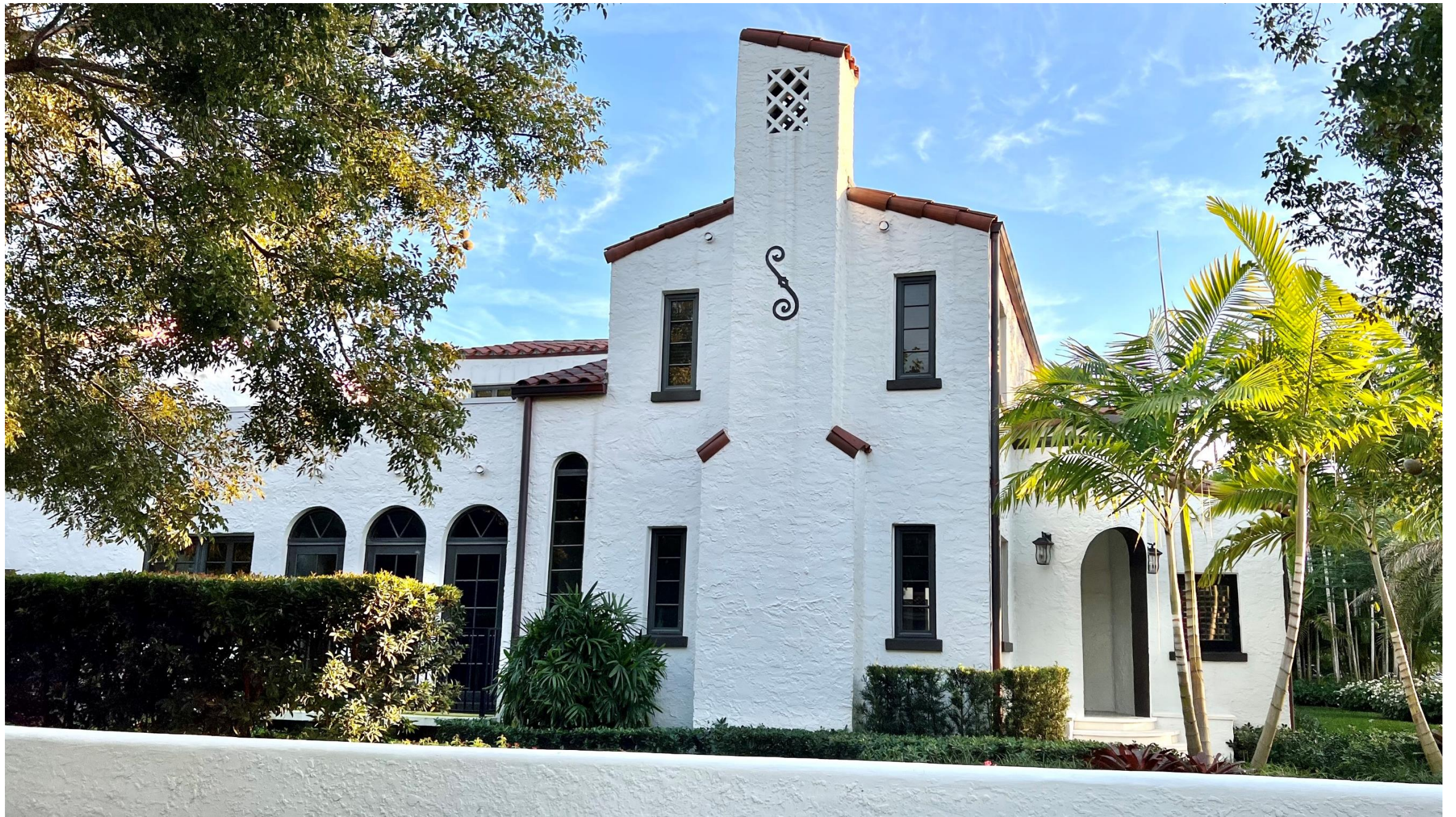
North Façade – After