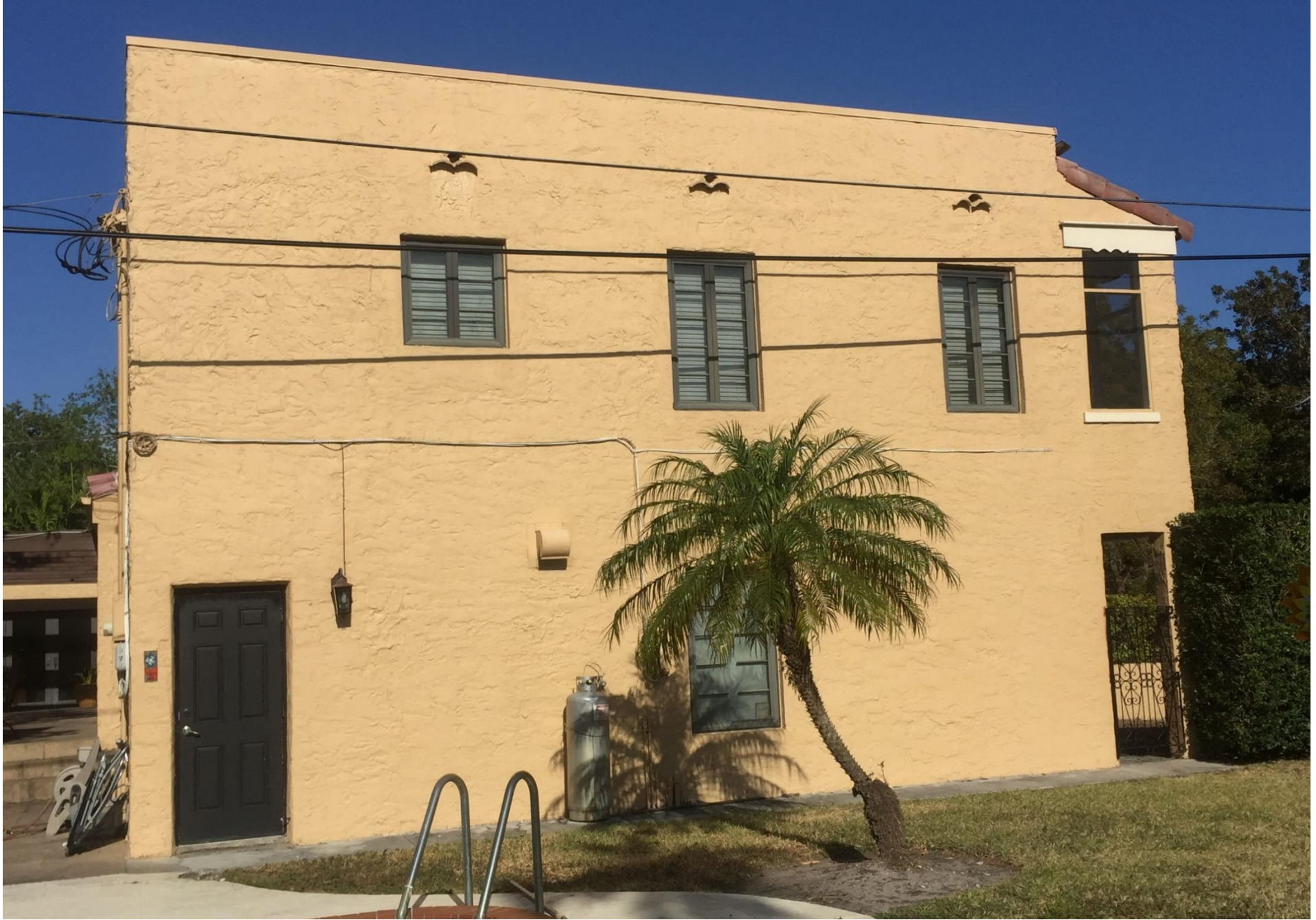
East Facade – Before