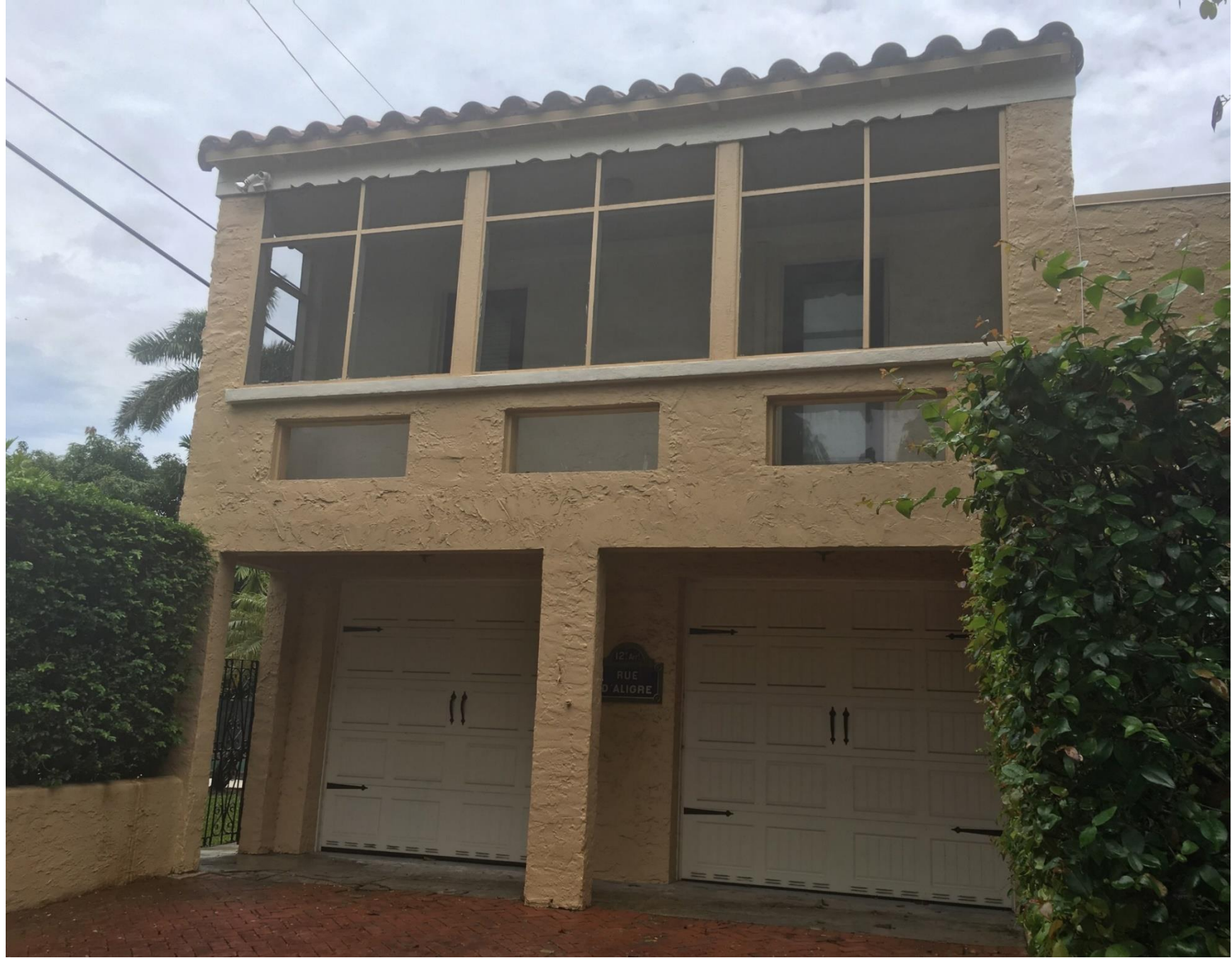
North Façade – Before