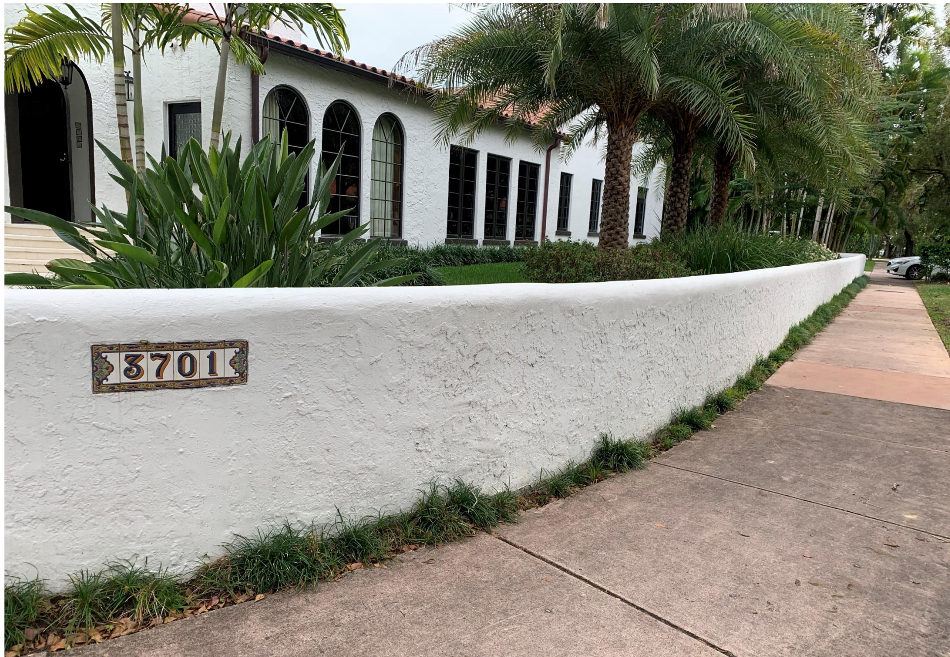
Northwest Corner and Perimeter Wall – After