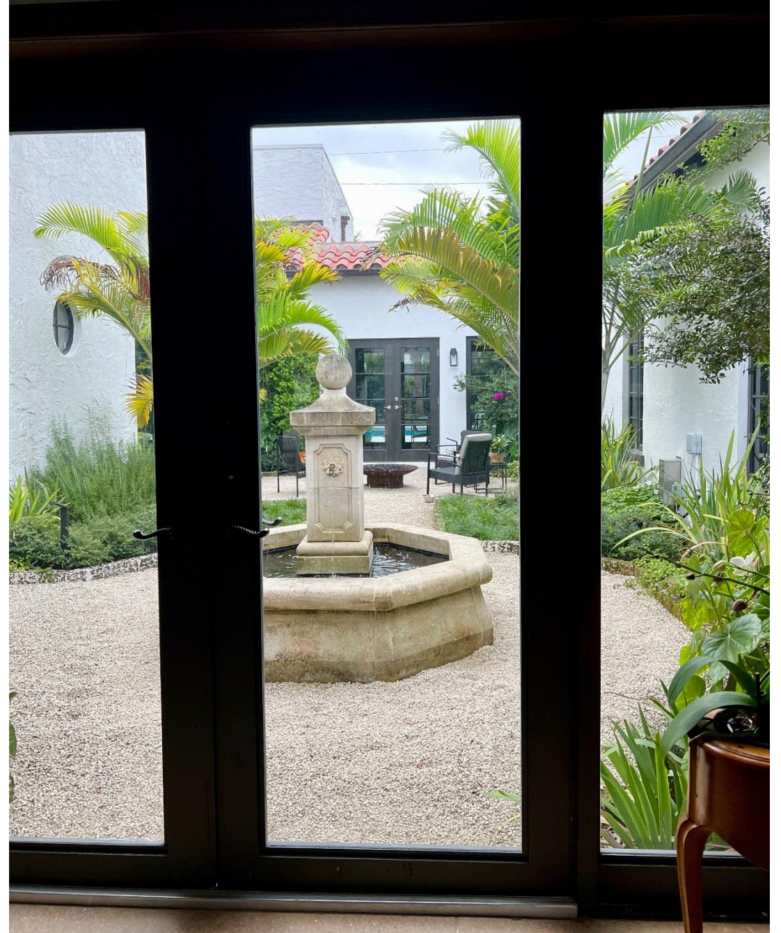
Courtyard Looking East – Before (Left) and After (Right)