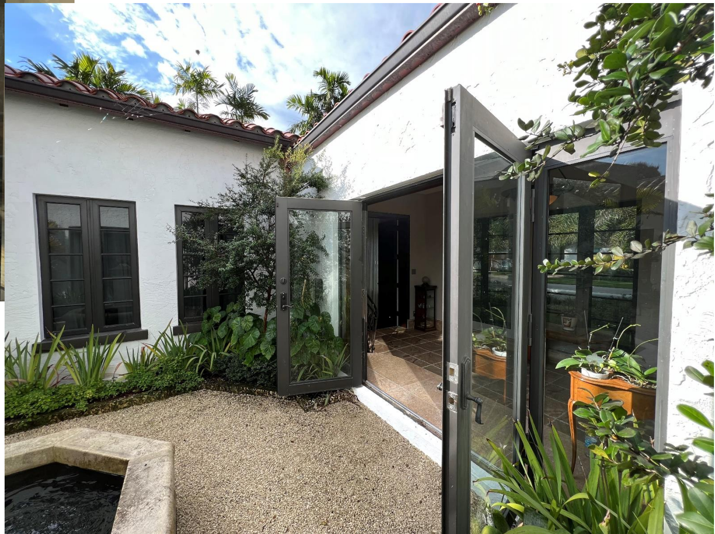
Courtyard Looking North – Before (Left) and After (Right)