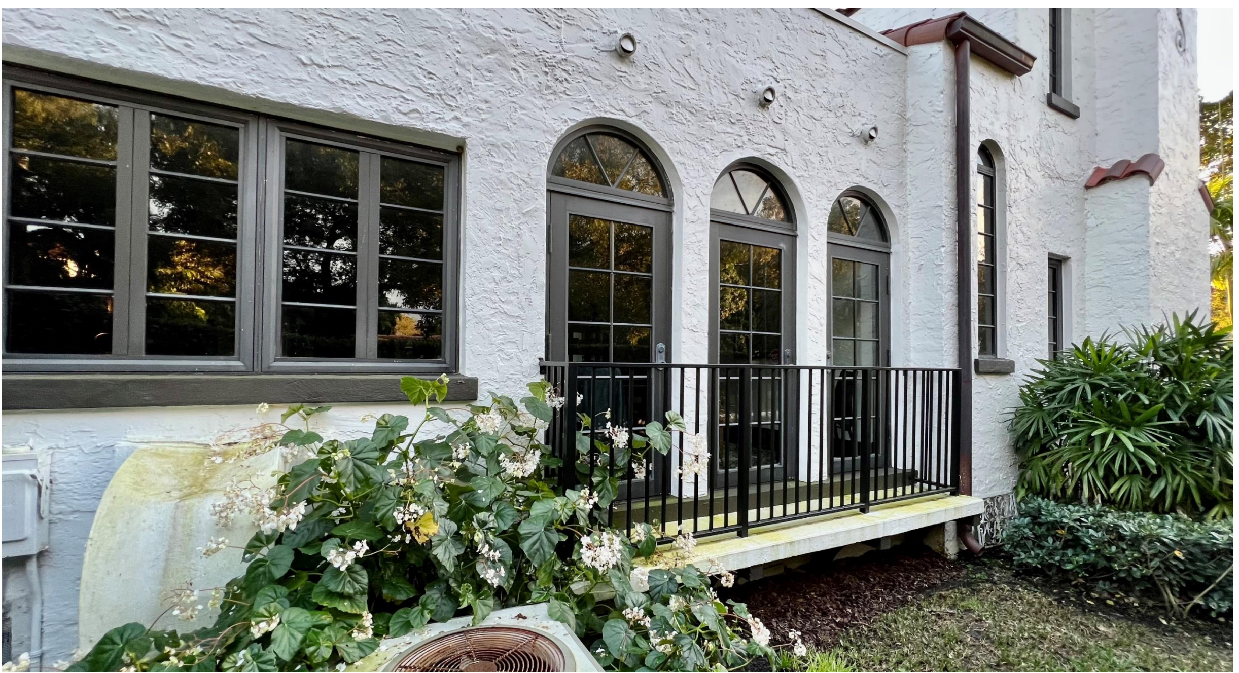
North Façade – After