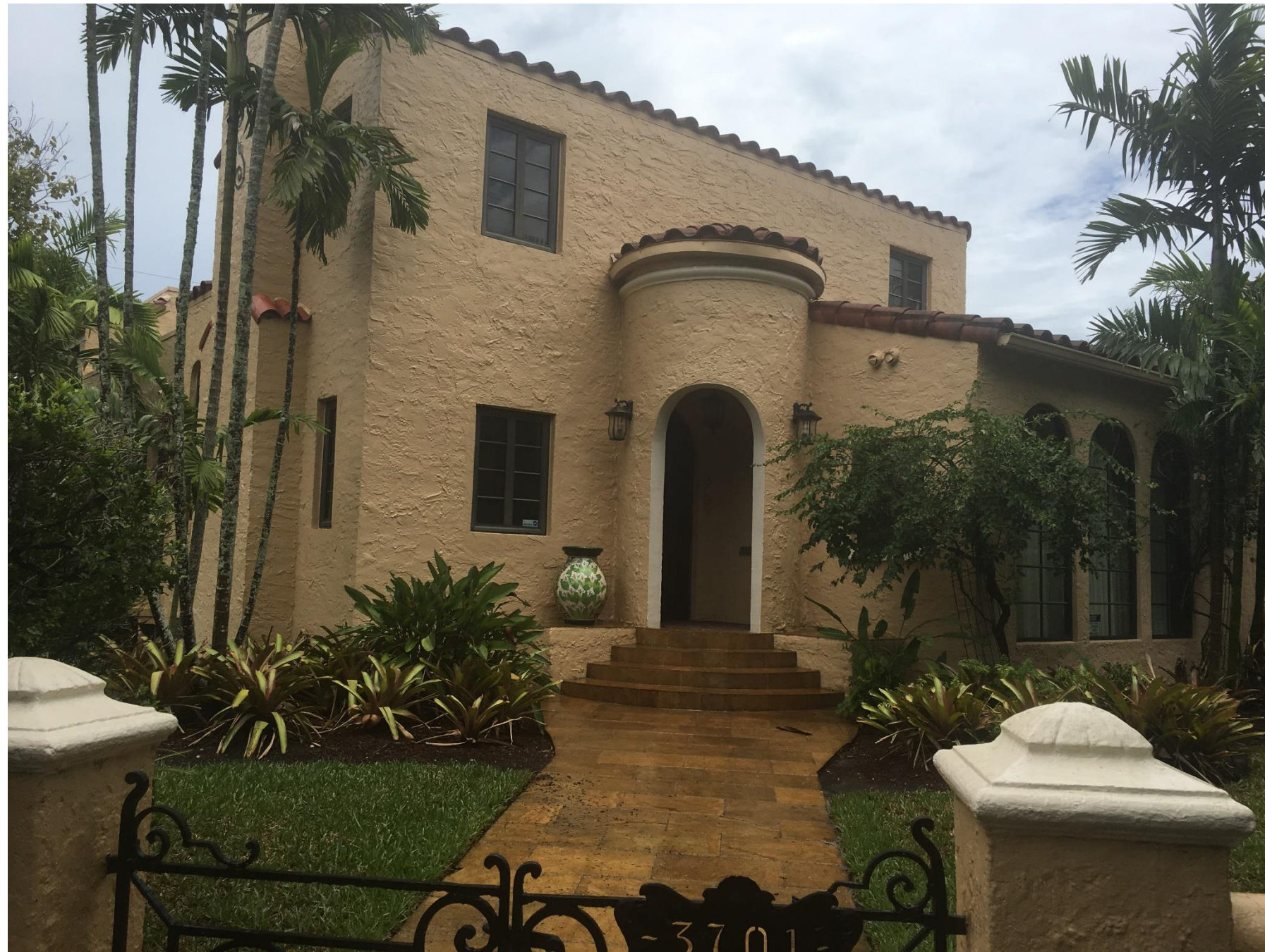
Northwest Corner Entry - Before