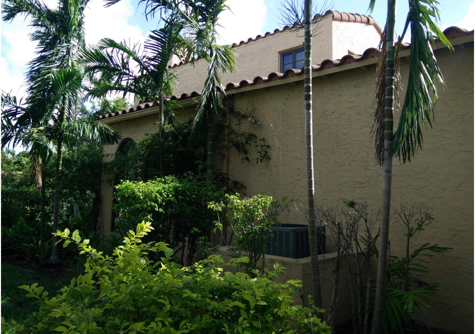
West Façade – Before