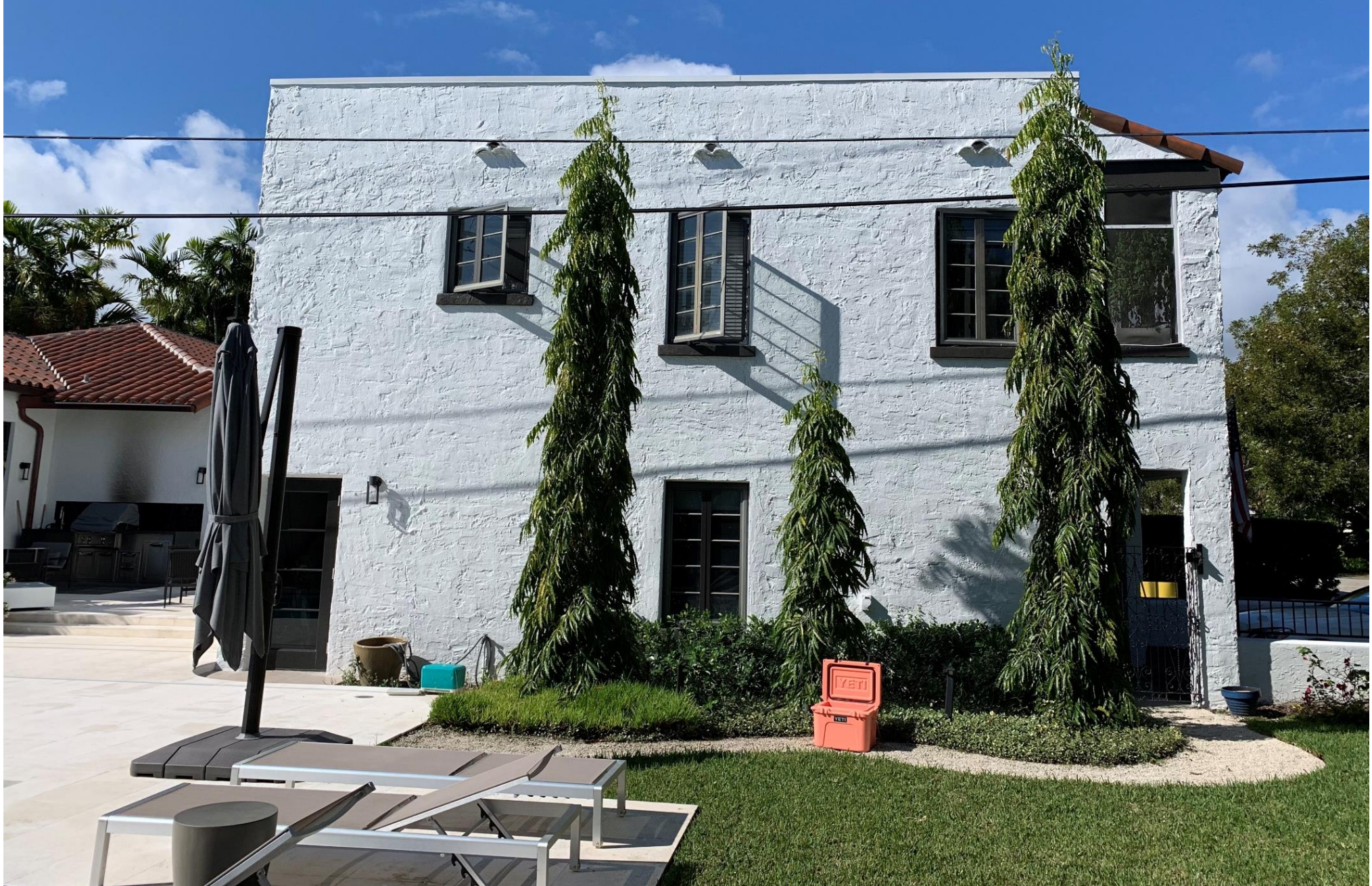
East Facade – After