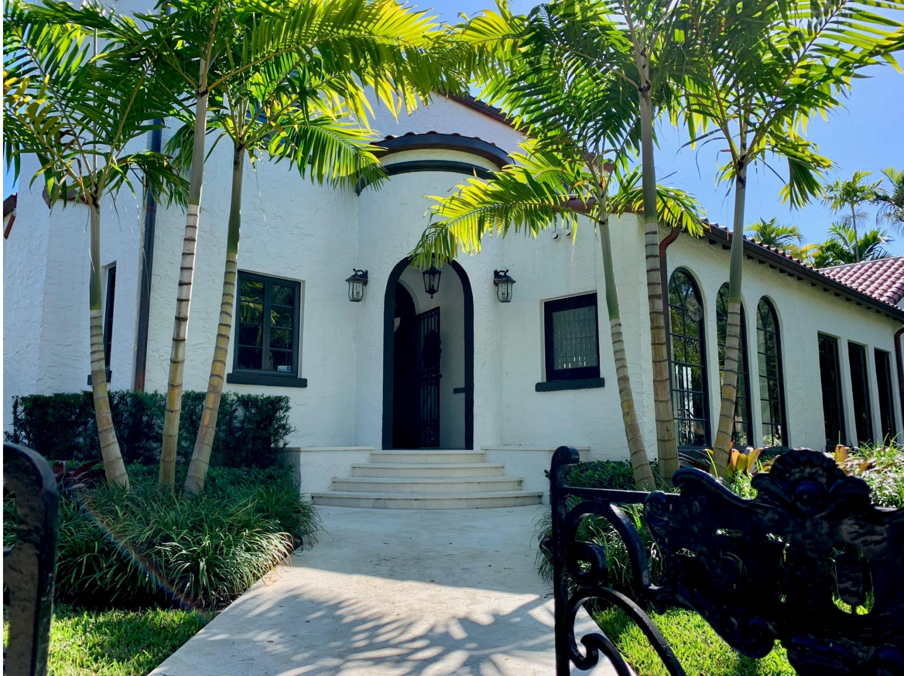
Northwest Corner Entry - After