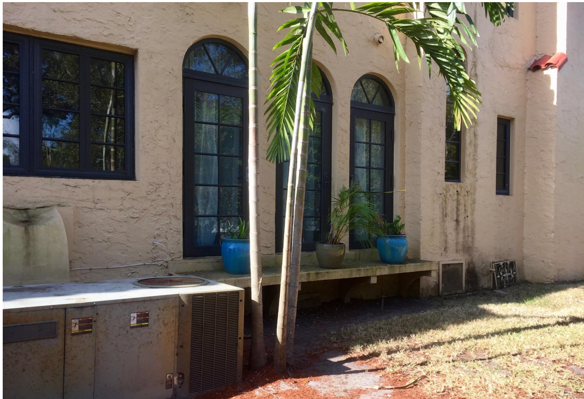
North Façade – Before