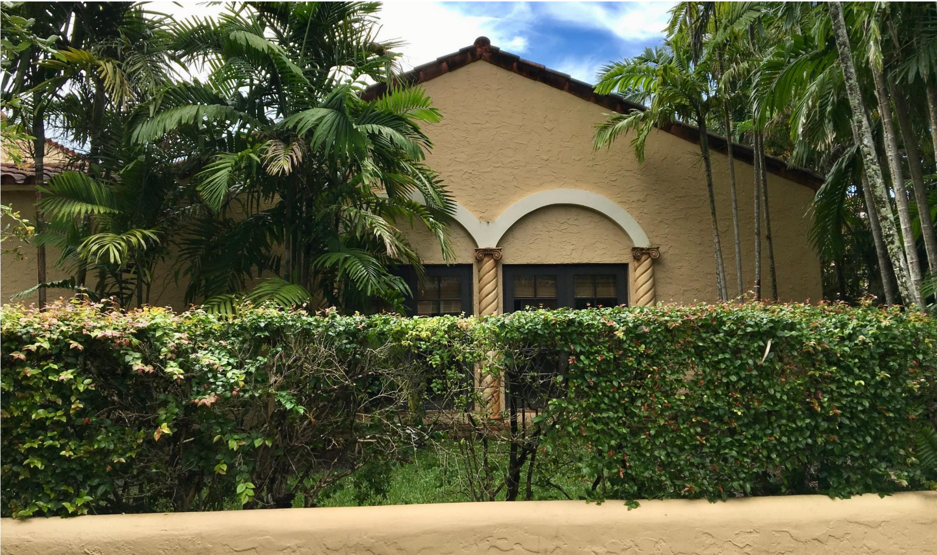
West Façade – Before