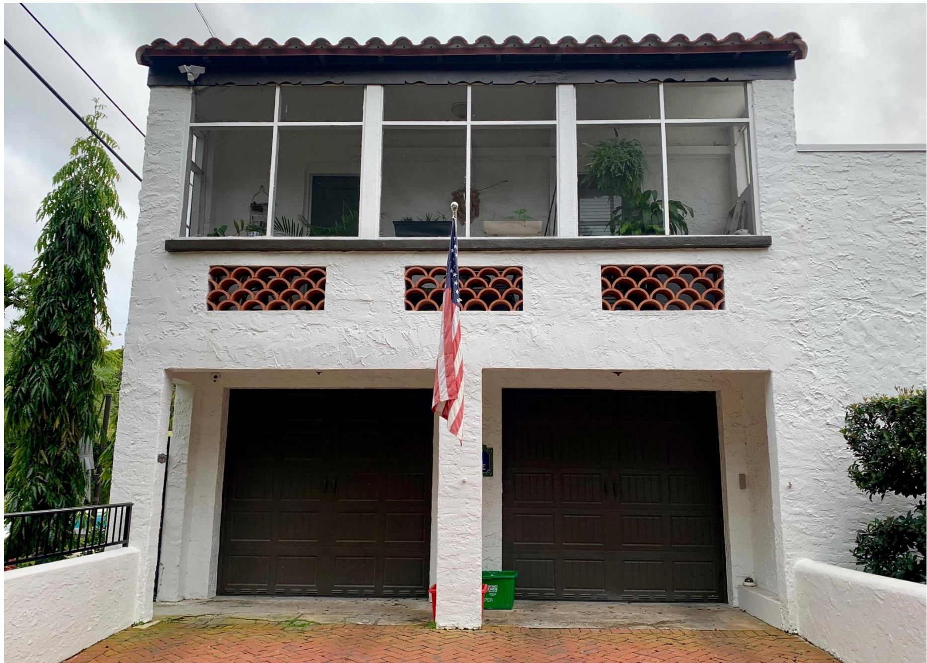
North Façade – After