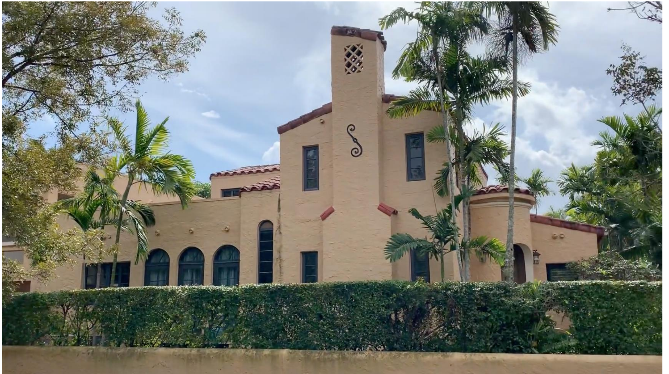
North Façade – Before