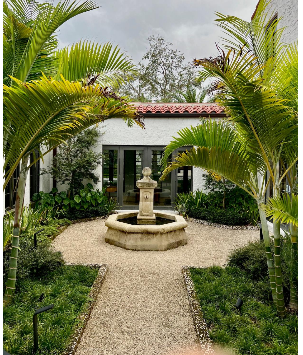
Courtyard Looking West – Before (Left) and After (Right)