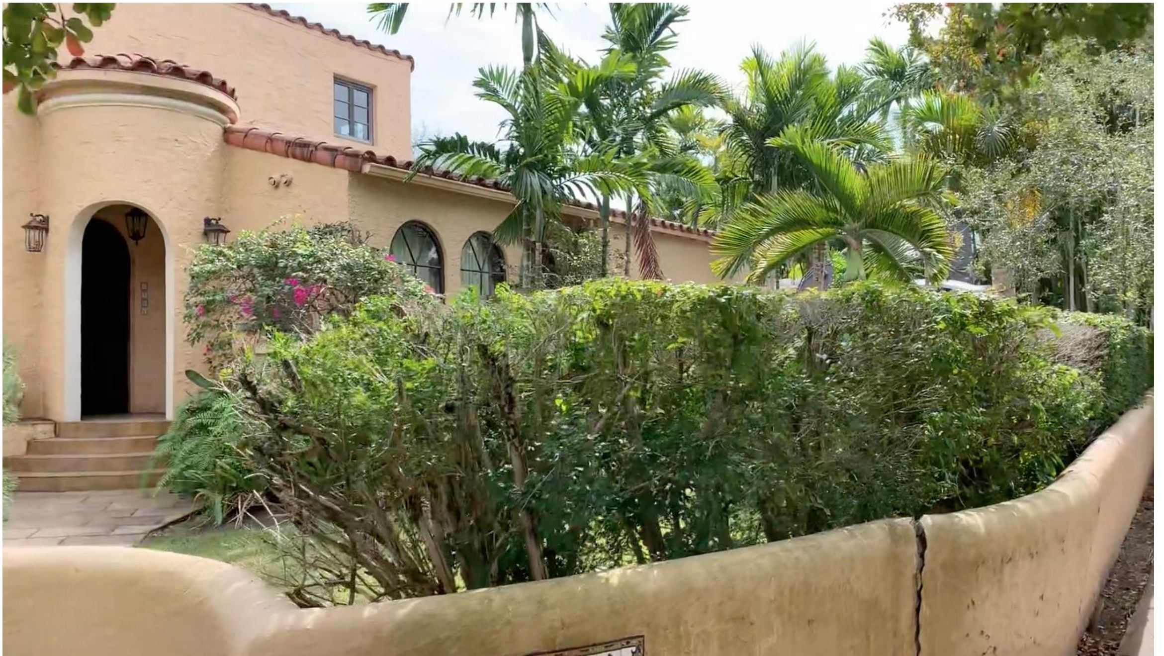
Northwest Corner and Perimeter Wall – Before