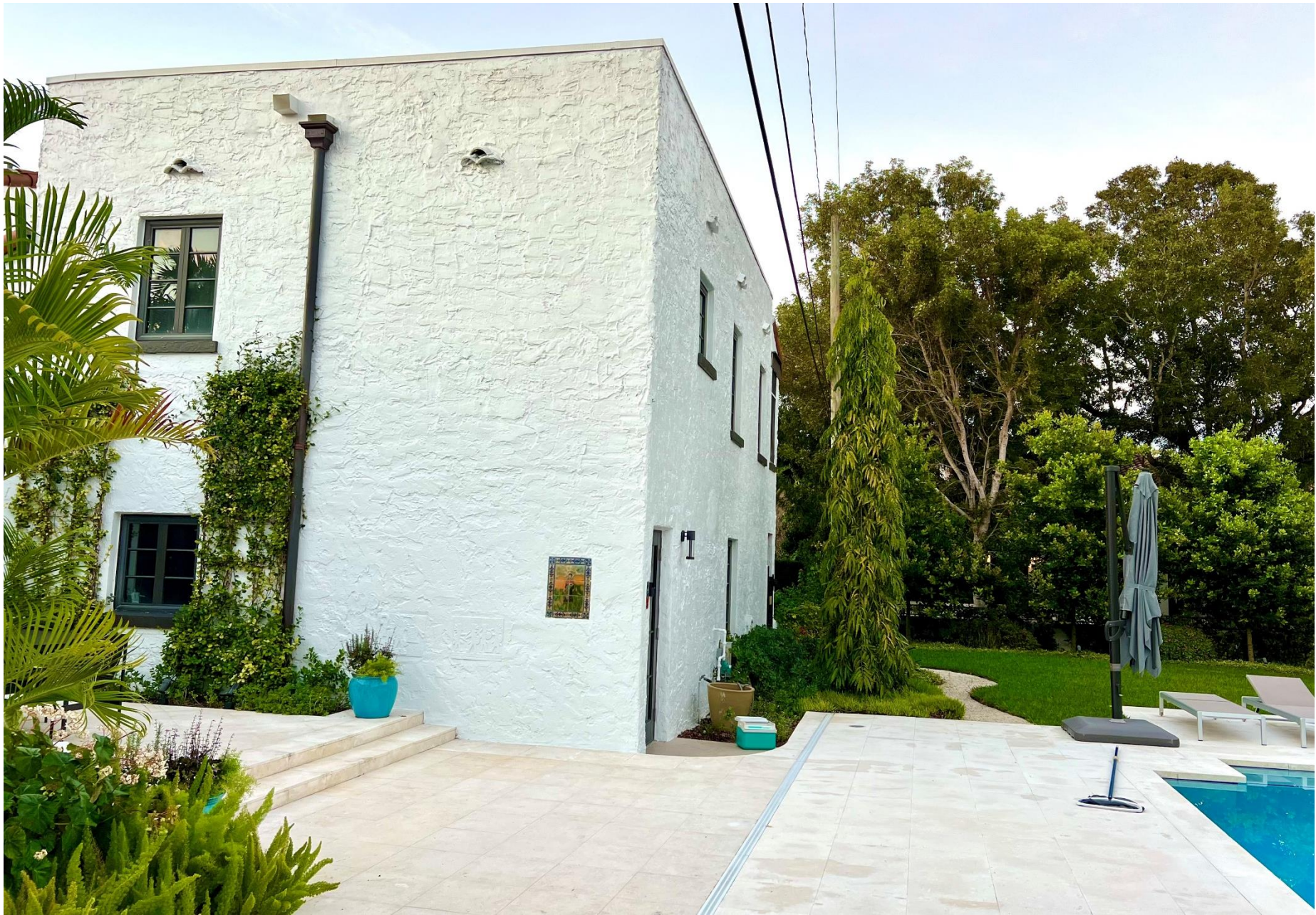
South Façade (Back of Garage) – After