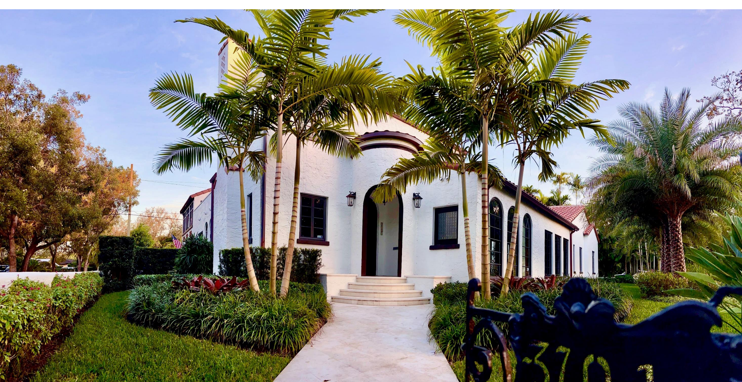
Northwest Corner Entry - After