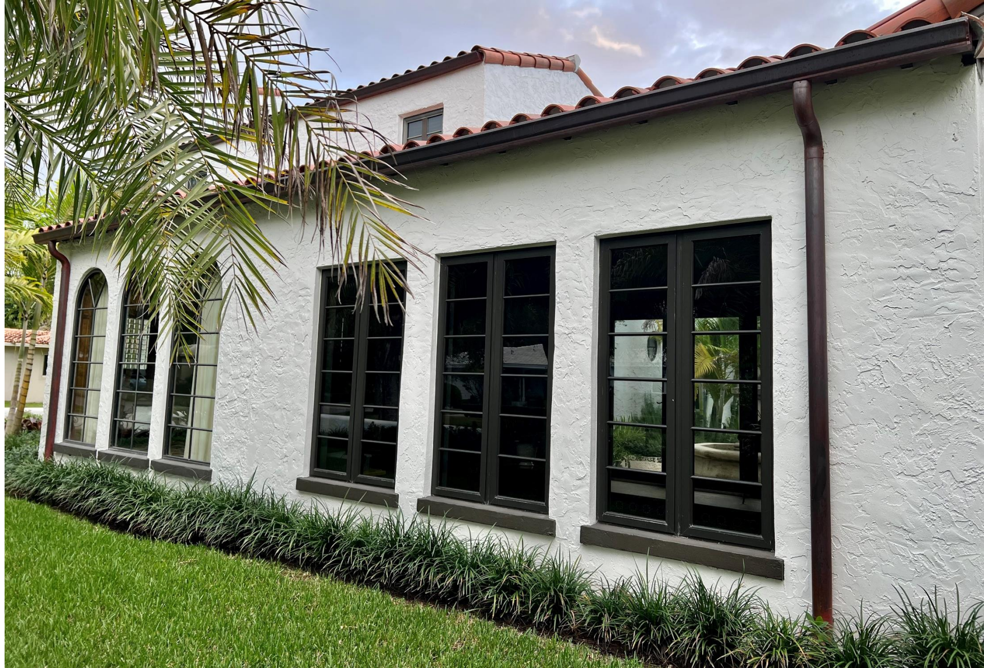
West Façade – After