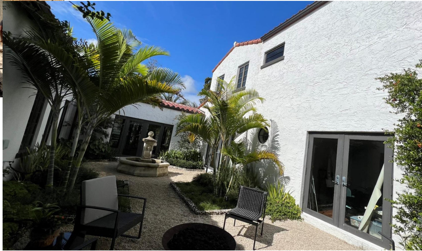
South Façade – Before and After