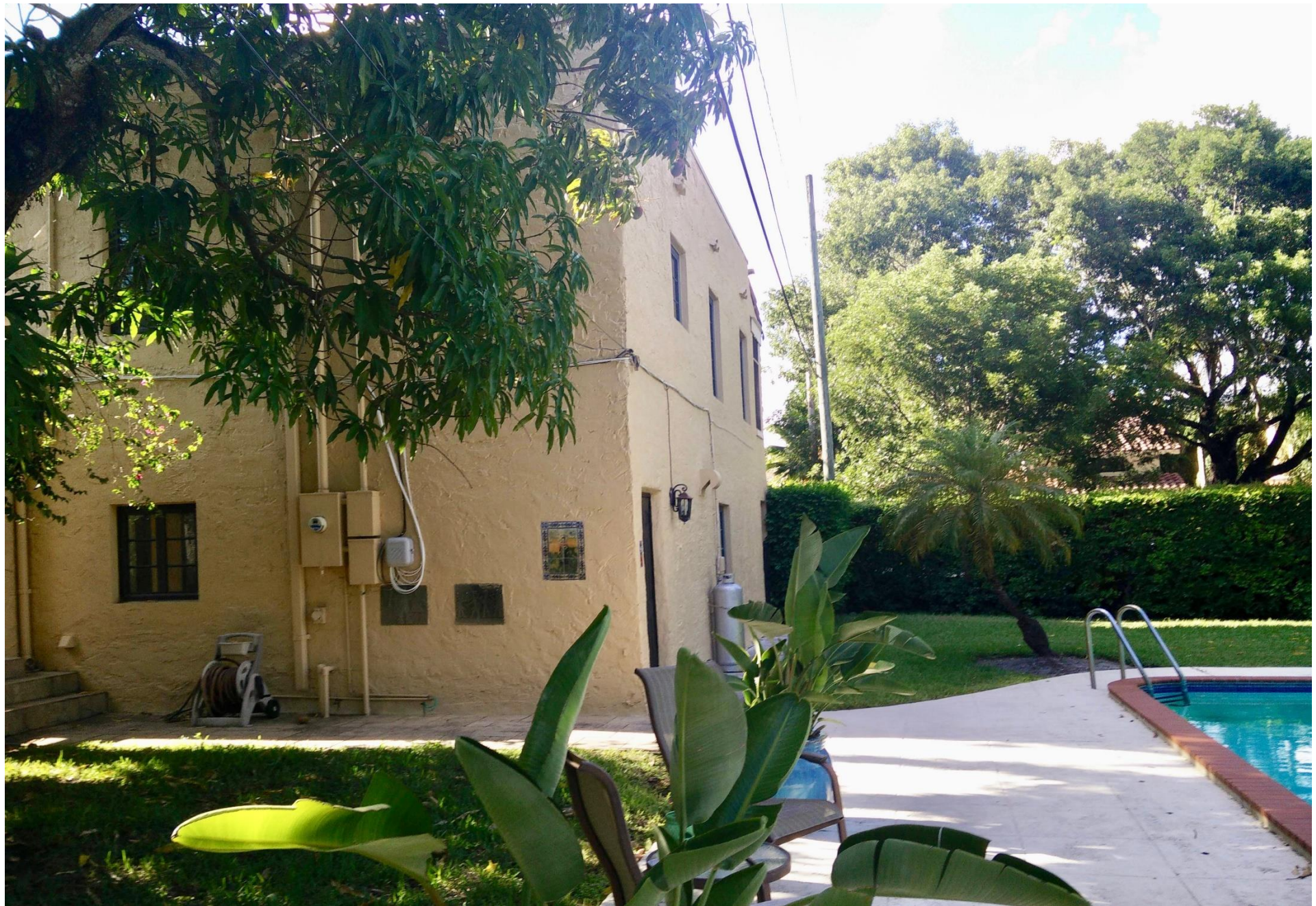
South Façade (Back of Garage) – Before