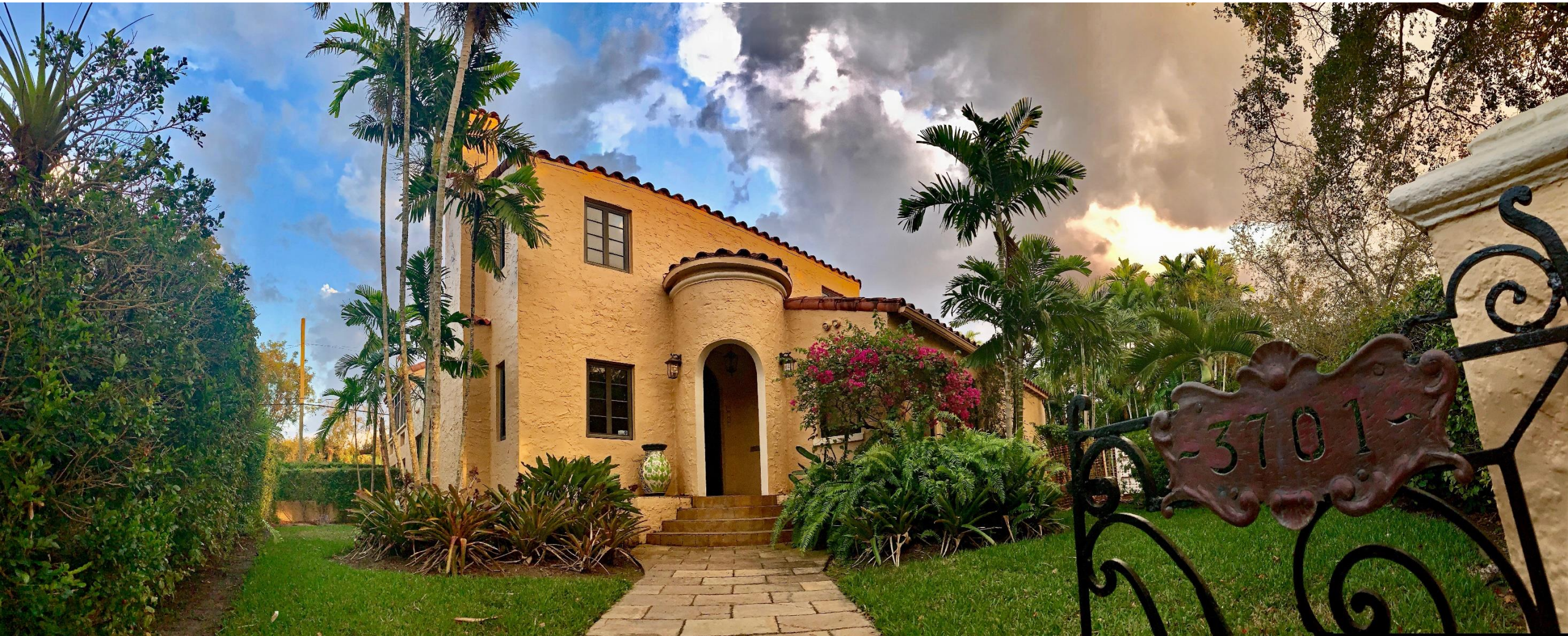
Northwest Corner Entry - Before