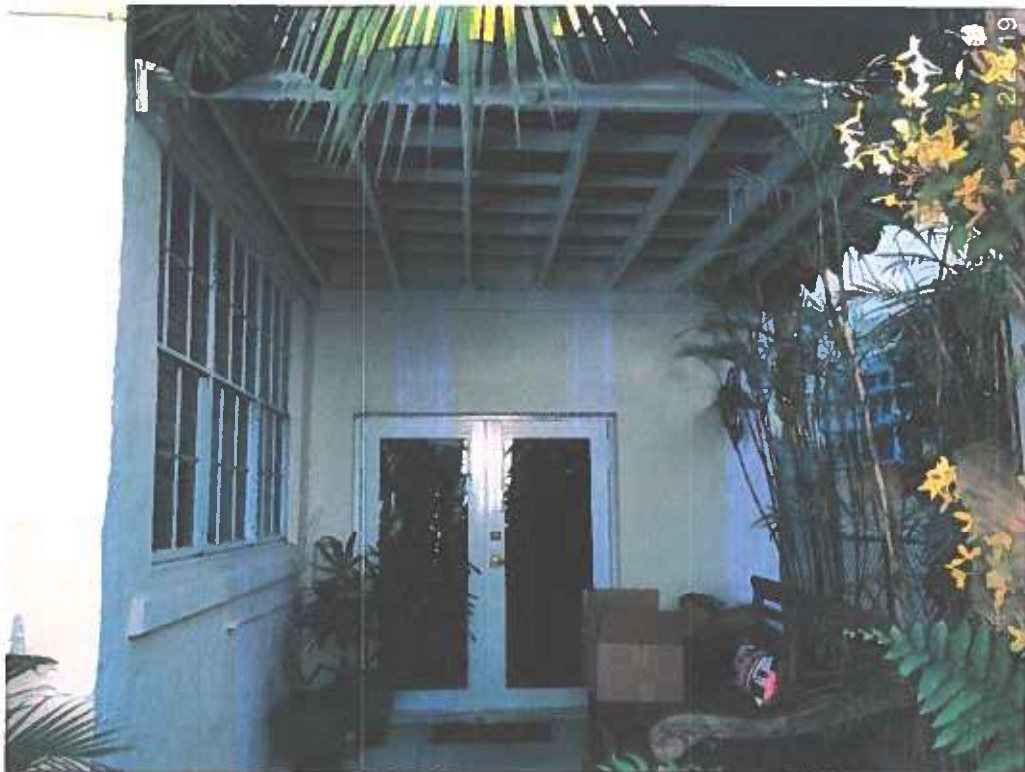
CODE ENFORCEMENT PHOTOGRAPH 6913 TALAVERA STREET

EXISTING WORK DESIGNED BY OTHERS. IMAGES PROVIDED BY WILLIAM HAMILTON ARTHUR ARCHITECT, INC. 2920 PONCE DE LEON BLVD CORAL GABLES, FLORIDA 33134-6811 (305) 770-6100 INFO@WHAIV.US STATE OF FLORIDA No. AA26003053