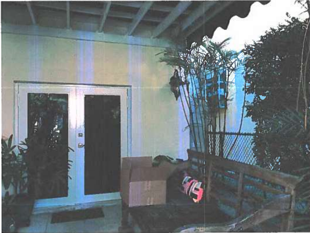
CODE ENFORCEMENT PHOTOGRAPH 6913 TALAVERA STREET

EXISTING WORK DESIGNED BY OTHERS. IMAGES PROVIDED BY WILLIAM HAMILTON ARTHUR ARCHITECT, INC. 2920 PONCE DE LEON BLVD CORAL GABLES, FLORIDA 33134-6811 (305) 770-6100 INFO@WHAIV.US STATE OF FLORIDA No. AA26003053