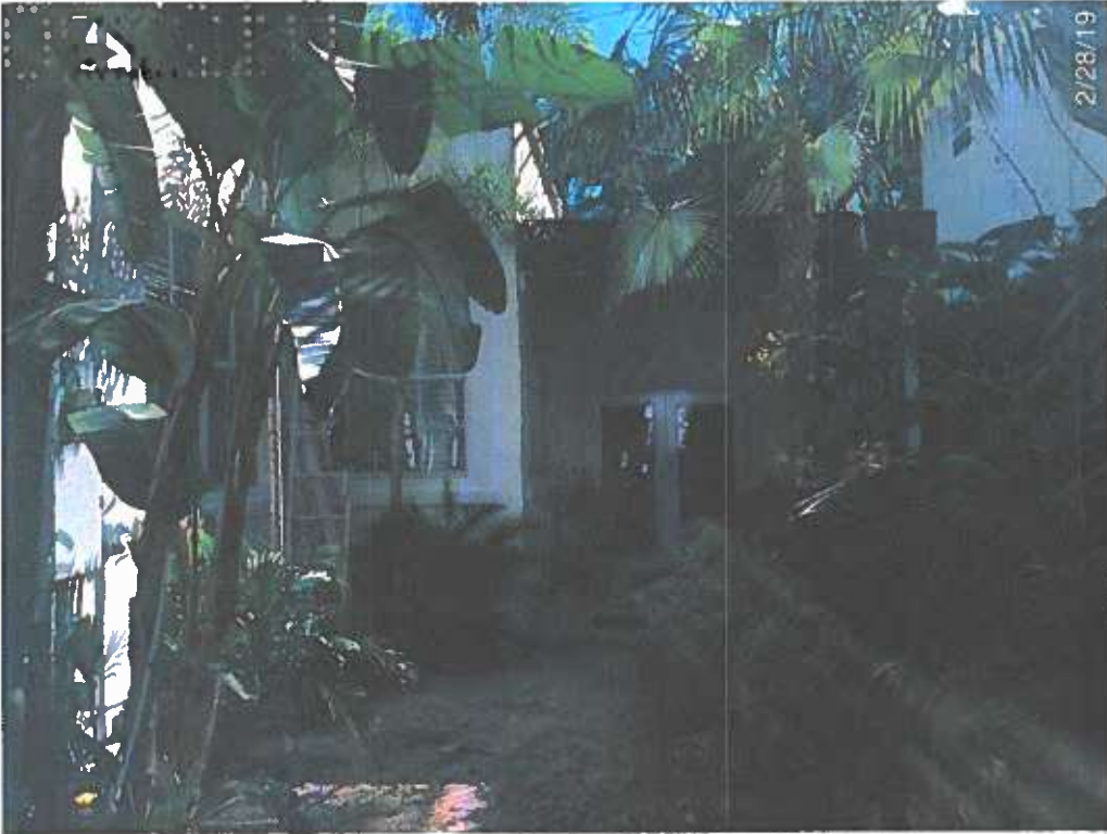
CODE ENFORCEMENT PHOTOGRAPH 6913 TALAVERA STREET

EXISTING WORK DESIGNED BY OTHERS. IMAGES PROVIDED BY WILLIAM HAMILTON ARTHUR ARCHITECT, INC. 2920 PONCE DE LEON BLVD CORAL GABLES, FLORIDA 33134-6811 (305) 770-6100 INFO@WHAIV.US STATE OF FLORIDA No. AA26003053