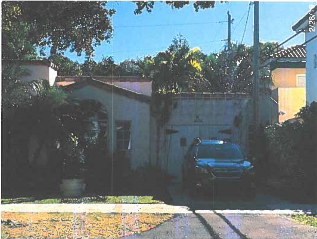
CODE ENFORCEMENT PHOTOGRAPH WEST ELEVATION 6913 TALAVERA STREET

EXISTING WORK DESIGNED BY OTHERS. IMAGES PROVIDED BY WILLIAM HAMILTON ARTHUR ARCHITECT, INC. 2920 PONCE DE LEON BLVD CORAL GABLES, FLORIDA 33134-6811 (305) 770-6100 INFO@WHAIV.US STATE OF FLORIDA No. AA26003053