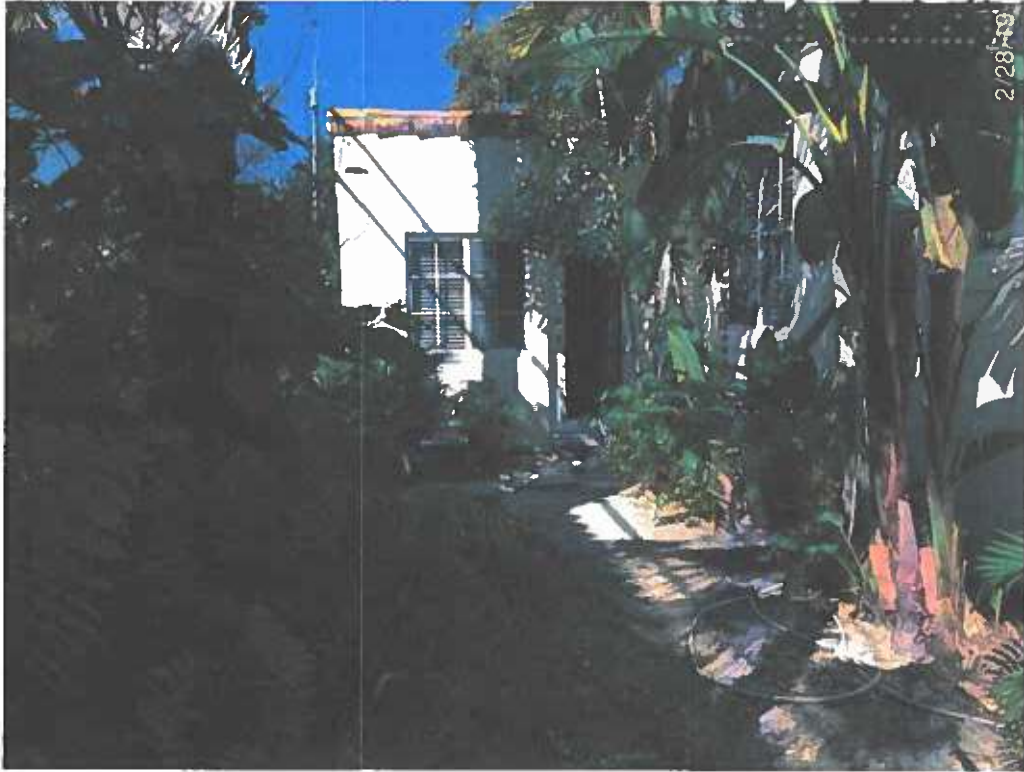
CODE ENFORCEMENT PHOTOGRAPH 6913 TALAVERA STREET