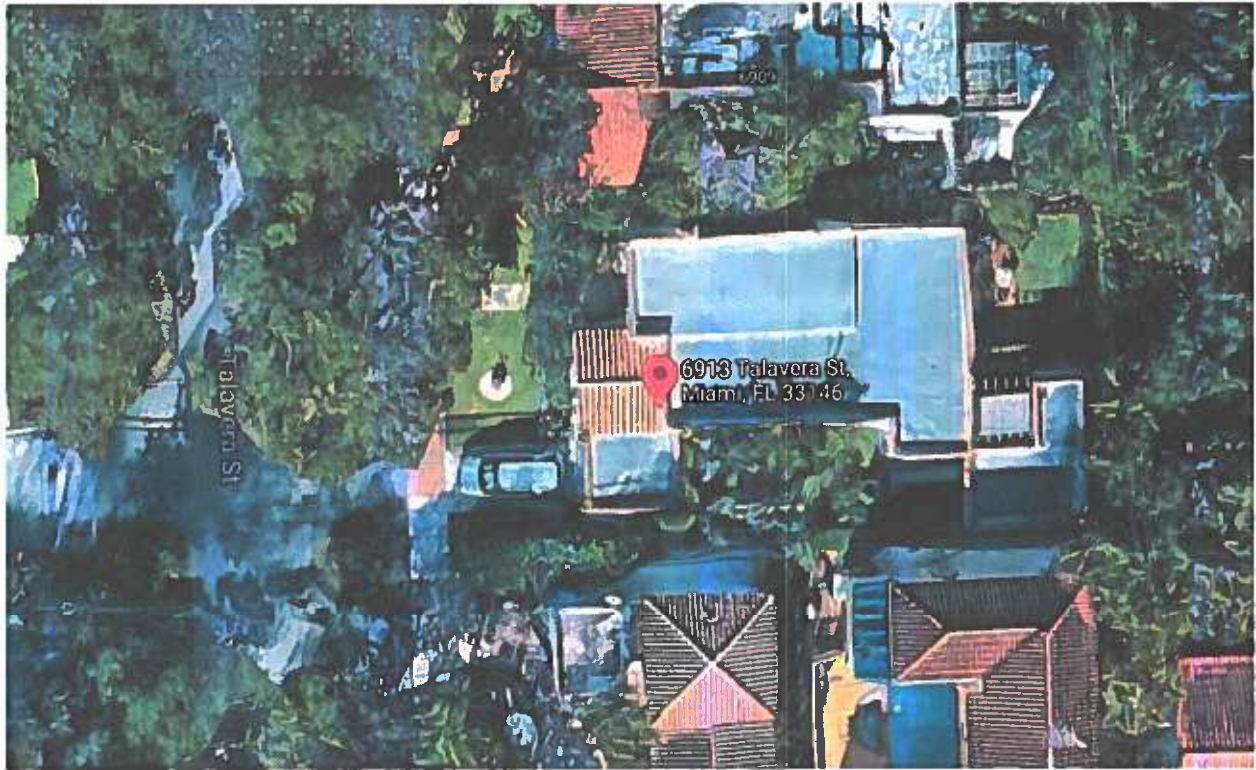
EXISTING ROOF CONDITIONS AT 6913 TALAVERA STREET CORAL GABLES, FL

EXISTING WORK DESIGNED BY OTHERS. IMAGES PROVIDED BY WILLIAM HAMILTON ARTHUR ARCHITECT, INC. 2920 PONCE DE LEON BLVD CORAL GABLES, FLORIDA 33134-6811 (305) 770-6100 INFO@WHAIV.US STATE OF FLORIDA No. AA26003053