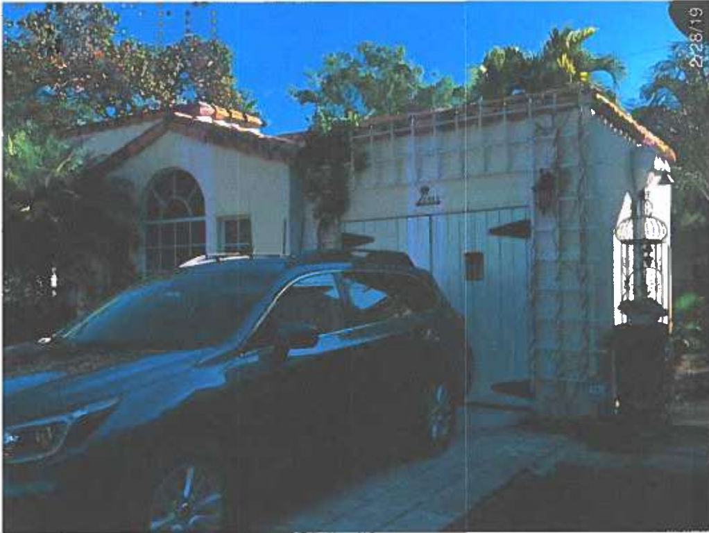
CODE ENFORCEMENT PHOTOGRAPH SOUTH WEST ELEVATION 6913 TALAVERA STREET