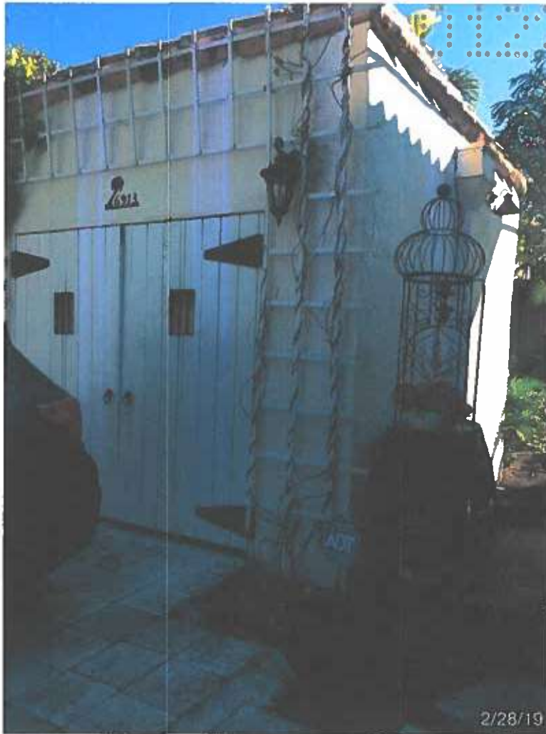
CODE ENFORCEMENT PHOTOGRAPH 6913 TALAVERA STREET