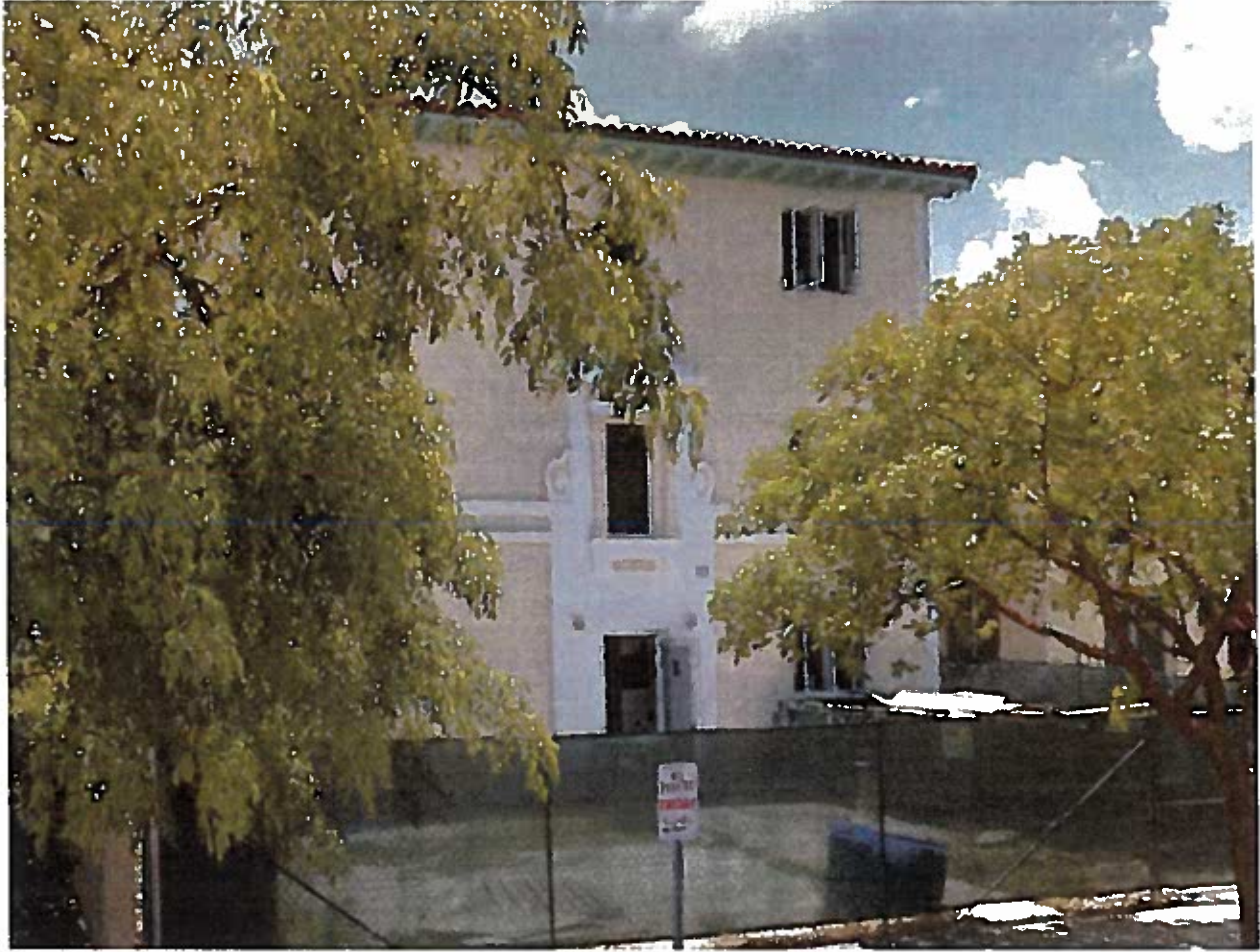
222 Sidonia Ave