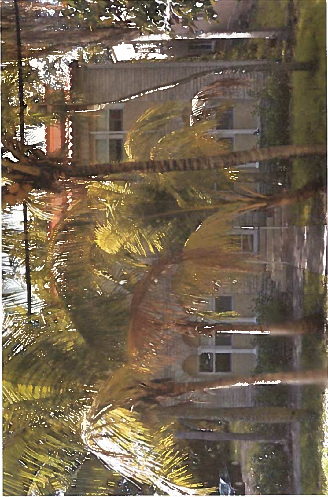
924 Bird Rd