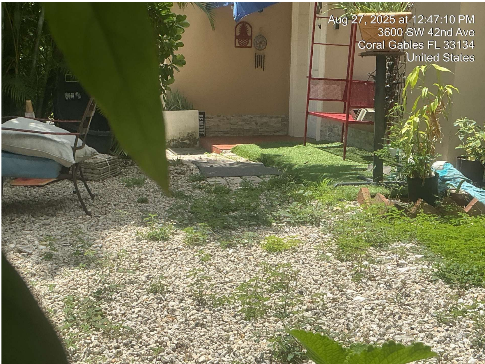
ROCKS INSTALLED IN FRONT YARD