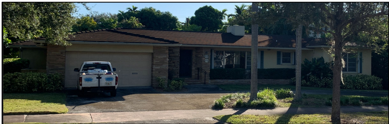
Figure 2: Current photo, 2025