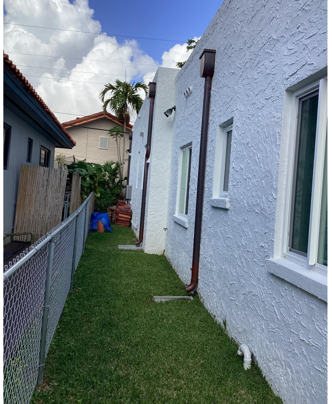
South Façade Looking West – Before & After