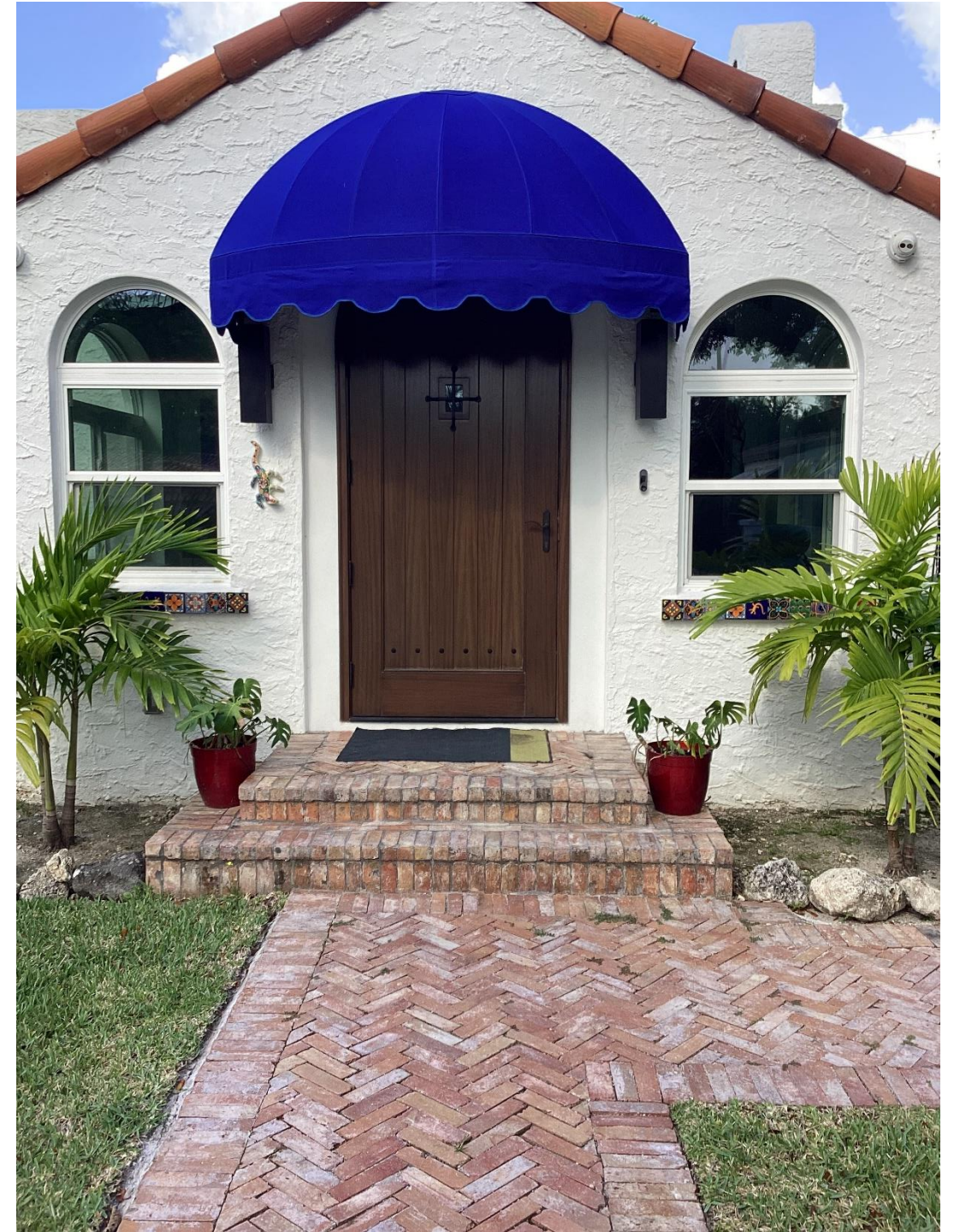
Front Entry Projecting Bay – Before & After