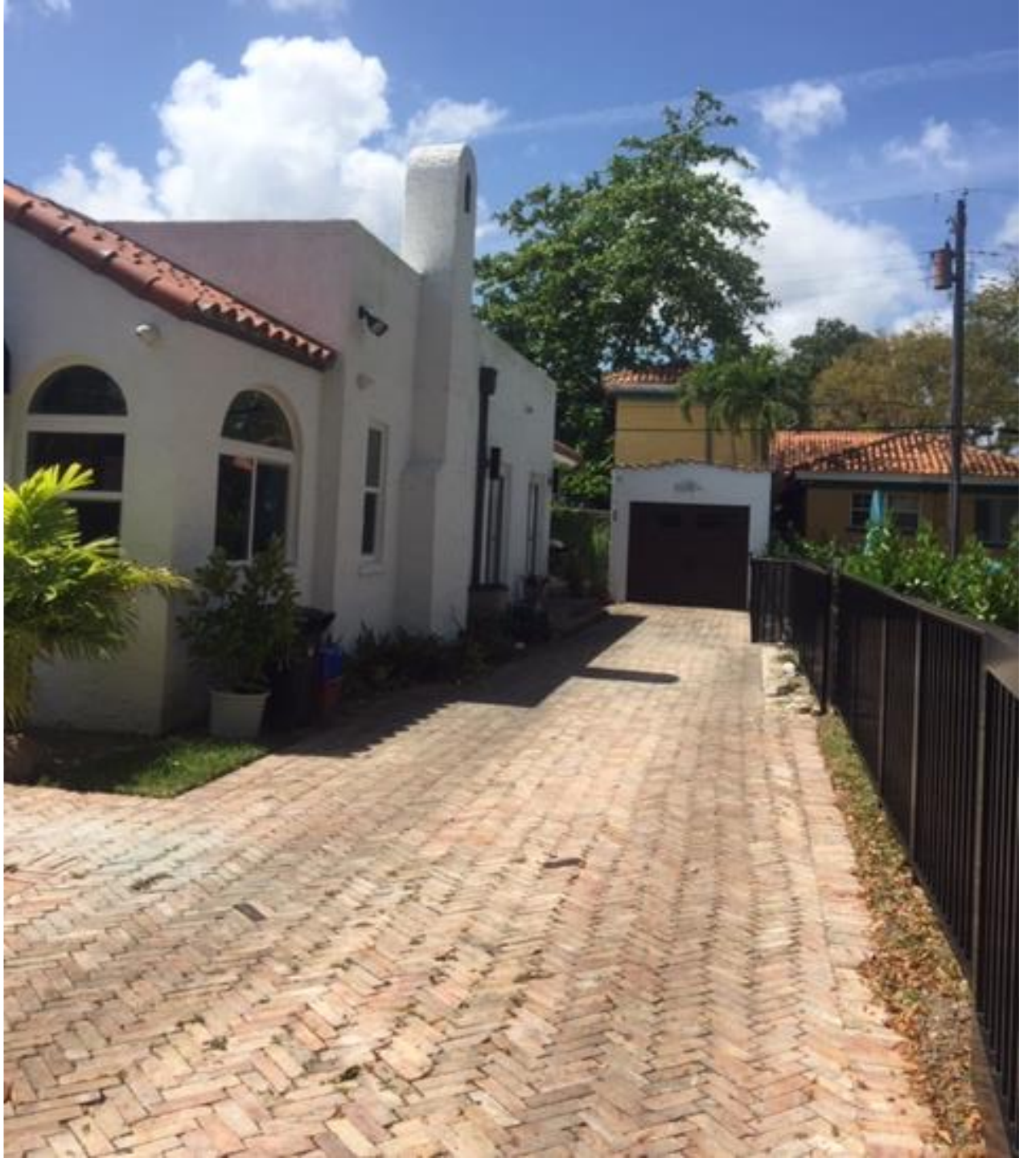
West & North Façades – After