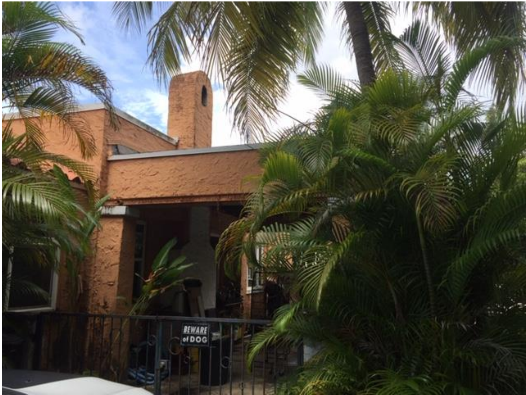
North Façade – Before