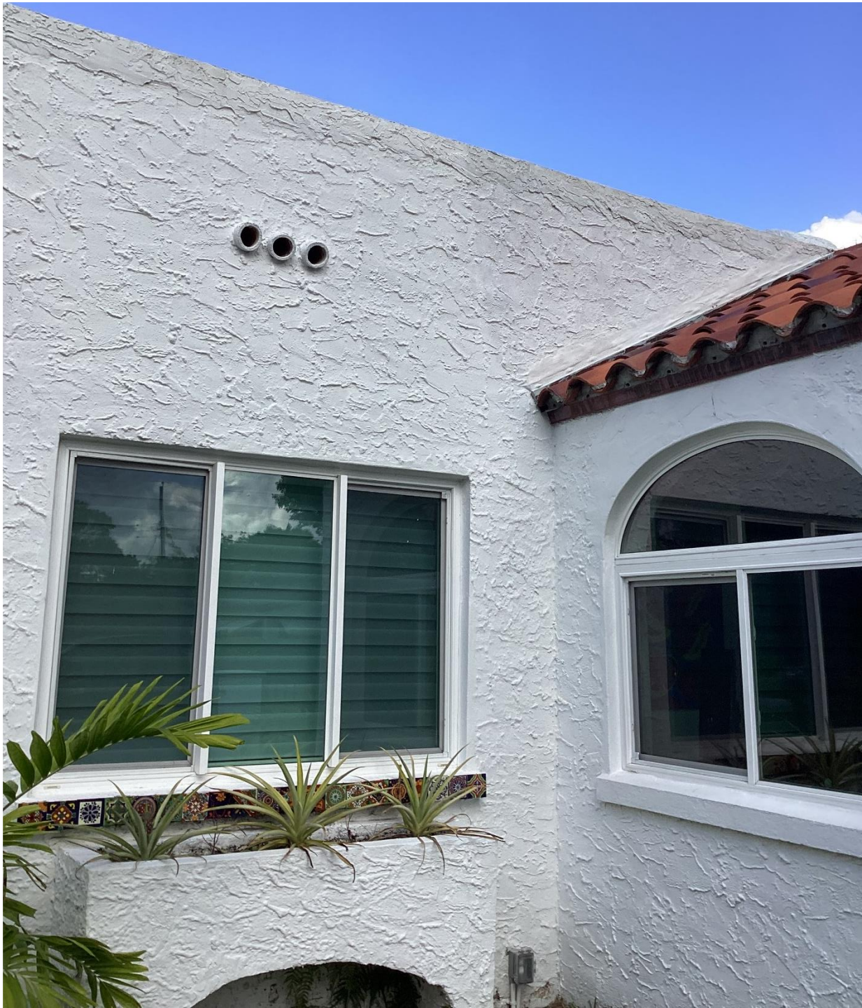
Looking Northwest at Front Entry Projecting Bay – After Note: original round vents, new two- piece barrel tile roof, original flower box