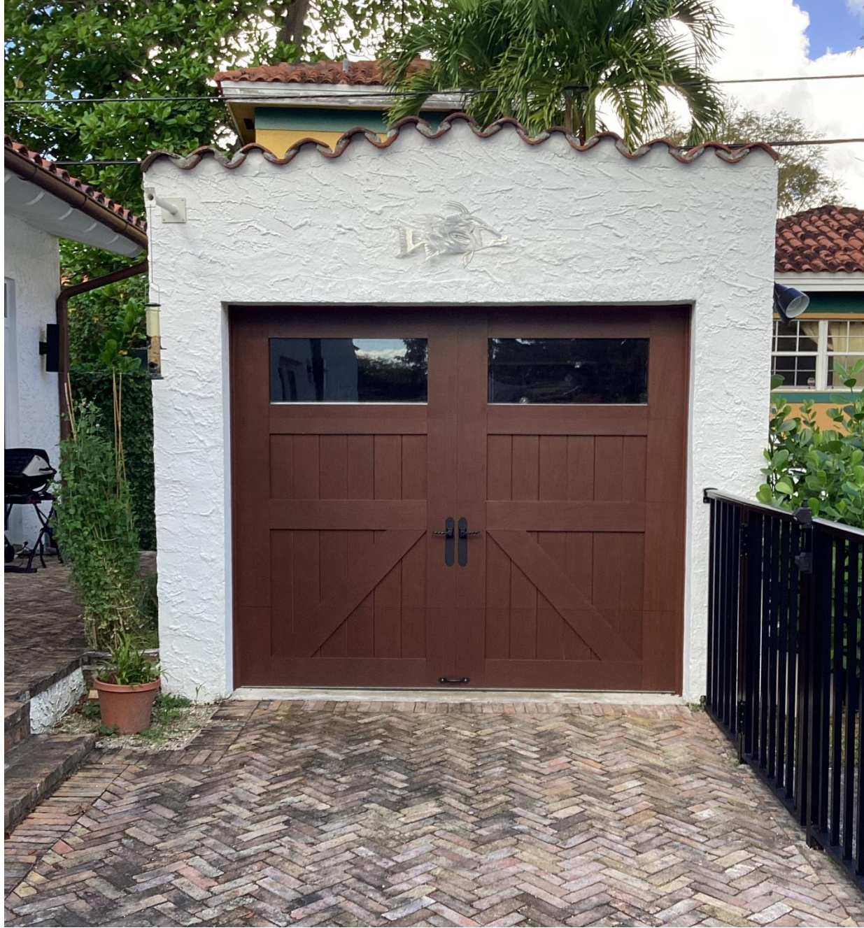
Detached Garage (East Façade) – After