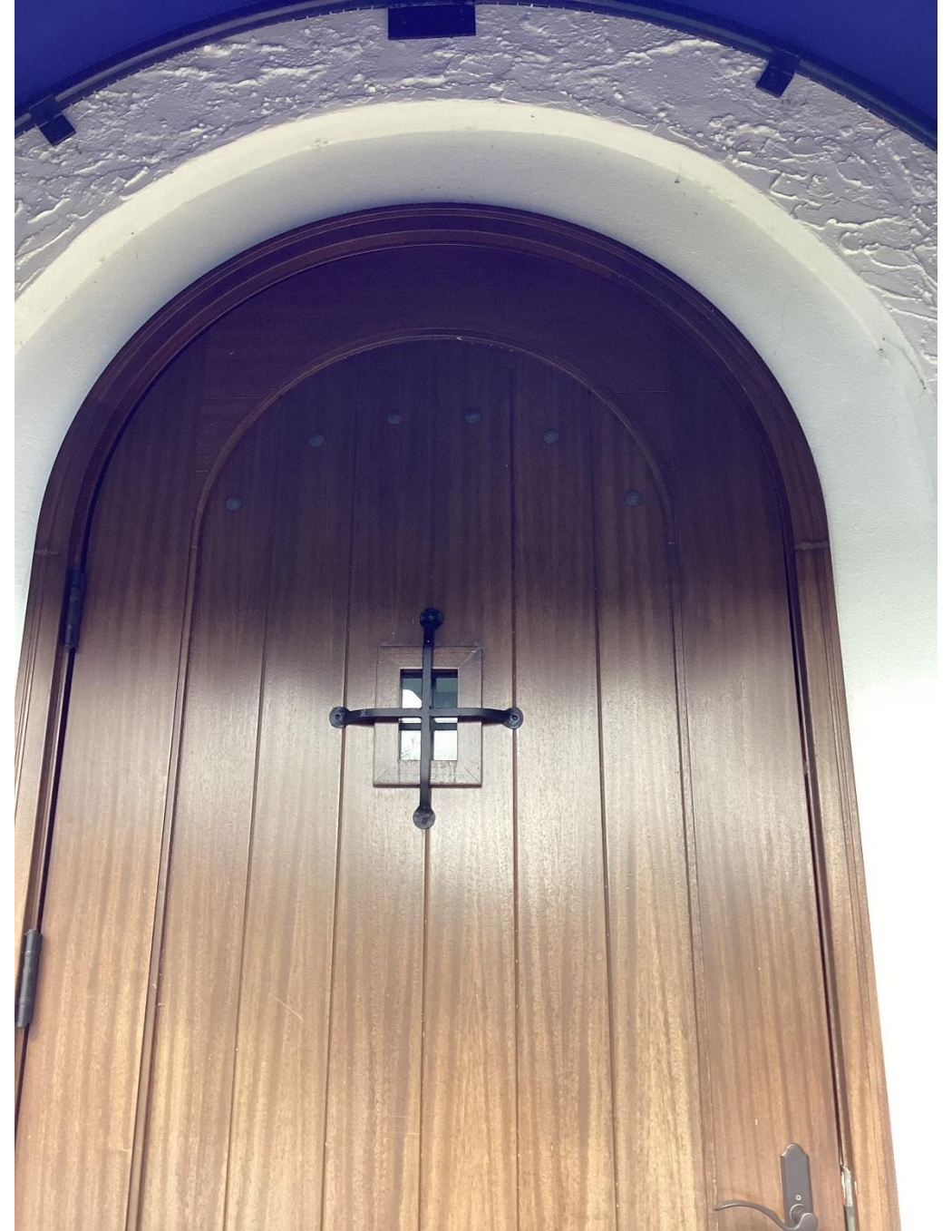
Entry Door – Before & After