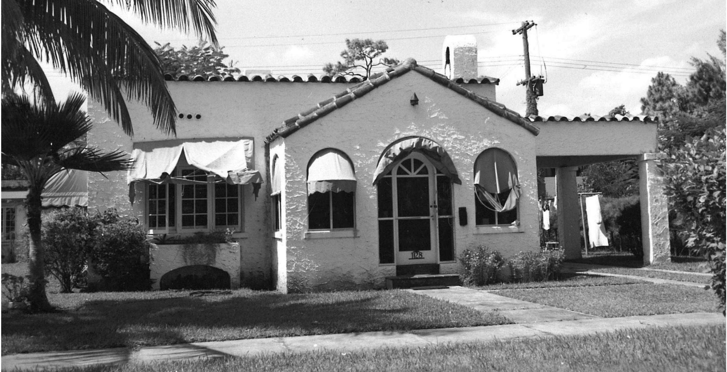
Historic Photo, c.1940s 1206 Cordova Street