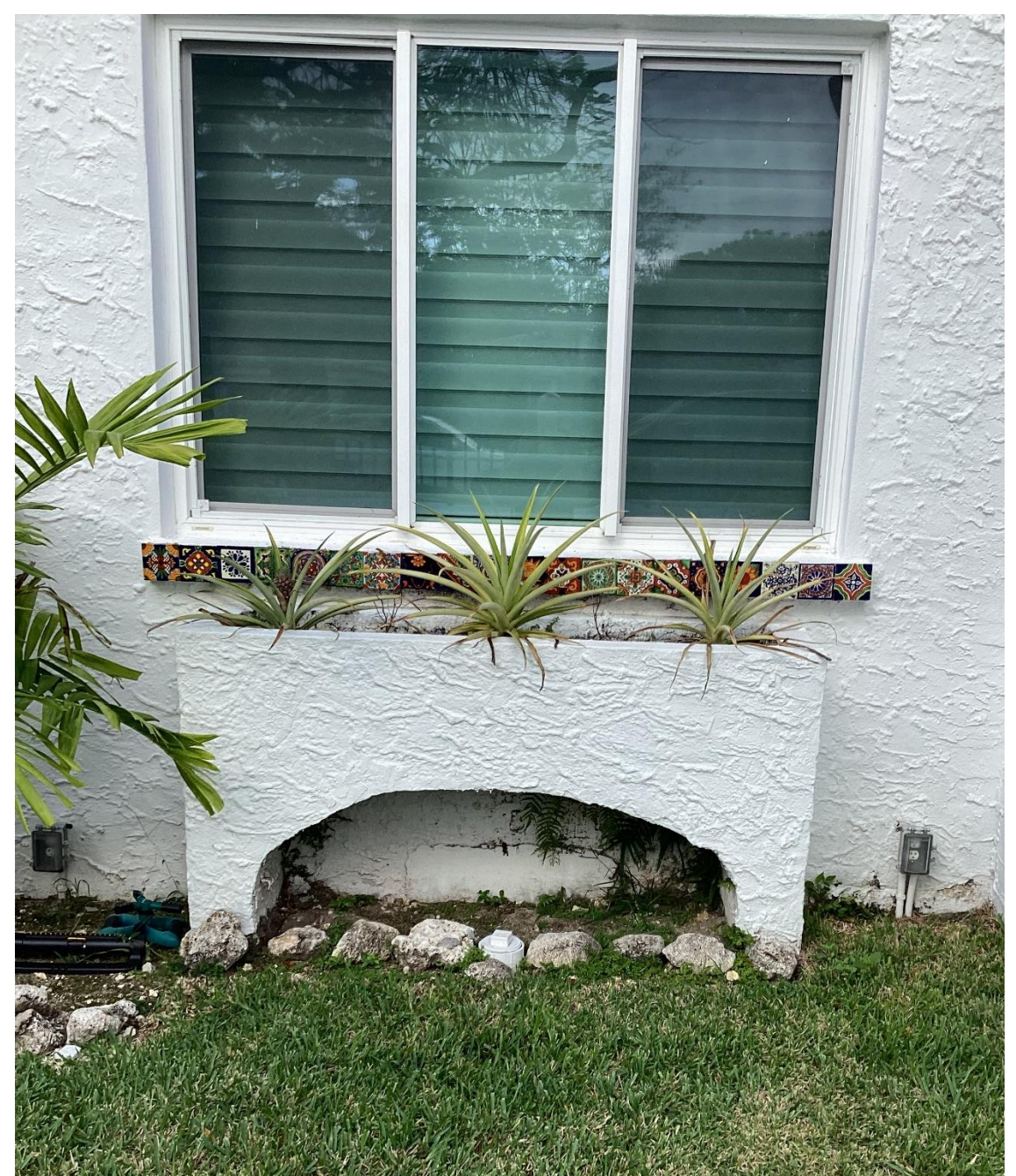
Original Flower Box - Before and After