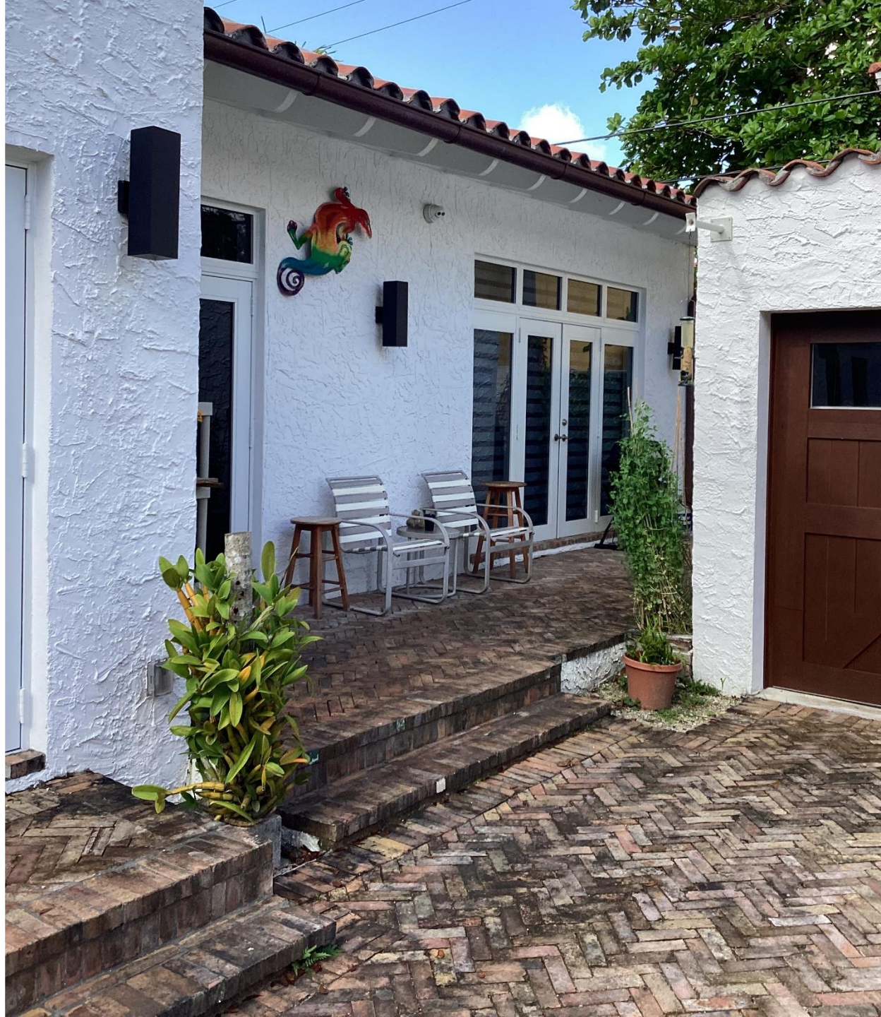
North Façade of New Addition – After