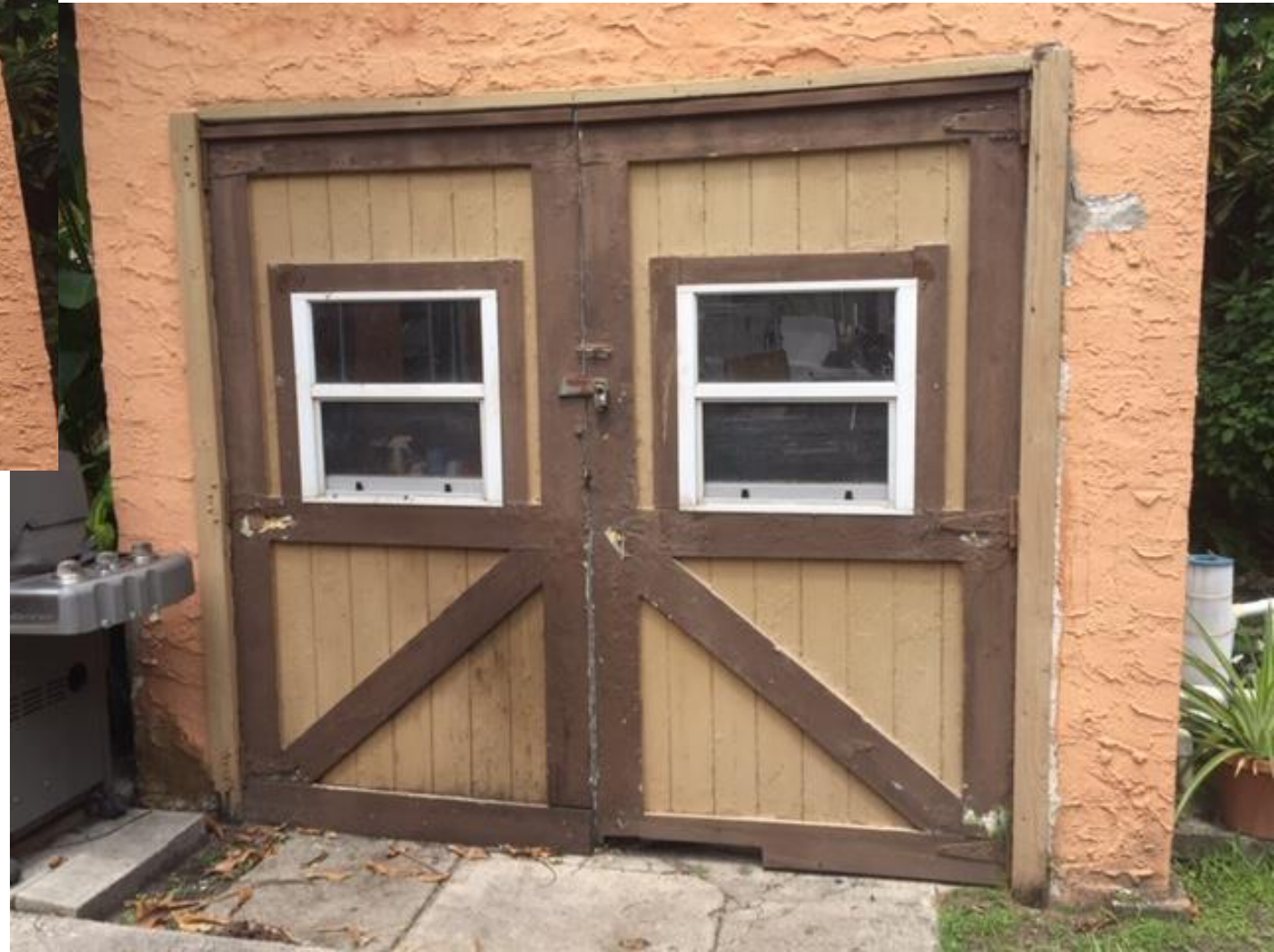
Detached Garage (East Façade) – Before