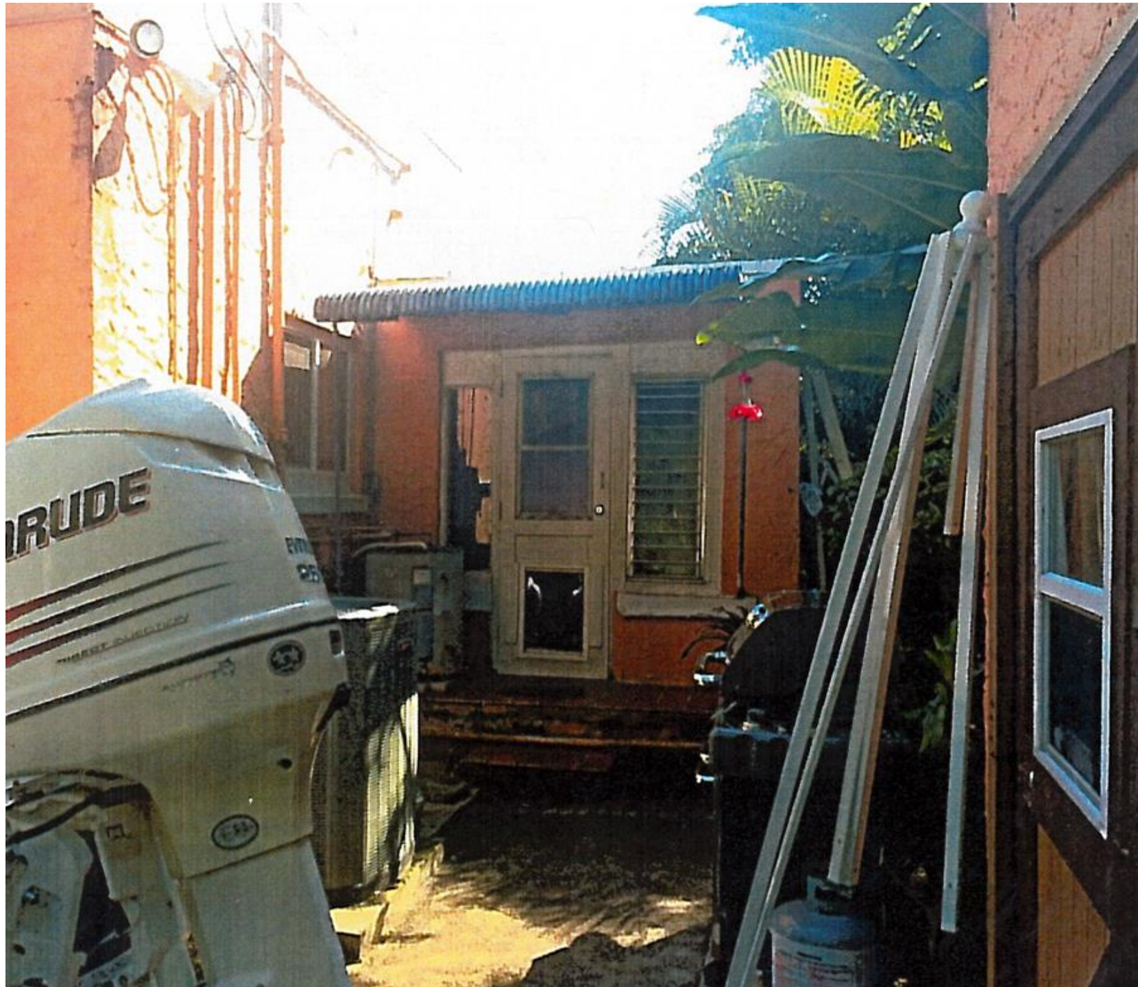
North Façade of 1959 Screened Porch Addition – Before (to be removed)