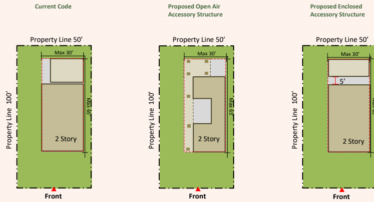
Small Lot with One Side Street