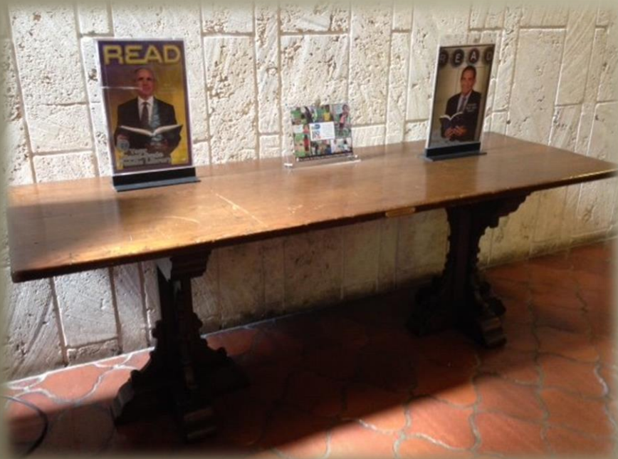
Merrick Rectangular Table