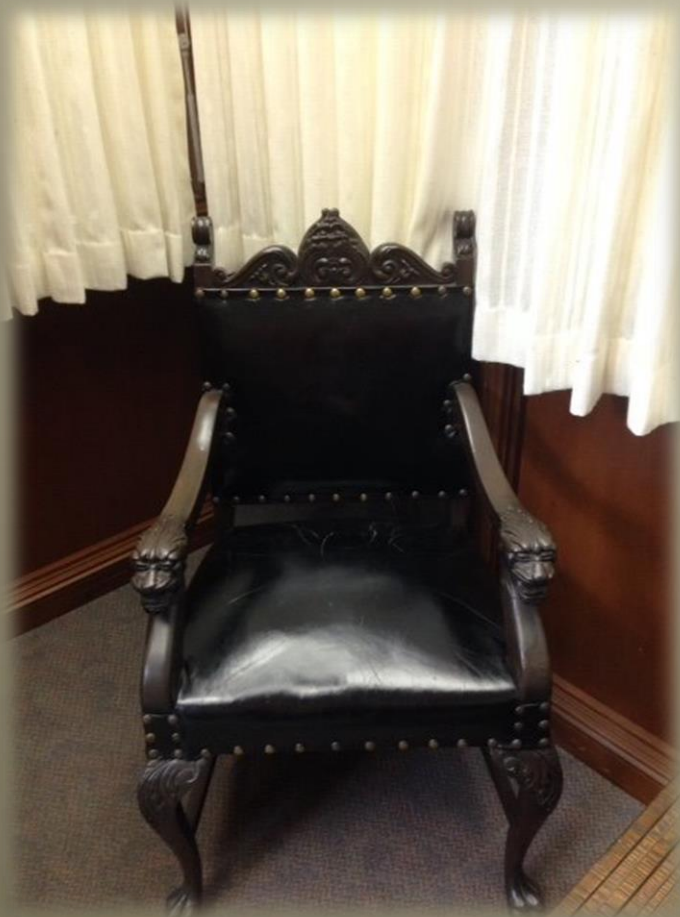
Merrick Arm Chair