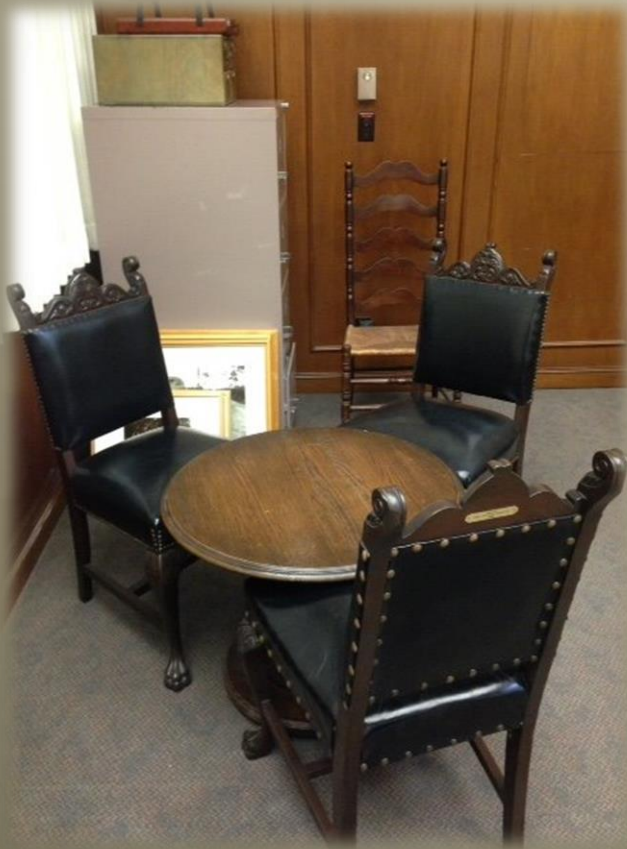
Three Side Chairs