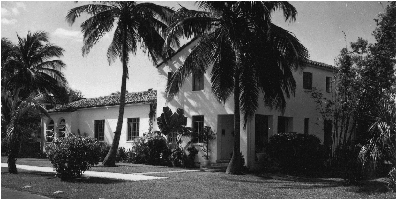
Figures 1: 1940s Photo