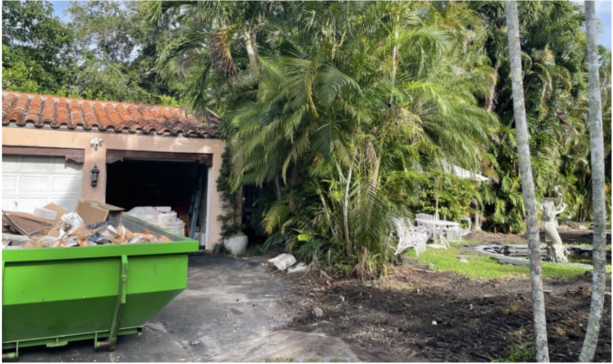
Figures 3: Detached Garage, 2026

At the southwest corner of the property is the existing detached garage and guestroom. (Figures 3). The structure will be substantially demolished for the expansion of the garage and two-story addition. Original plans for the property have not been located, it is unclear if the structure is original or a later addition. The only portion visible from the street is the two-car garage that will be replicated as part of the garage expansion. Per Section 8-107(D) of the Coral Gables Zoning Code, the Board shall consider the following criteria in evaluating applications for a Special Certificate of Appropriateness for demolition of designated properties: