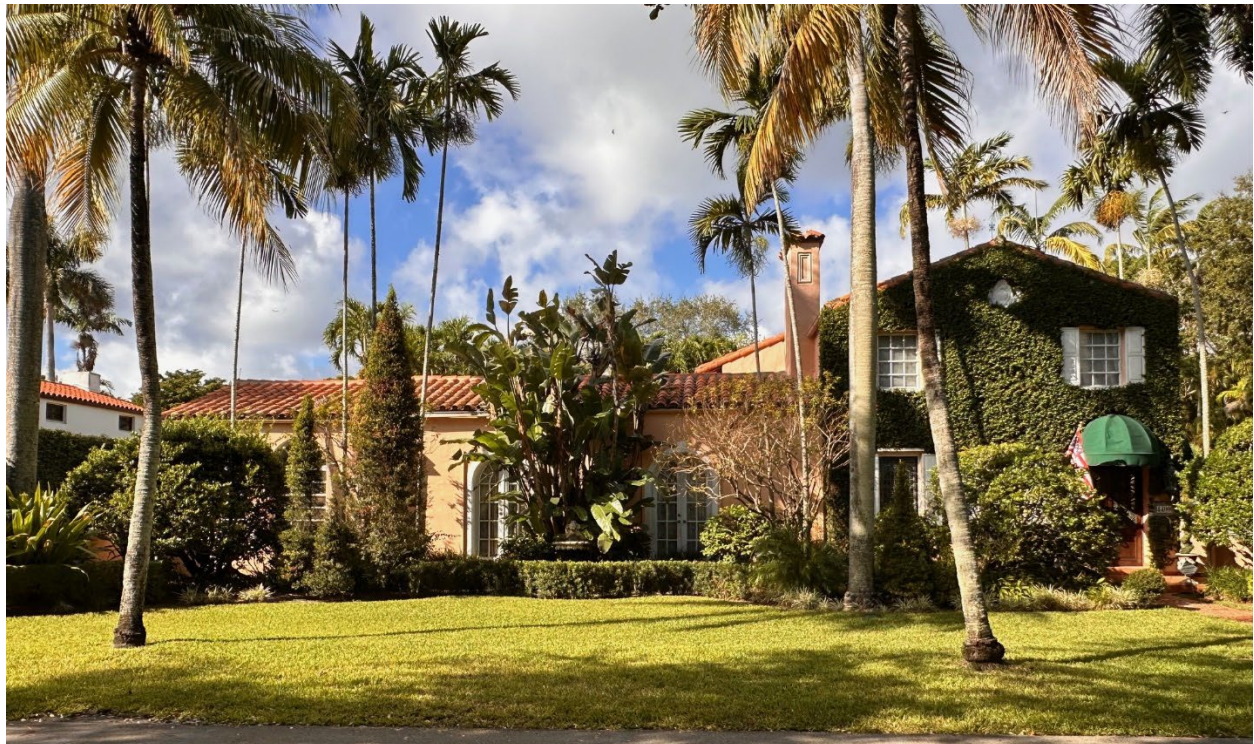
Figure 2: 2026