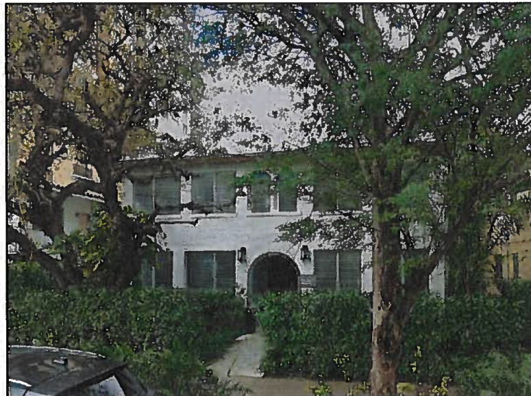
View towards project site from 131 Zamora Ave.