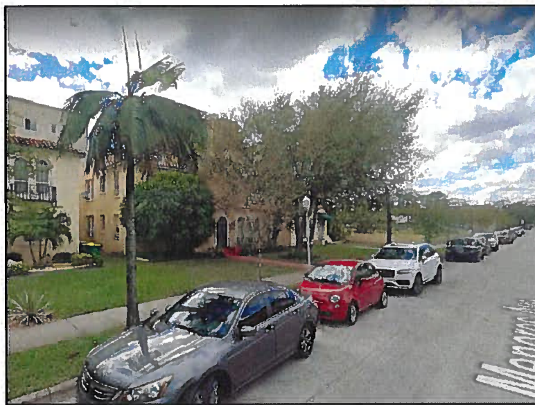
View towards project site from 114, 118, and 122 Menores Ave.

By right and without TDRs, the subject property can be developed to 16 stories and 190'-6" in height (as proposed) although the structure would be slimmer. Additionally, the proposed park to the rear of 122 Menores Avenue could be developed. The inclusion of the paseo on the east elevation of the proposed structure and the park to the rear of 122 Menores Avenue provide small buffers between the subject and the historic Menores Avenue sites. Increasing the east elevation stepbacks of the tower would further help to lessen the impact on the historic structures; however, any 16-story structure at this location will have a negative impact. This impact could be further increased by the development of the land currently proposed as a garden/park.