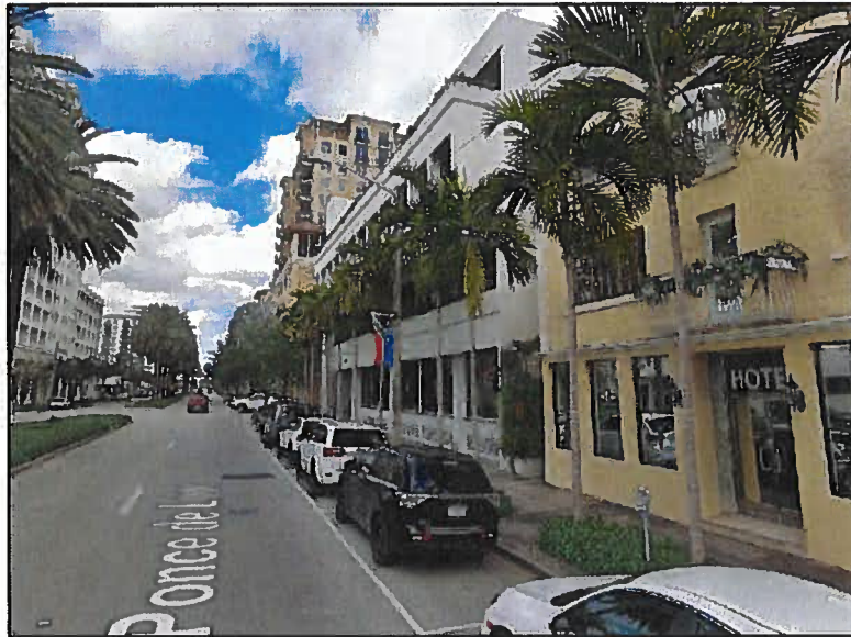
View towards project site from 1721 Ponce de Leon Blvd.

The proposed development does not adversely affect the historic properties located at 1721 Ponce de Leon Boulevard, 131 Zamora Avenue, and 111 Salamanca Avenue.