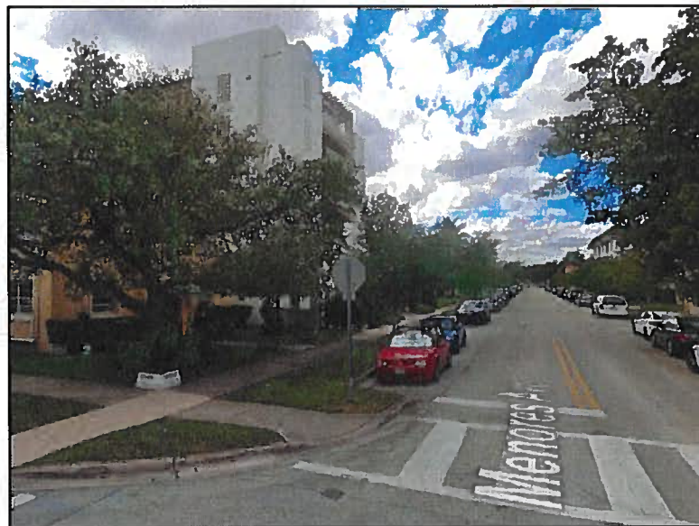
View towards project site from 102 Menores Ave.

The proposed new development will have a moderate impact on the setting of 112 Menores Avenue.