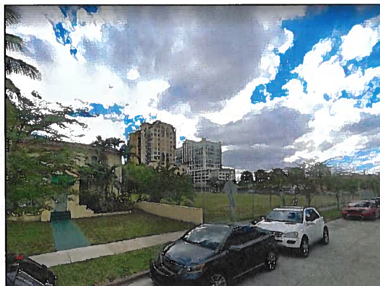
View towards project site from 122 Menores Ave.