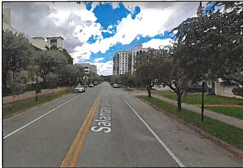
View towards project site from 111 Salamanca Ave.

The proposed new development will have a moderate impact on the setting of 112 Menores Avenue.