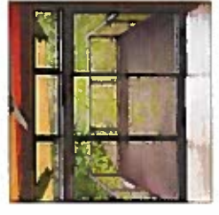
ALUMINUM STUD/SUPPORT SYSTEM