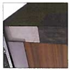
ANCHORED STEEL PLATE