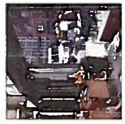
SLIDING PANEL DOORS