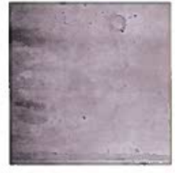
ROUGH STUCCO FINISH