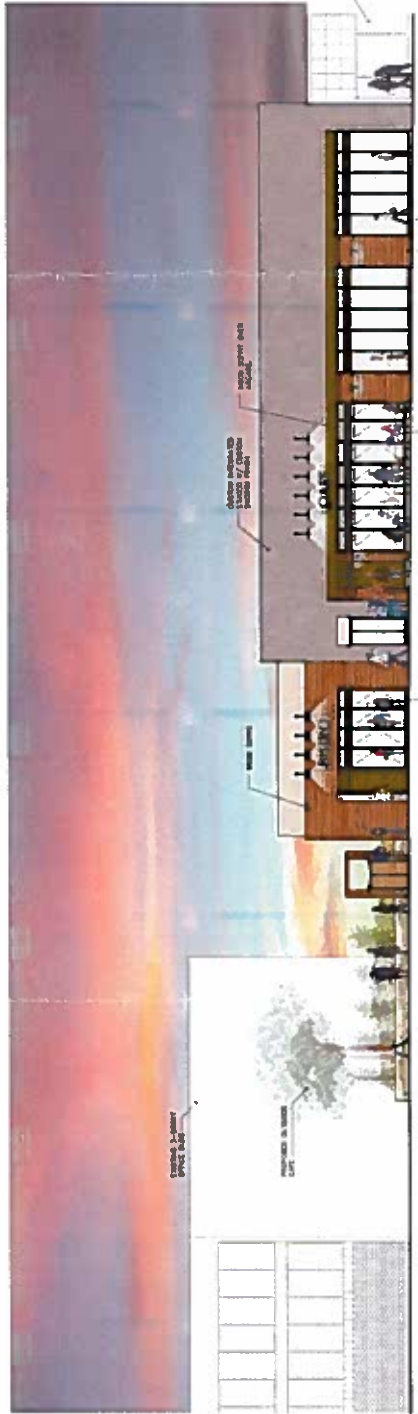
A PROPOSED SOUTH ELEVATION. ELEVATION SHOWN PLAT FOR REFERENCE