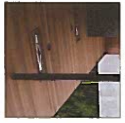
WOOD SOFFIT OVER ARCADE