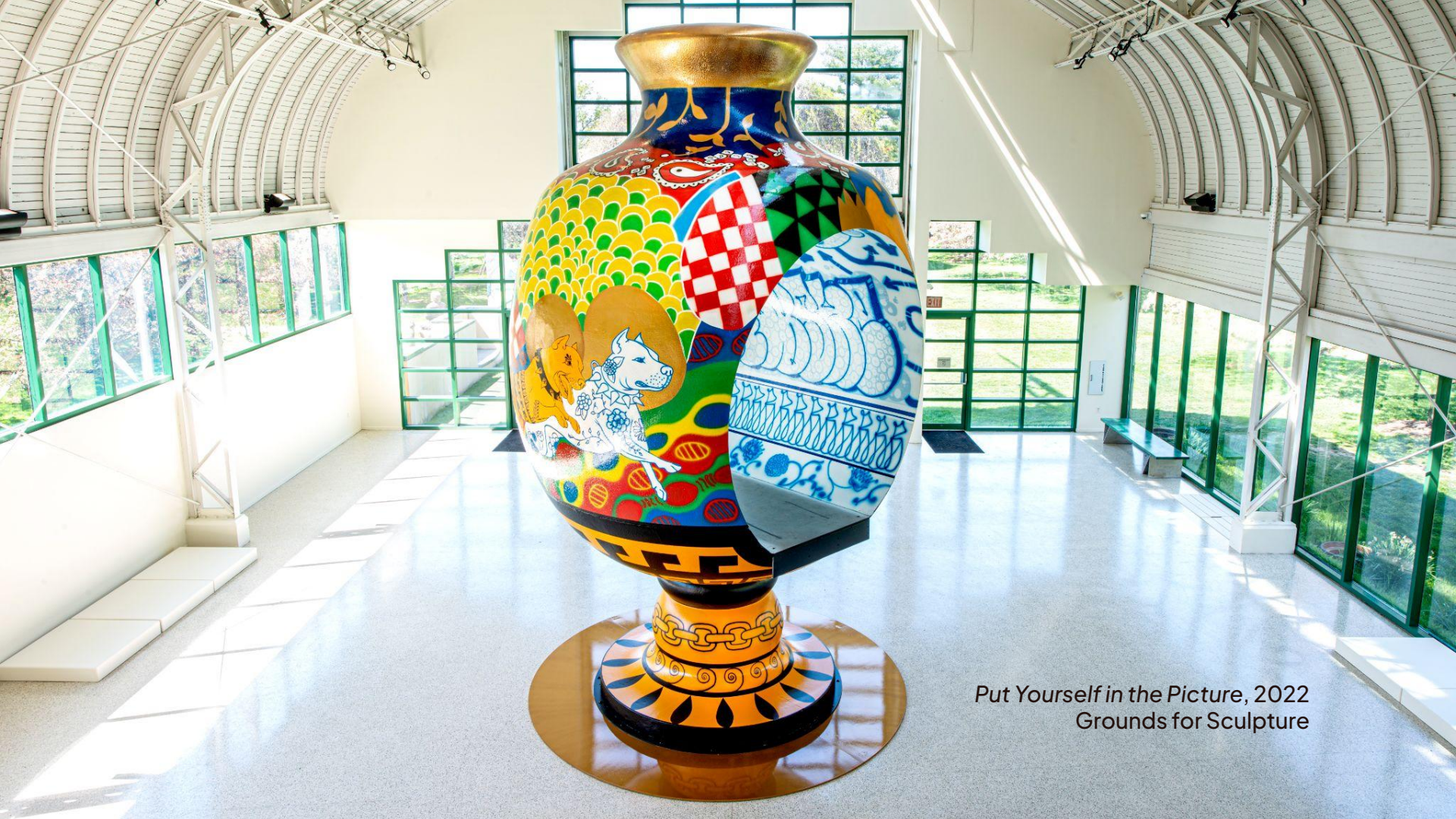
Put Yourself in the Picture , 2022 Grounds for Sculpture