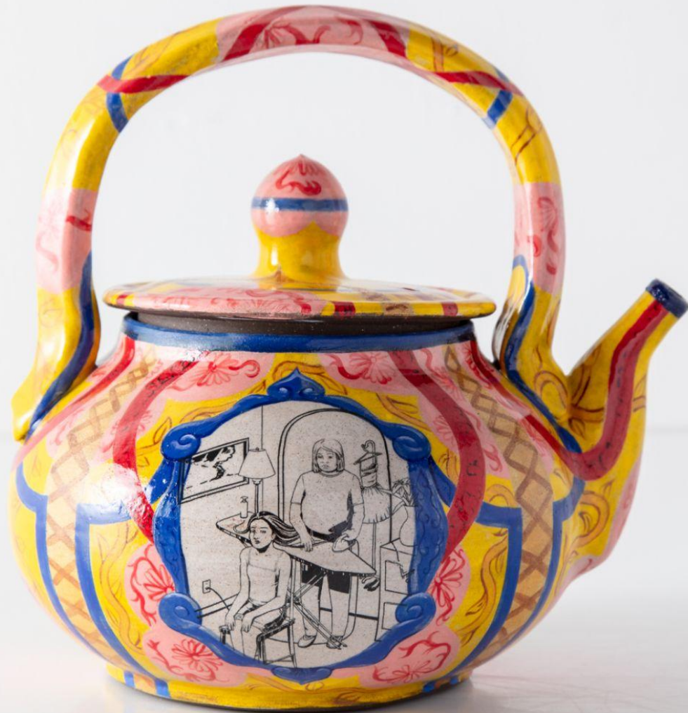
Ironing Board Hair Salon, 2023