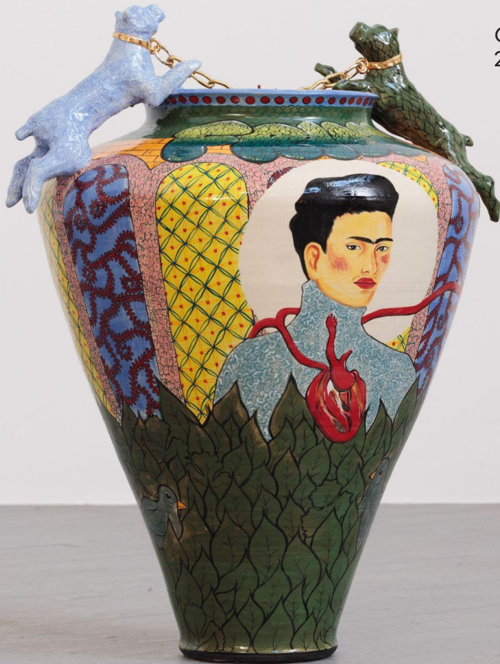
Ode to Frida, 2024