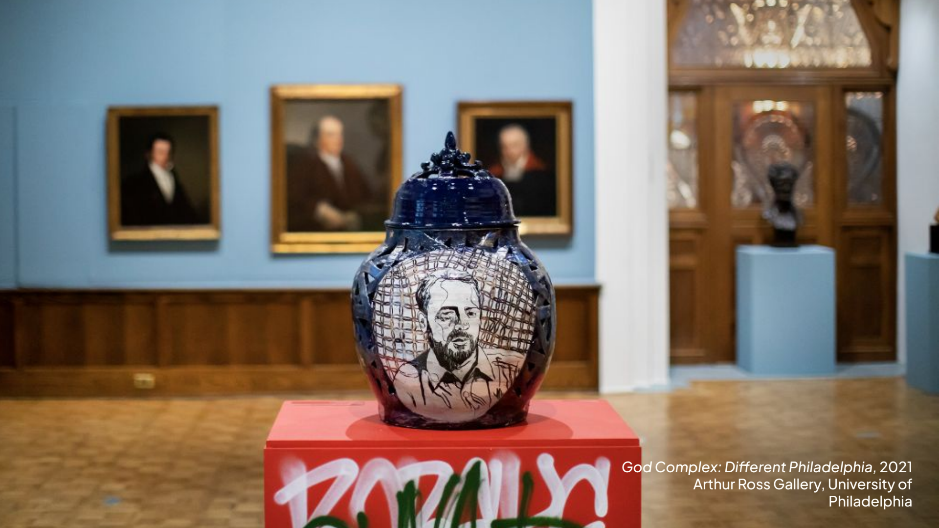
God Complex: Different Philadelphia, 2021 Arthur Ross Gallery, University of Philadelphia