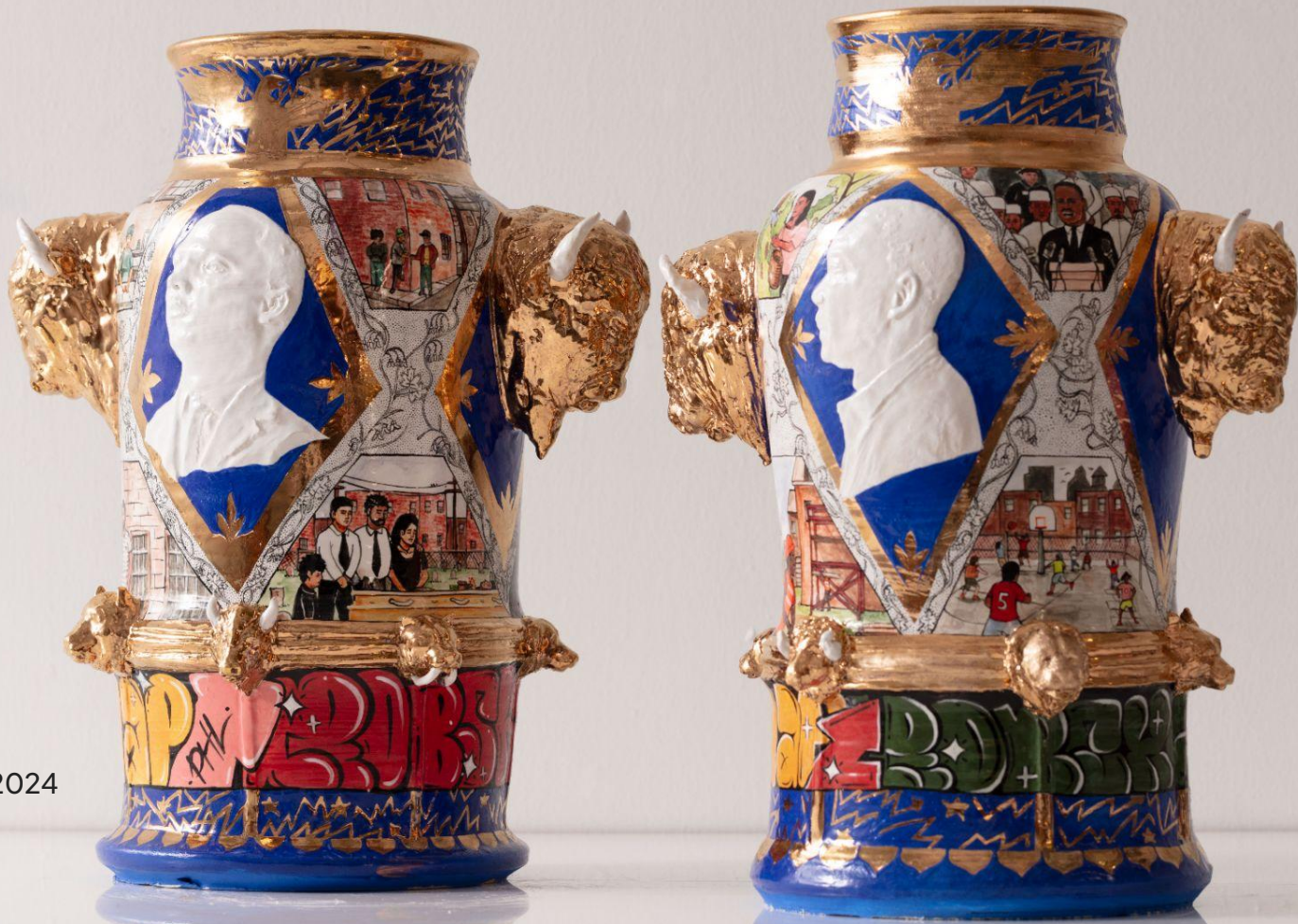
Century Vases, 2024