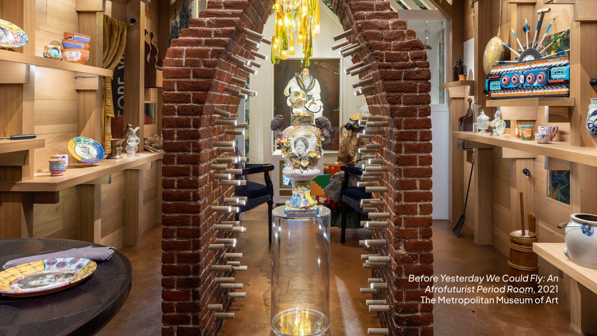
Before Yesterday We Could Fly: An Afrofuturist Period Room, 2021 The Metropolitan Museum of Art