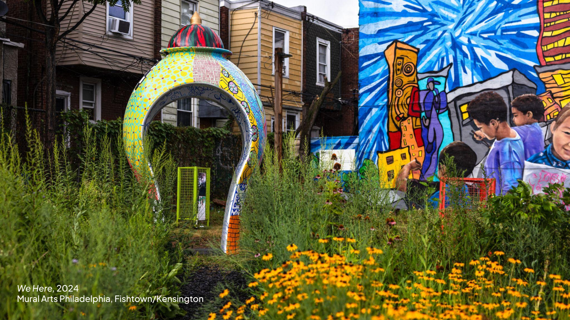
We Here, 2024 Mural Arts Philadelphia, Fishtown/Kensington