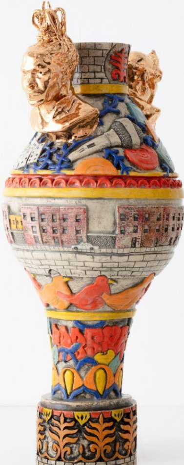
Double-Bust Vessels, 2023