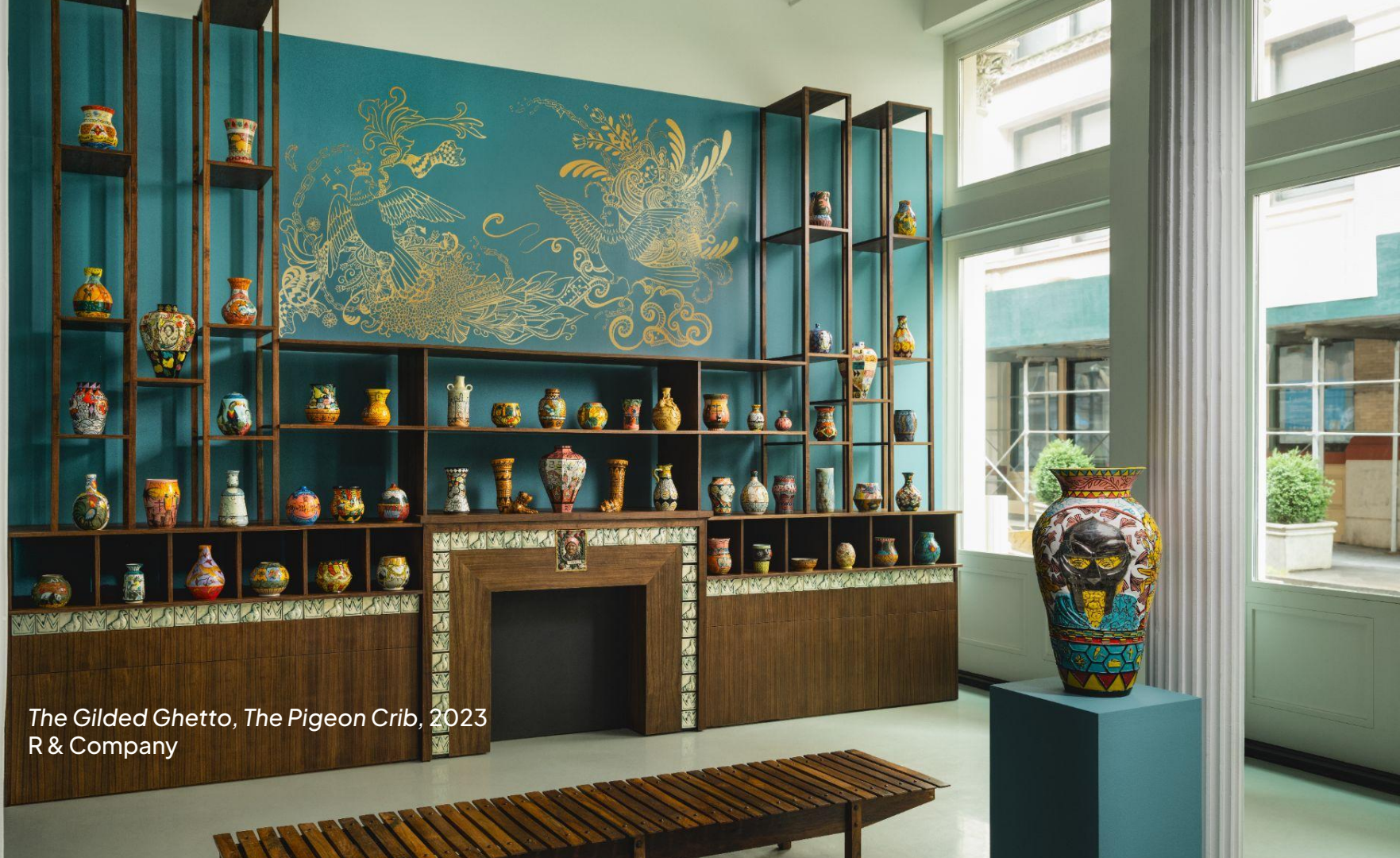
The Gilded Ghetto, The Pigeon Crib, 2023 R & Company