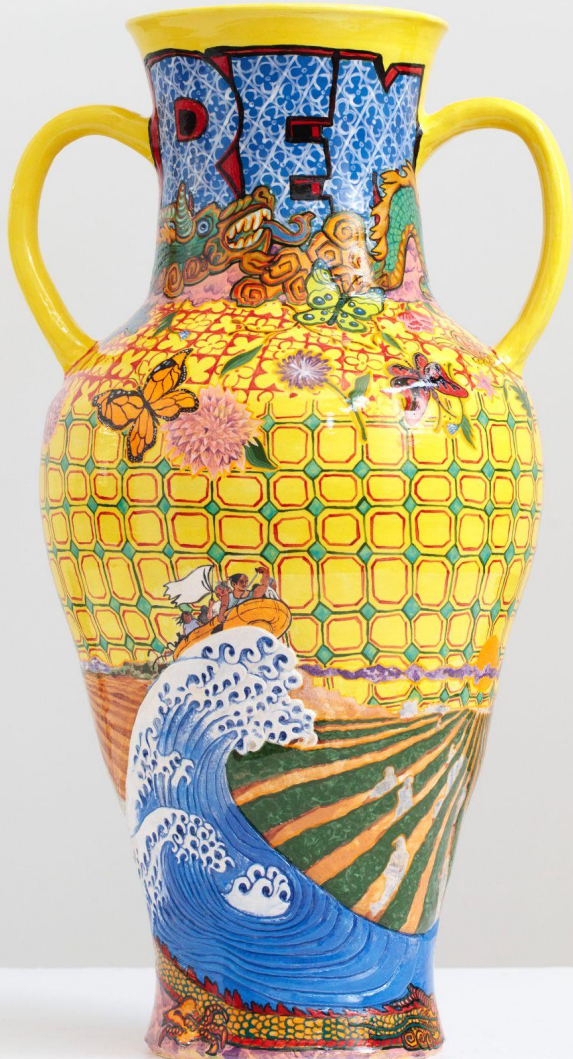
Over the Wave Off of Havana, 2024