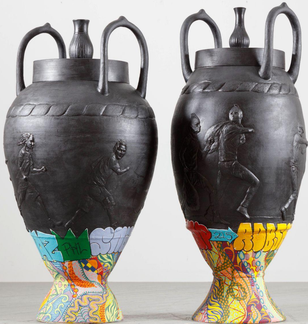
The Chase (Tag) and The Chase (Cops & Robbers), 2024