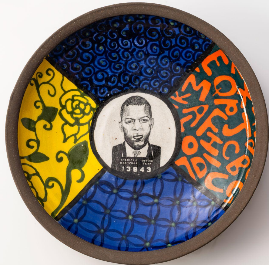
Marcus Garvey and Nina Simone, Chargers , 2022