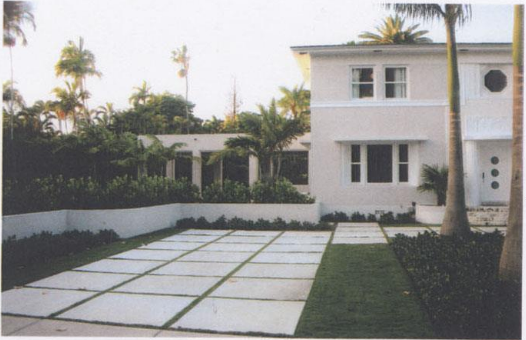
Landscape 1101 N Greenway Dr. Photo #7