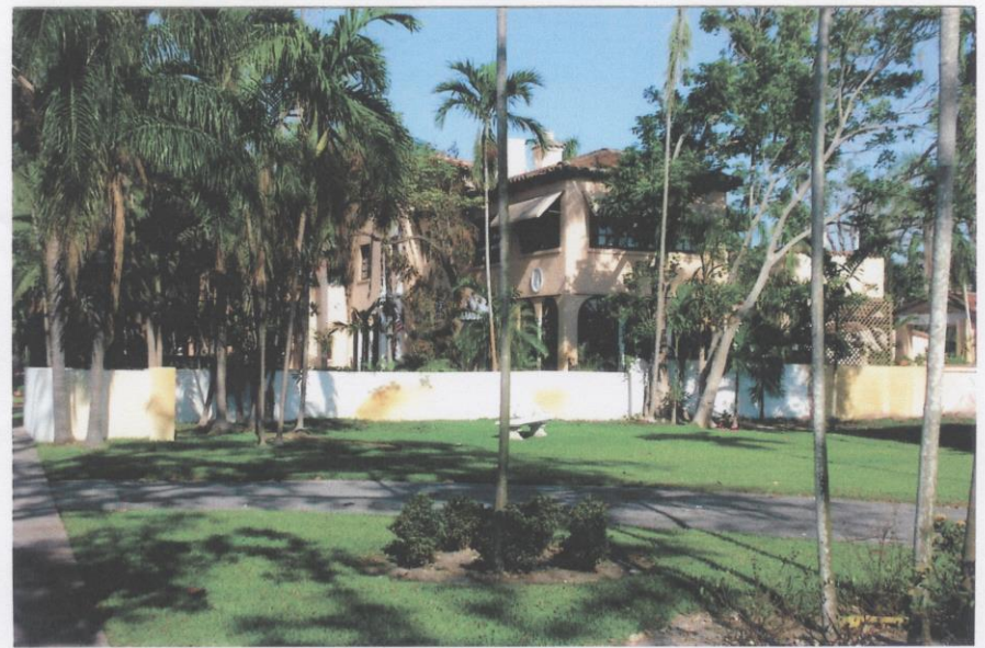
Landscape 1101 N Greenway Dr. Photo #7