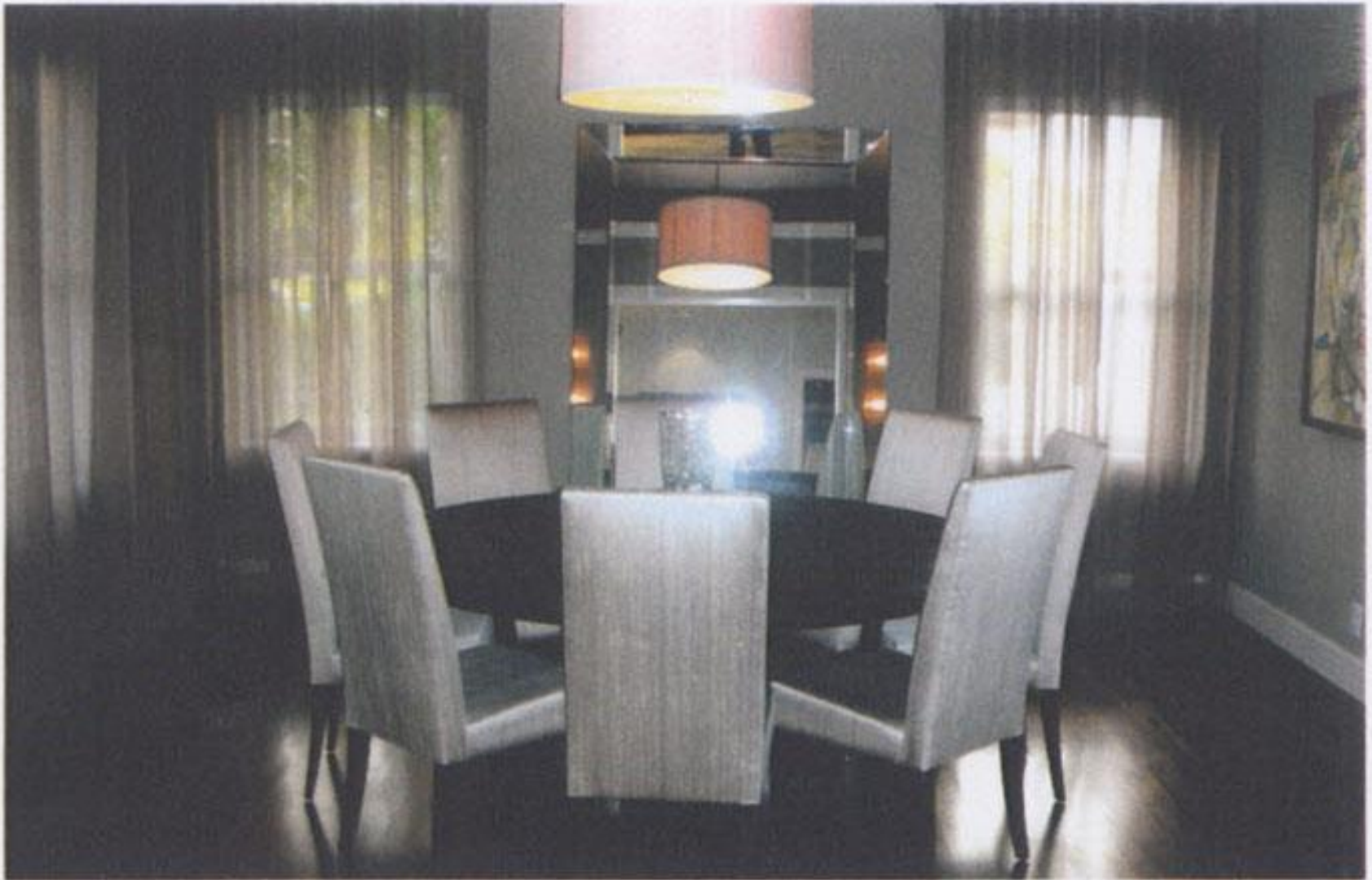
Dining Room 1101 N Greenway Dr. Photo #5