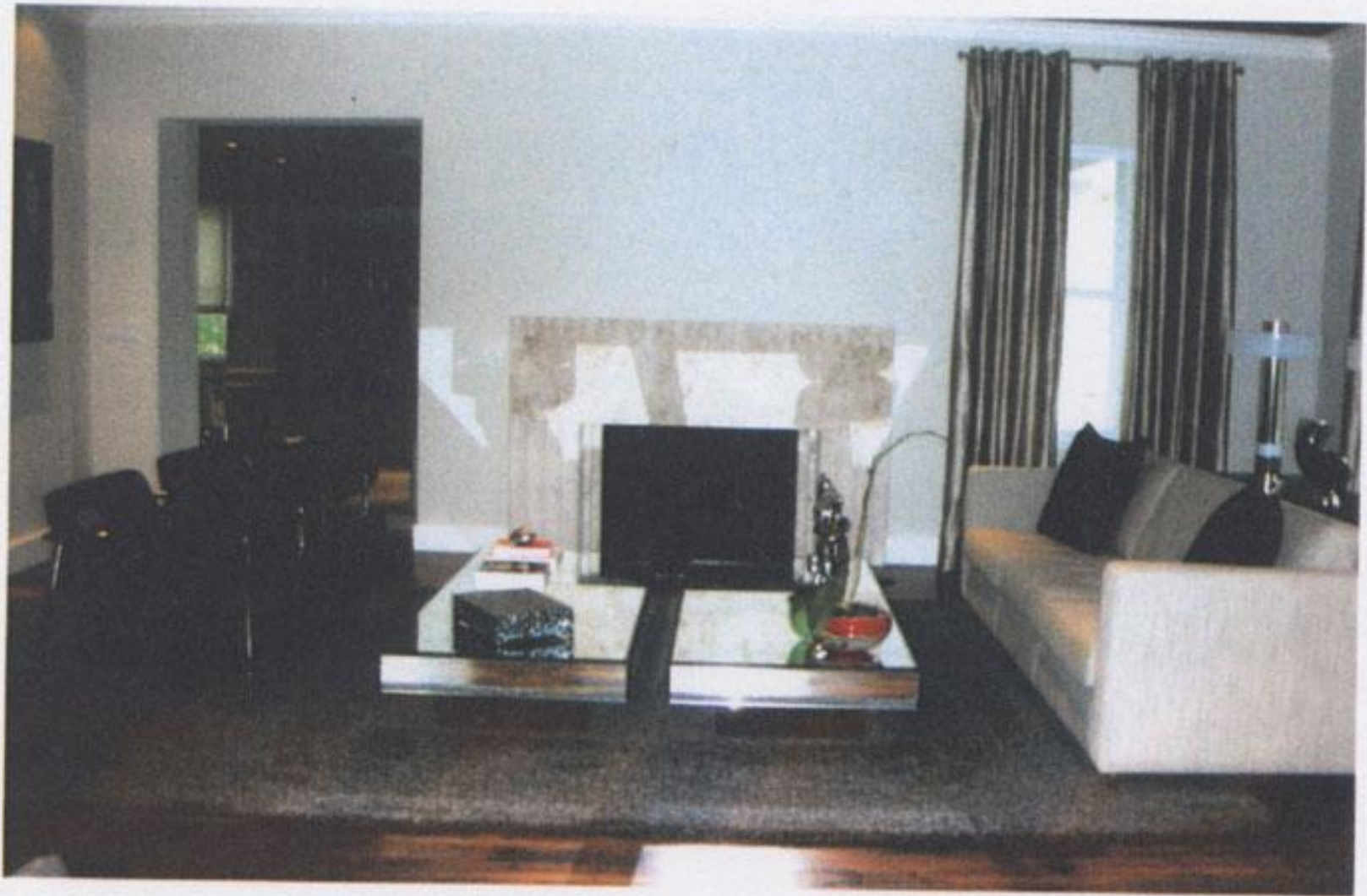
Living Room 1101 N Greenway Dr. Photo #4