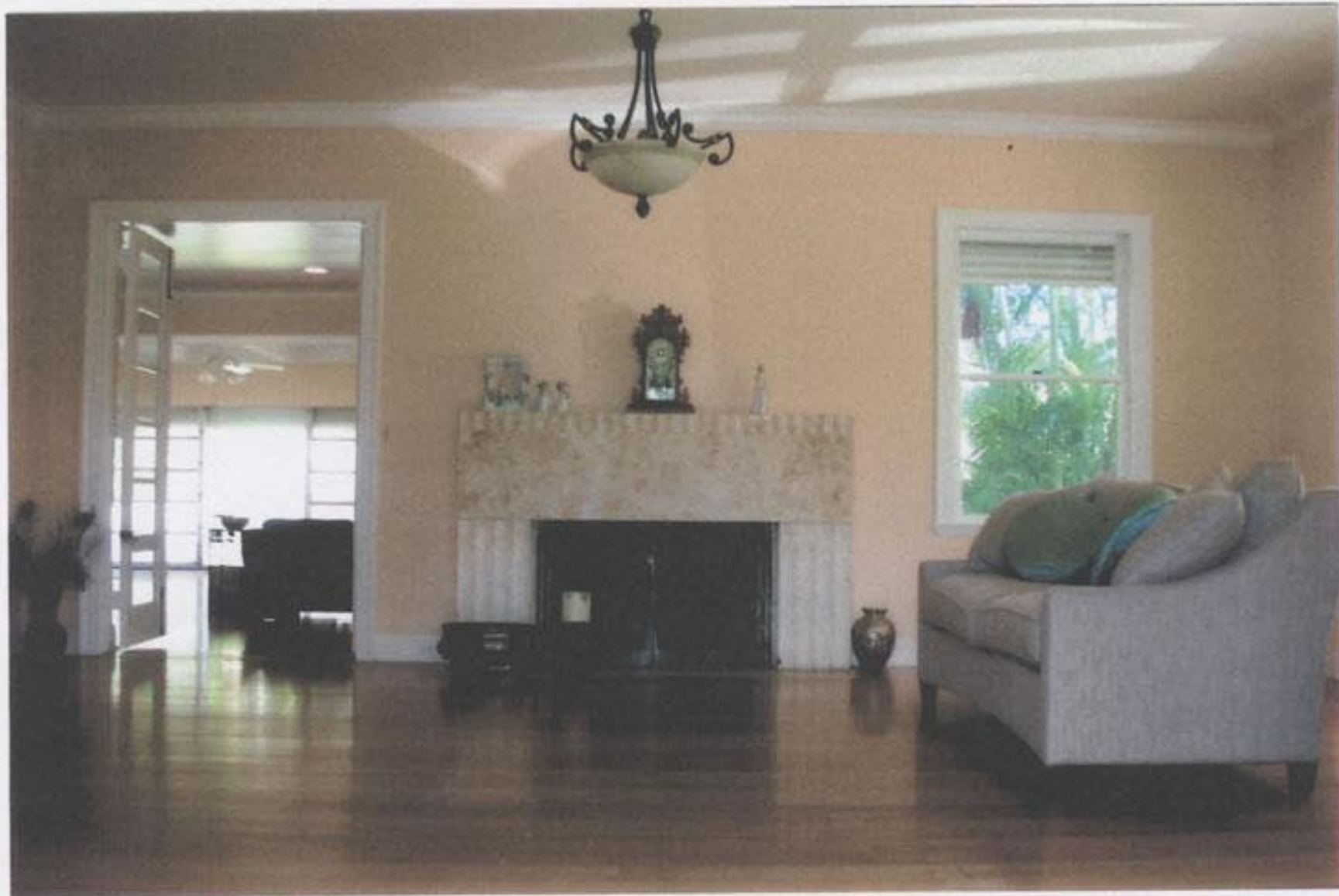
Living Room 1101 N Greenway Dr. Photo #4