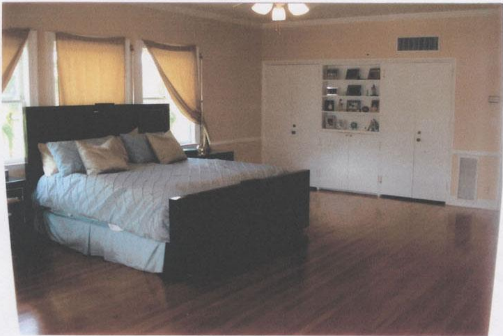
Bedroom #1 1101 N Greenway Dr. Photo #6