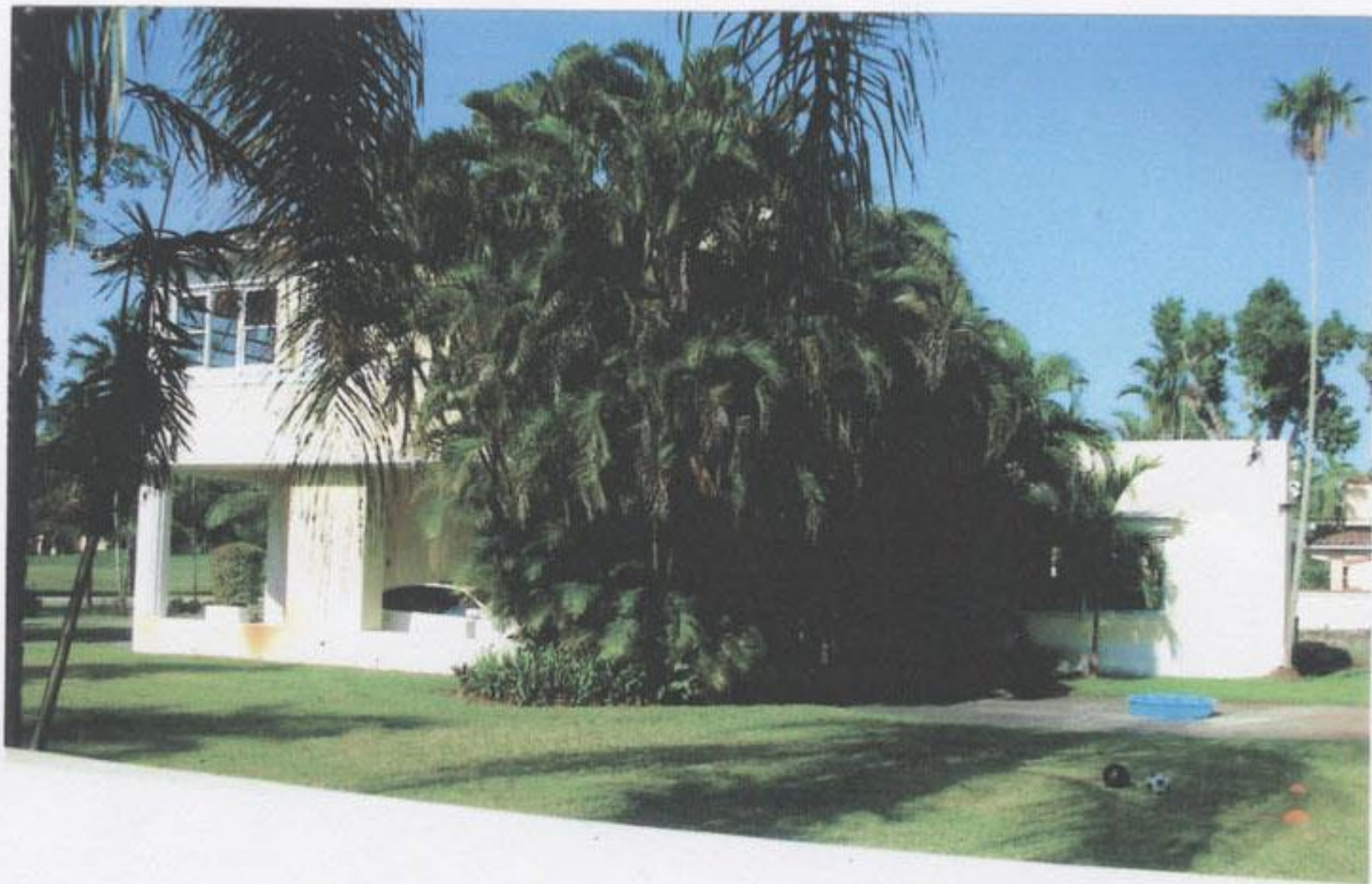
Right (East) Elevation 1101 N Greenway Dr. Photo #3