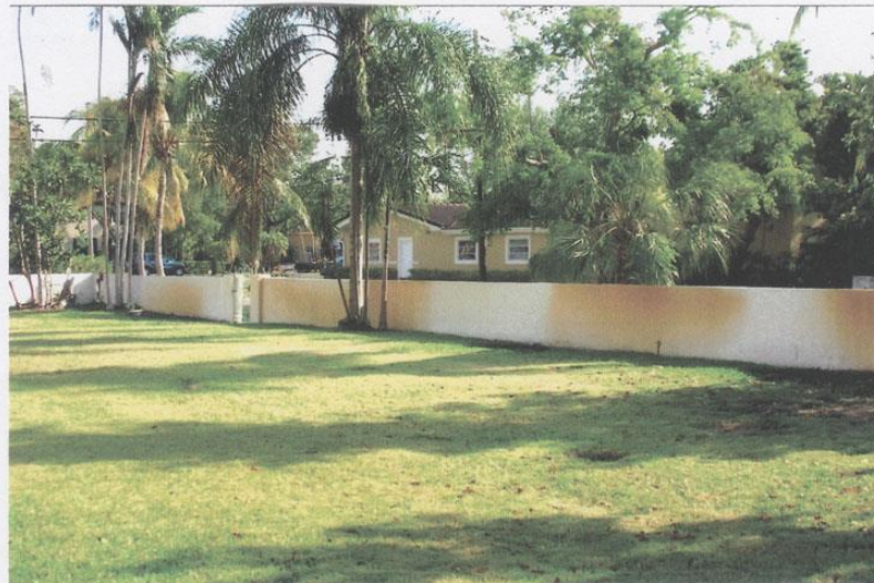
Landscape 1101 N Greenway Dr. Photo #9