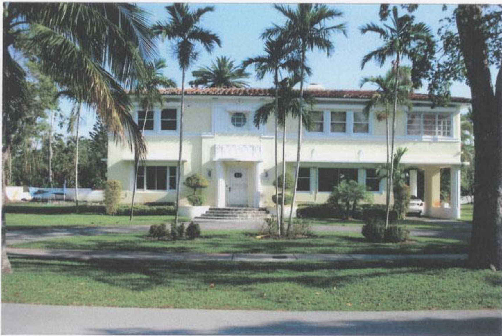
Front Elevation 1101 N Greenway Dr. Photo #1