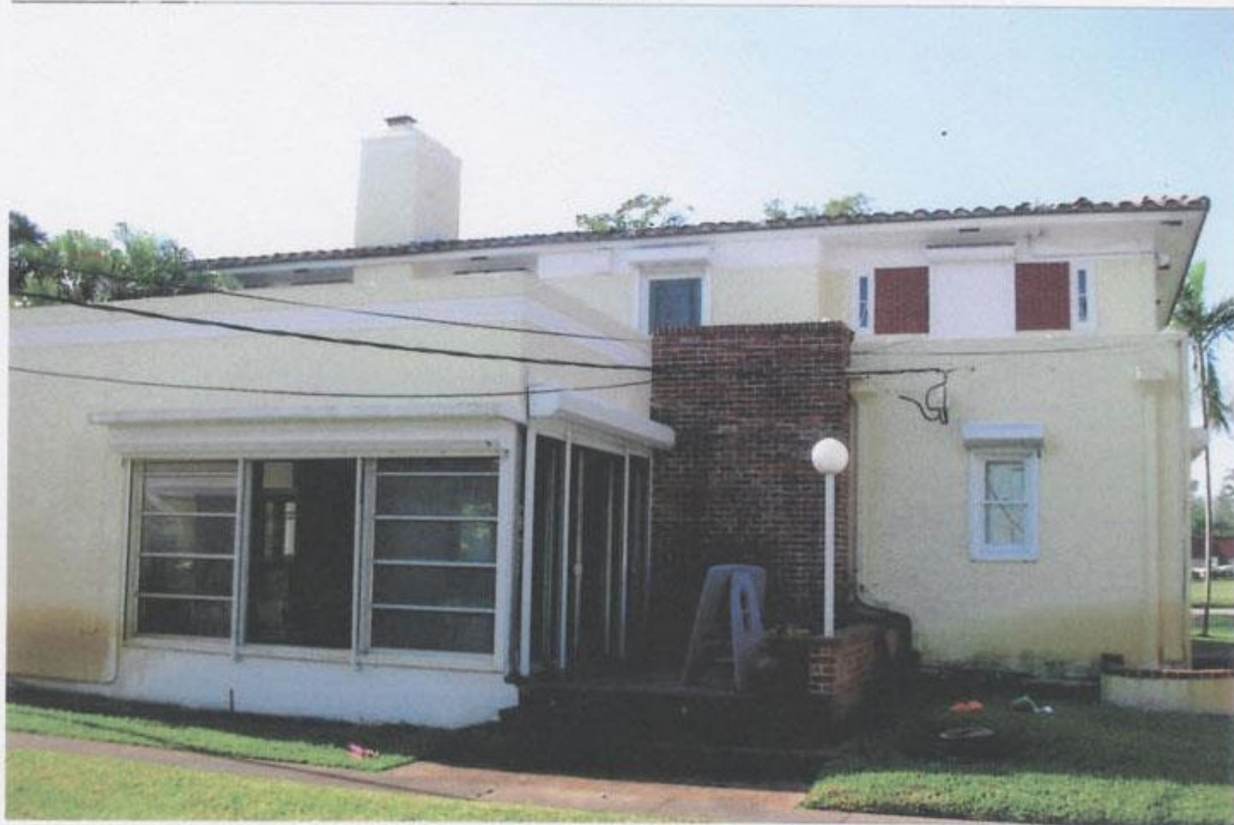
Rear Elevation 1101 N Greenway Dr. Photo #2