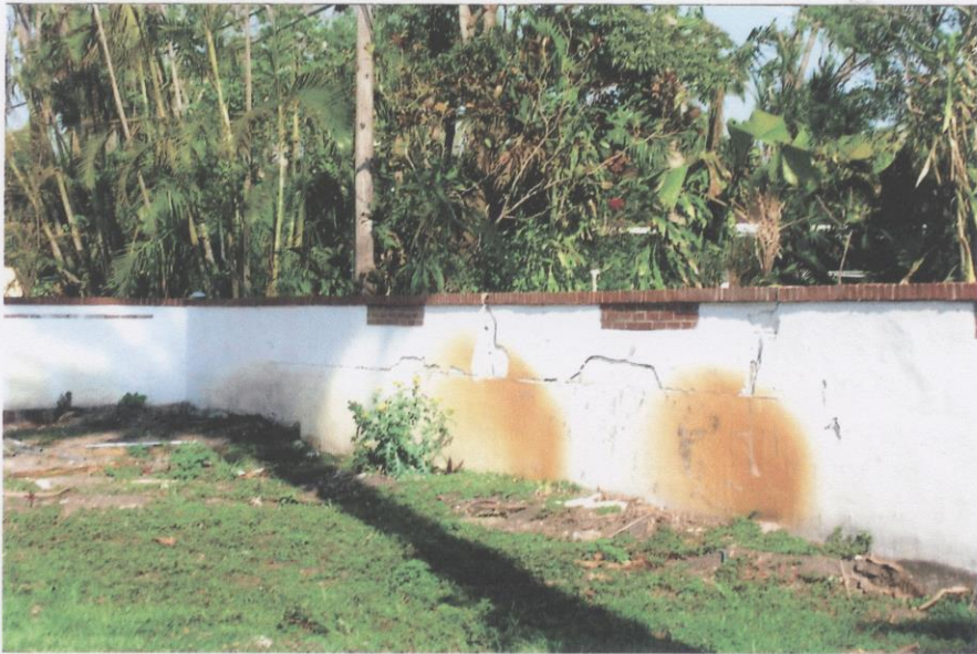
Landscape 1101 N Greenway Dr. Photo #8