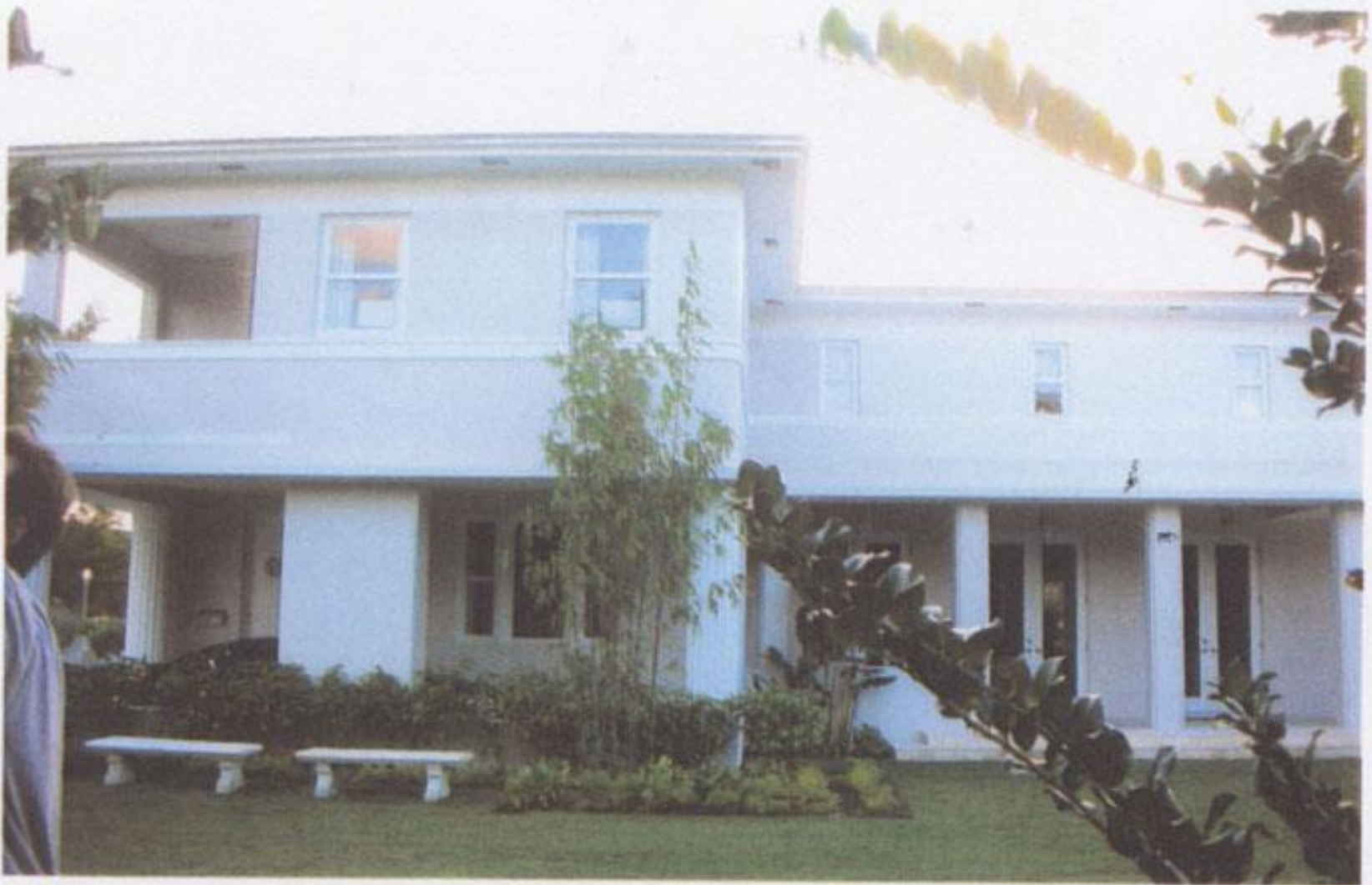
Right (East) Elevation 1101 N Greenway Dr. Photo #3