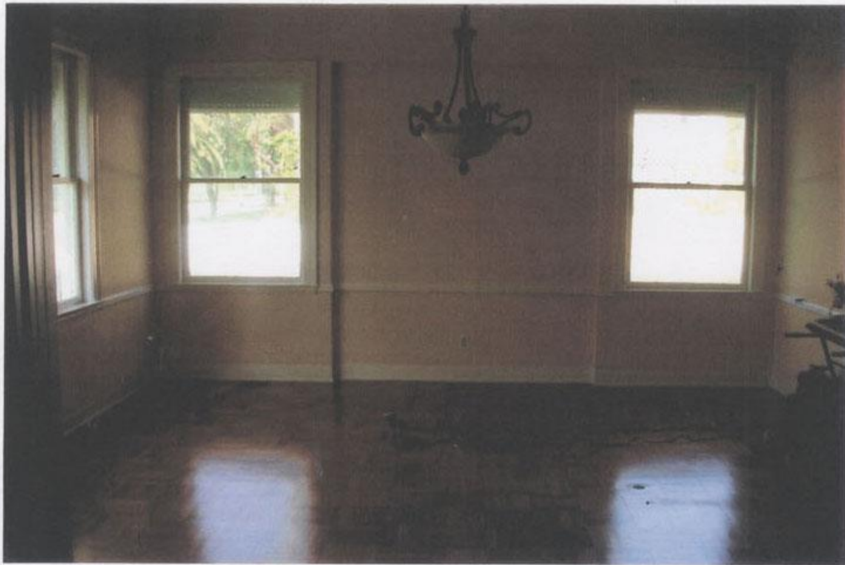
Dining Room 1101 N Greenway Dr. Photo #5