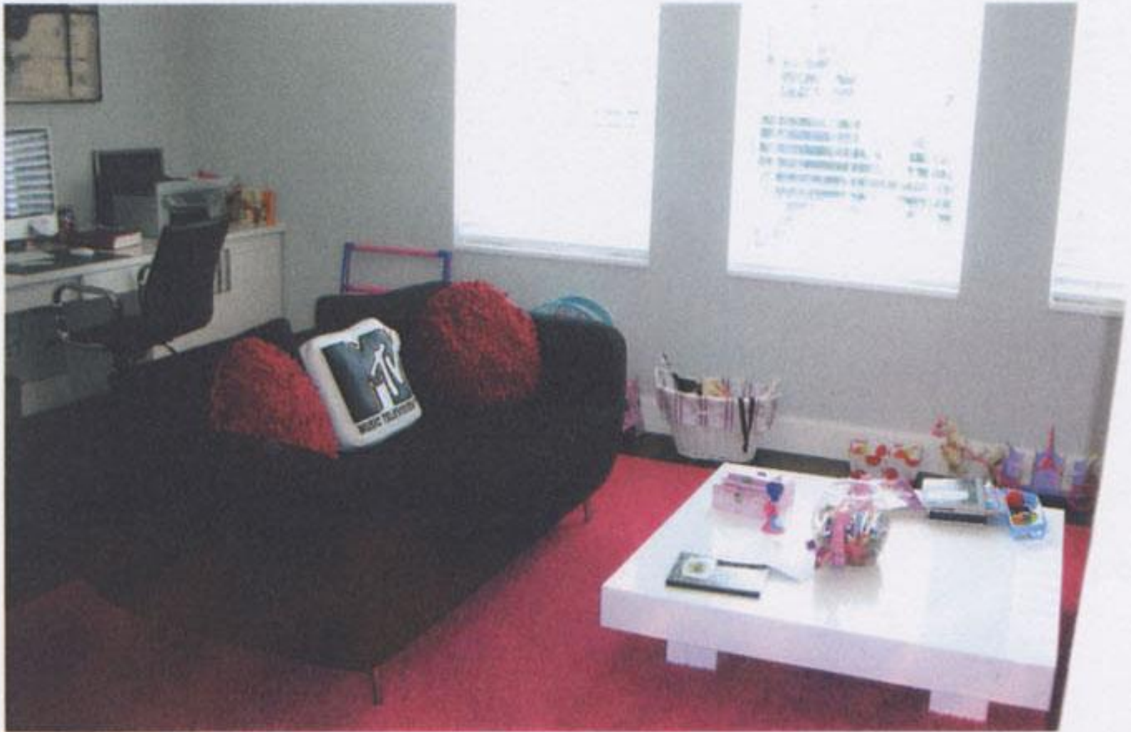
Bedroom #1 1101 N Greenway Dr. Photo #6