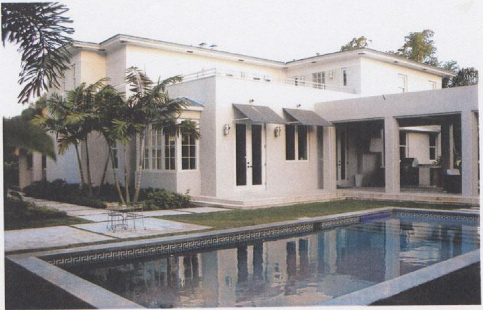
Rear Elevation 1101 N Greenway Dr. Photo #2