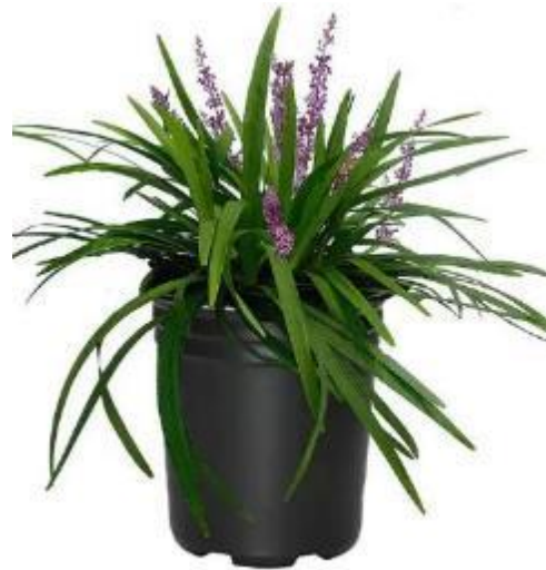
Liriope Croton Petra