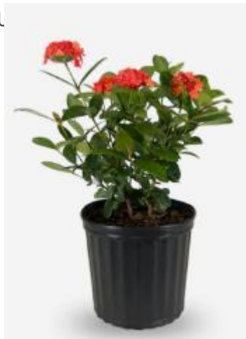
Dwarf Ixora Croton Magnificent