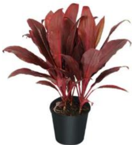
Auntie Lou Ti Plant