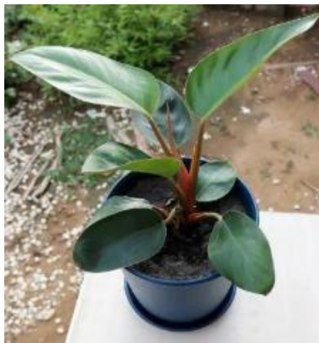
Philodendron Rojo Congo