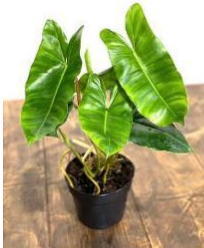
Burle Marx Philodendron Mantana