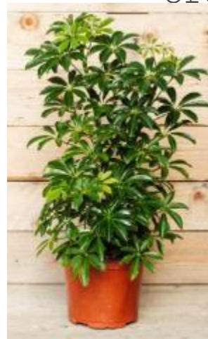
Green Arboricola Crinum Lilly