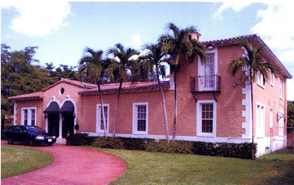
Photograph Year 2004

Residence Address: 2103 Country Club Prado Date of Construction: c. 1925 Construction Material: concrete block covered with stucco