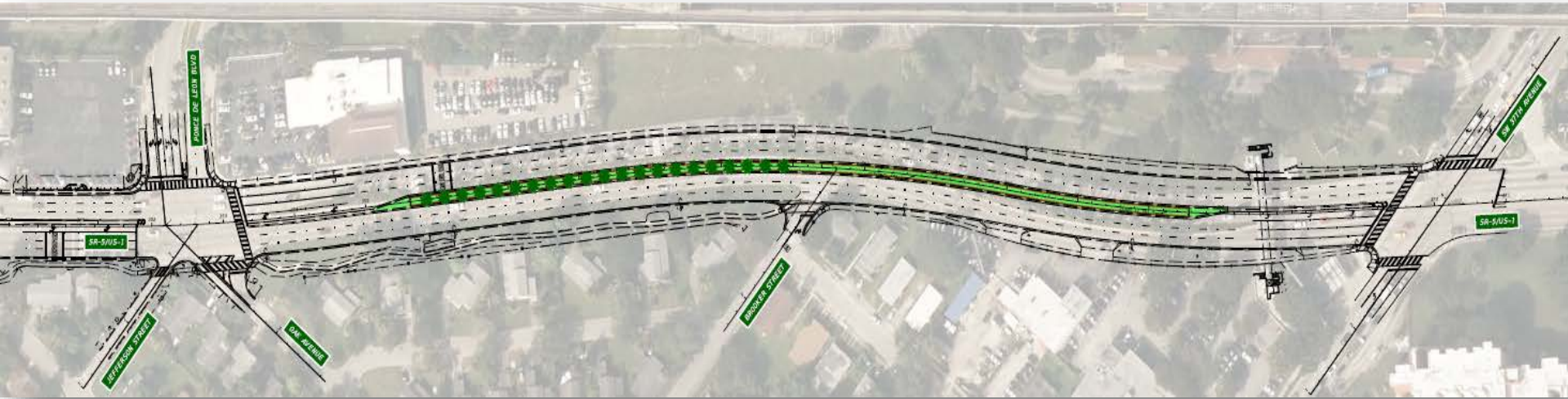
US-1 from Ponce de Leon to Douglas Rd