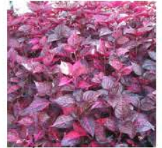
Red Velvet Aerva Sanguinolenta