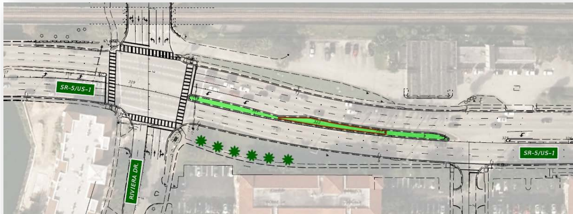
US-1 at Riviera Drive