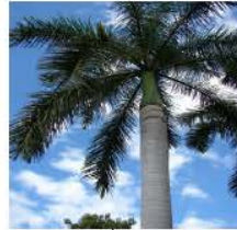
Royal Palm Roystonea regia