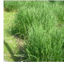
Fakahatchee Grass Floridanum