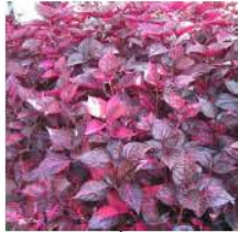
Red Velvet Aerva Sanguinolenta