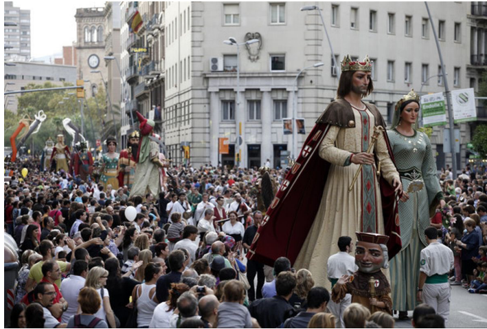
Cabezones in street festivals in Spain and Belgium

My proposal focuses on the Fred B. Hartnett / Ponce Circle Park. The area surrounding the Hartnett / Ponce Circle Park is under a great deal of development that will add layers of function of use to the City of Coral Gables. My proposal titled “Pax Americana 2022” frames the park with two different sculptures at the North and South end while suggesting that a street festival take place at the beginning of each month in December 2022, January and February of 2023 in the center field of the park.