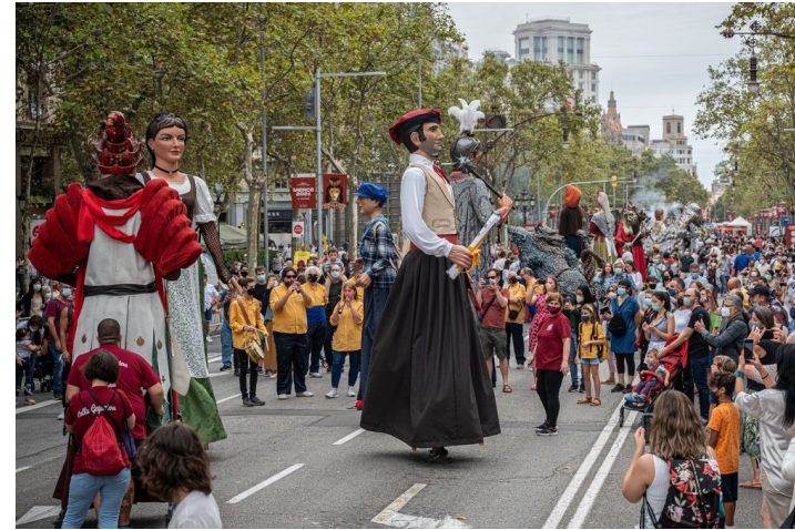
Cabezones in street festivals in Spain and Belgium

PAX AMERICANA 2022 calls to frame the Hartnett / Ponce Park with two large-scale sculptures that would be installed in November of 2022.