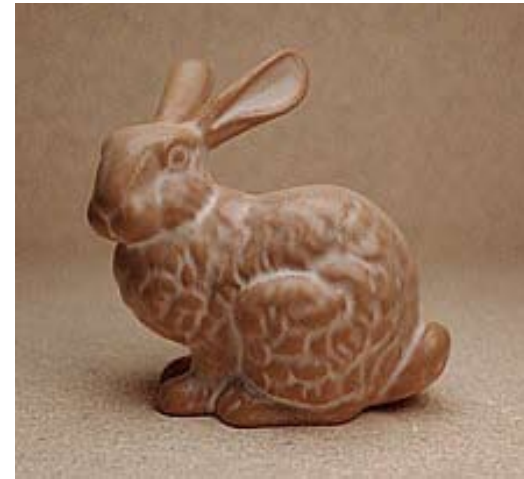
Terra-Cotta Stanford Bunny

In times such as we are living today in the post pandemic wake of Covid, the topic of economics, trade, globalization, supply chain, digital currency and social-media have all become common conversations. The juxtaposition of the sculptures proposed for Pax Americana 2022 speak specifically of the moment we are all living in while doing so in a visually accessible manner. The subtext of Pax Americana 2022 may have depth to it but the work embraces the public opportunity of commerce and discourse during the Art Basel / Miami Beach and into the following year.