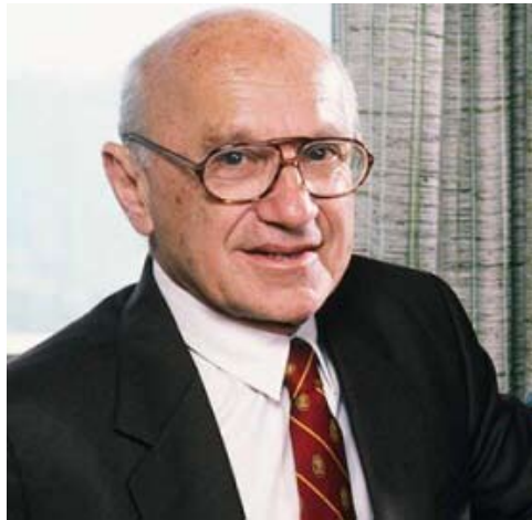
Milton Friedman 1912-2006

“Uncle Milton” is a sculpture of Milton Friedman who was one of the most influential economists of the 20th century. Having taught at the University of Chicago, Milton Friedman’s theories regarding trade, commerce and capitalism had profound influences in all the Americas from North, Central and South. In the eighties Milton Friedman was a frequent guest on television programs and also had a special on PBS regarding his concepts for embracing capitalism. The two above mentioned sculptures and street festival embrace and respond to the topic at hand, “Public Art”. Sculptures have become a topic of national interest and outcry as several have been removed recently from public plazas and parks in an attempt to address and reframe history. Public Space has become synonymous with having a critical eye while addressing our past. This proposal embraces its temporality by being conscious of its own limitations.