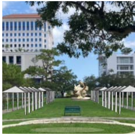
Tents for Festival