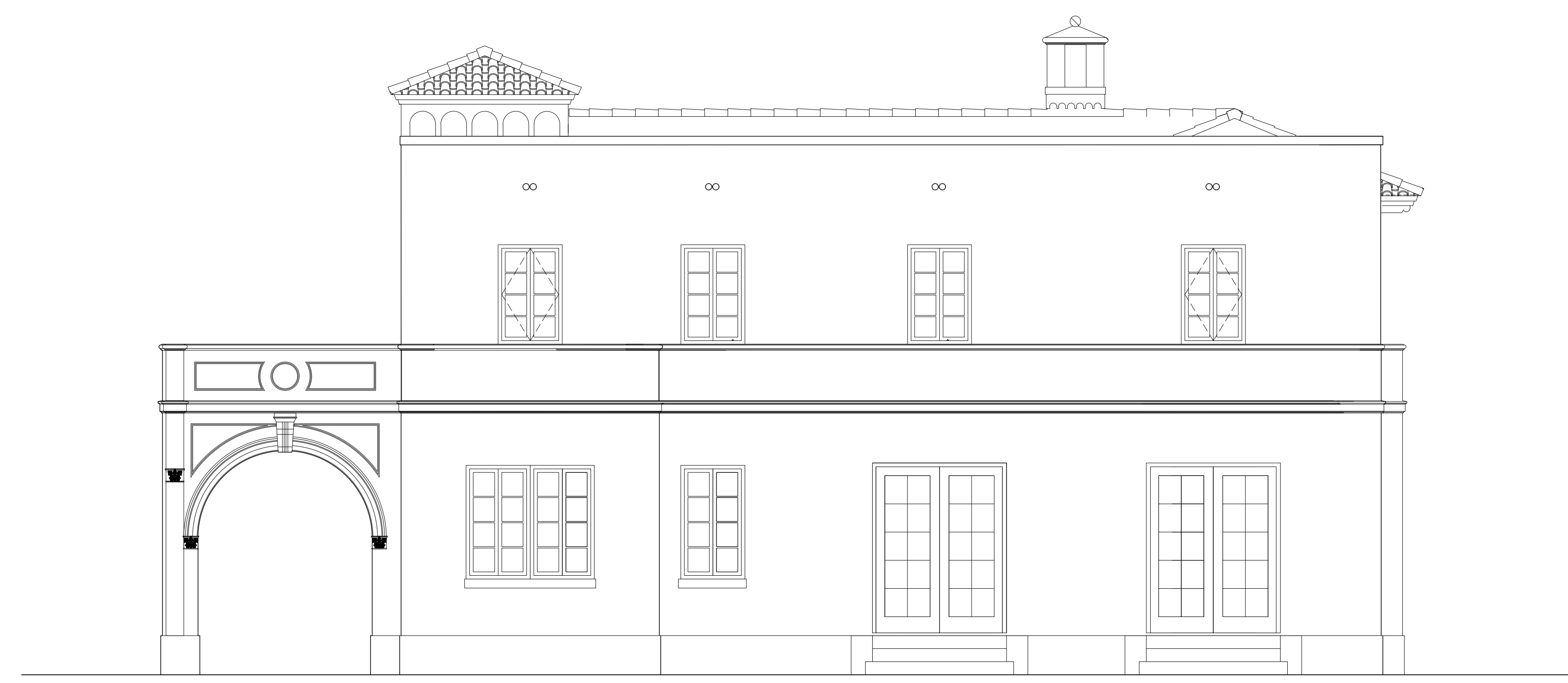
EXISTING REAR ELEVATION 1/4"

CALLUM GIBB ARCHITECT P.A ARCHITECTURE • PLANNING • INTERIORS