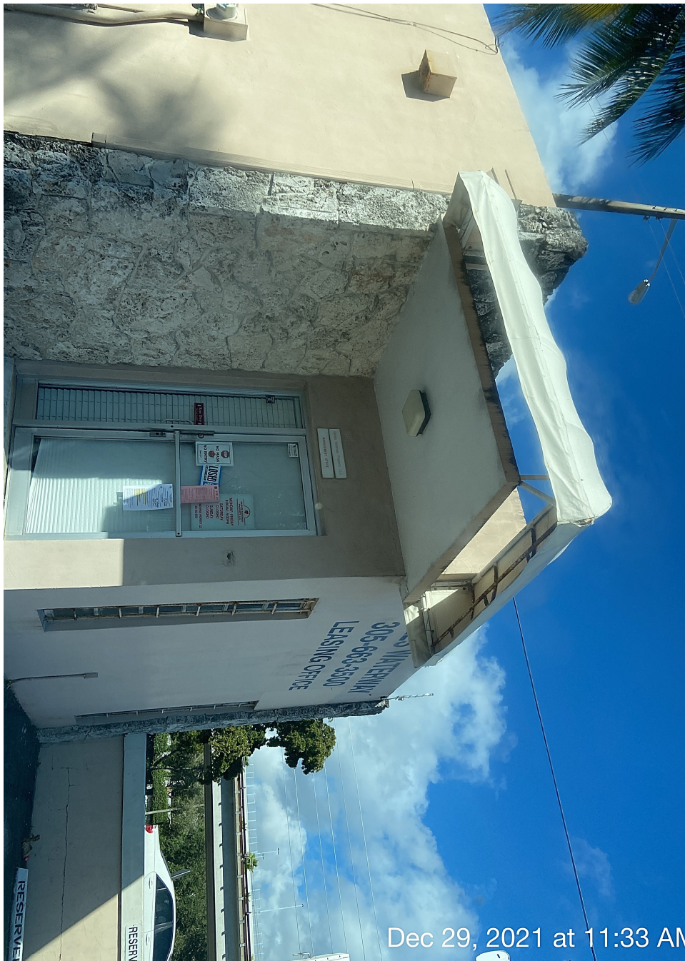
Dec 29, 2021 at 11:33 AM