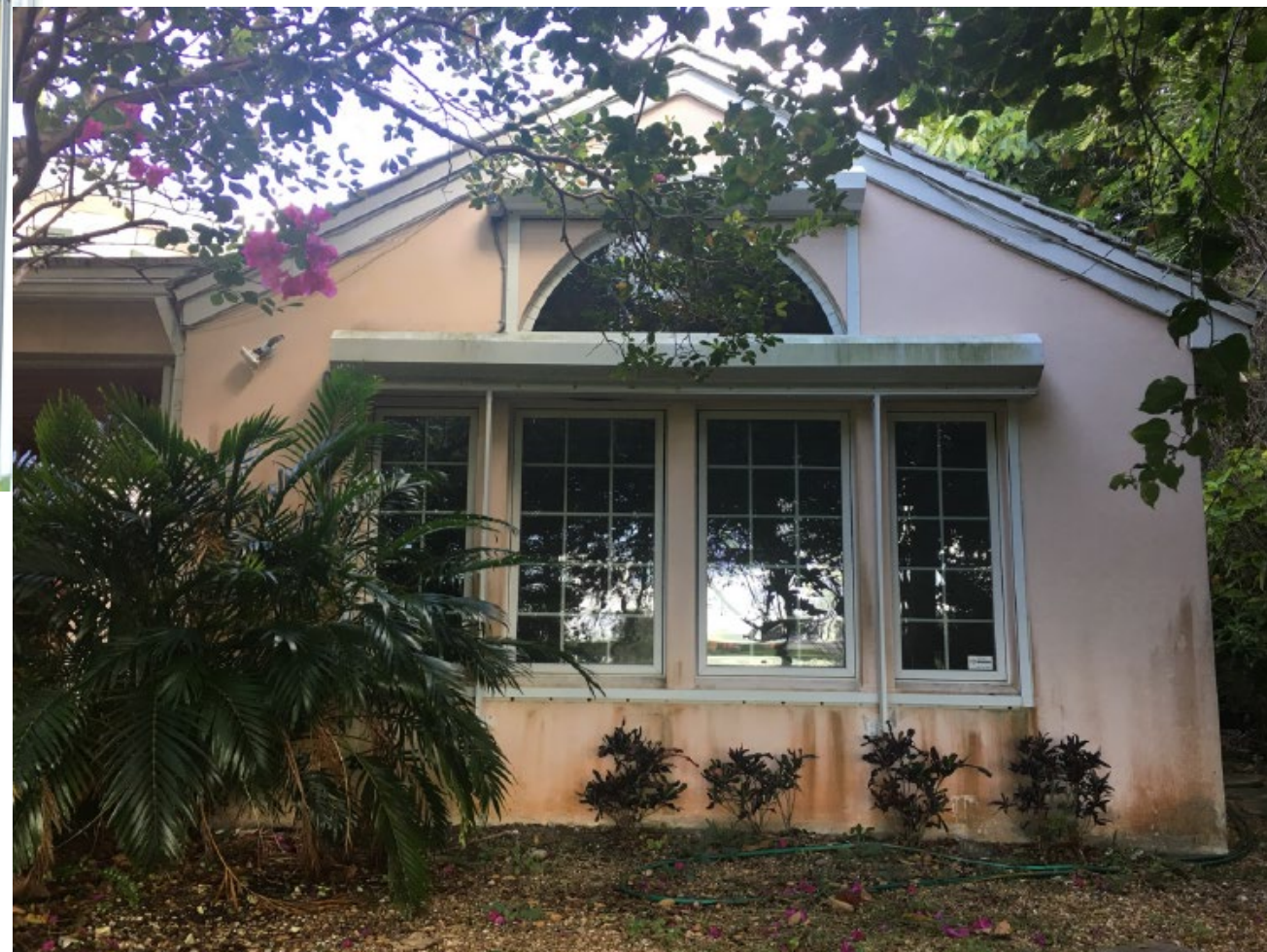
Rear Façade – Before