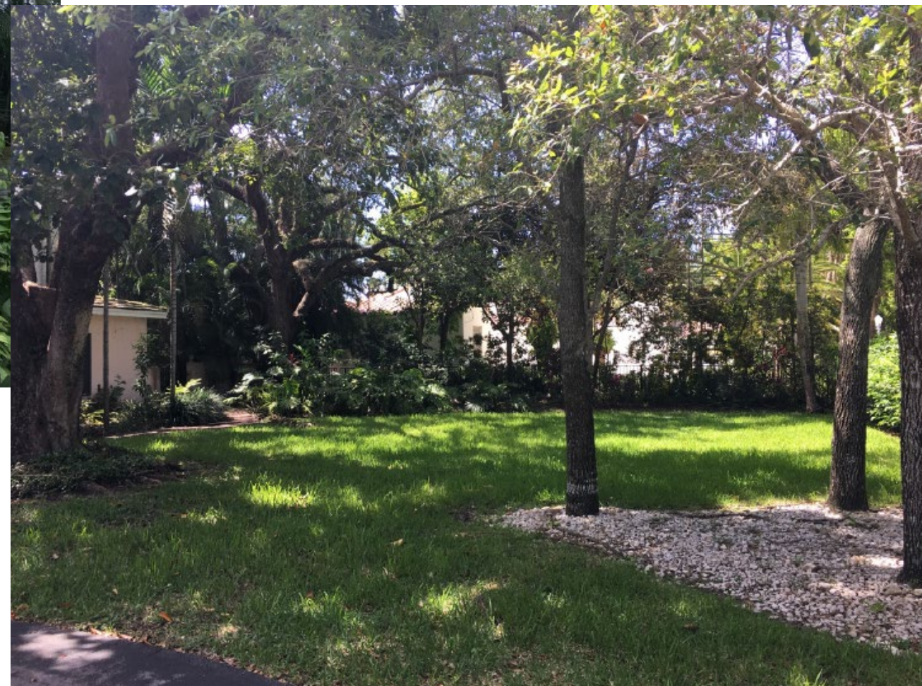
Front Façade & Yard – Before