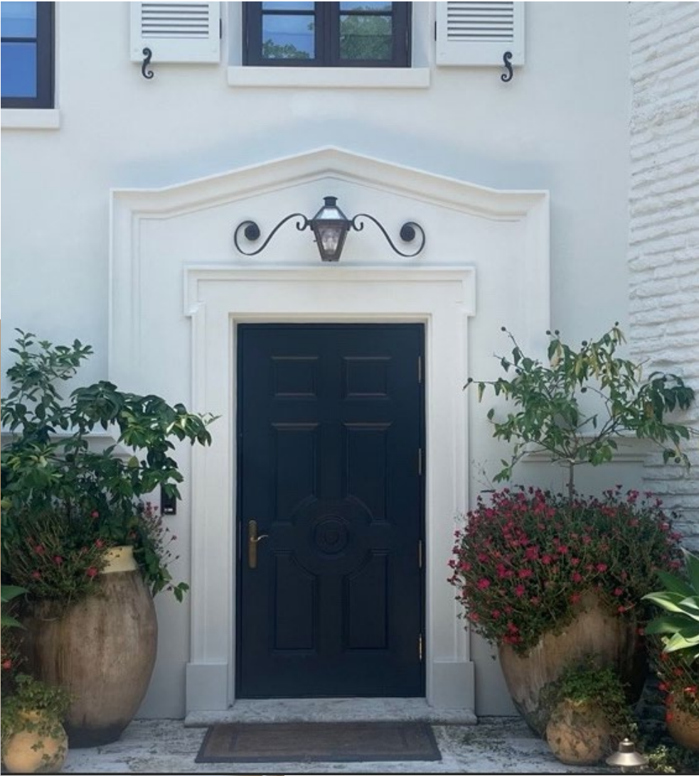
Front Moulding Detail – Before & After