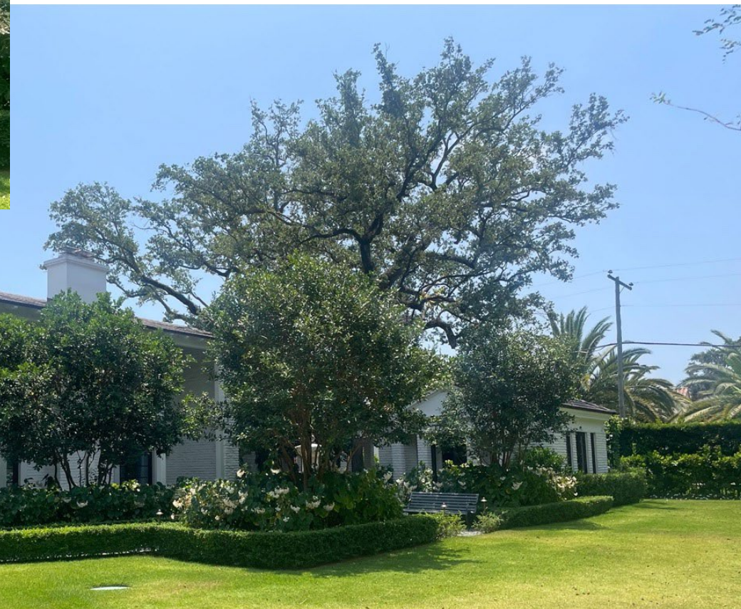
Front Façade – After