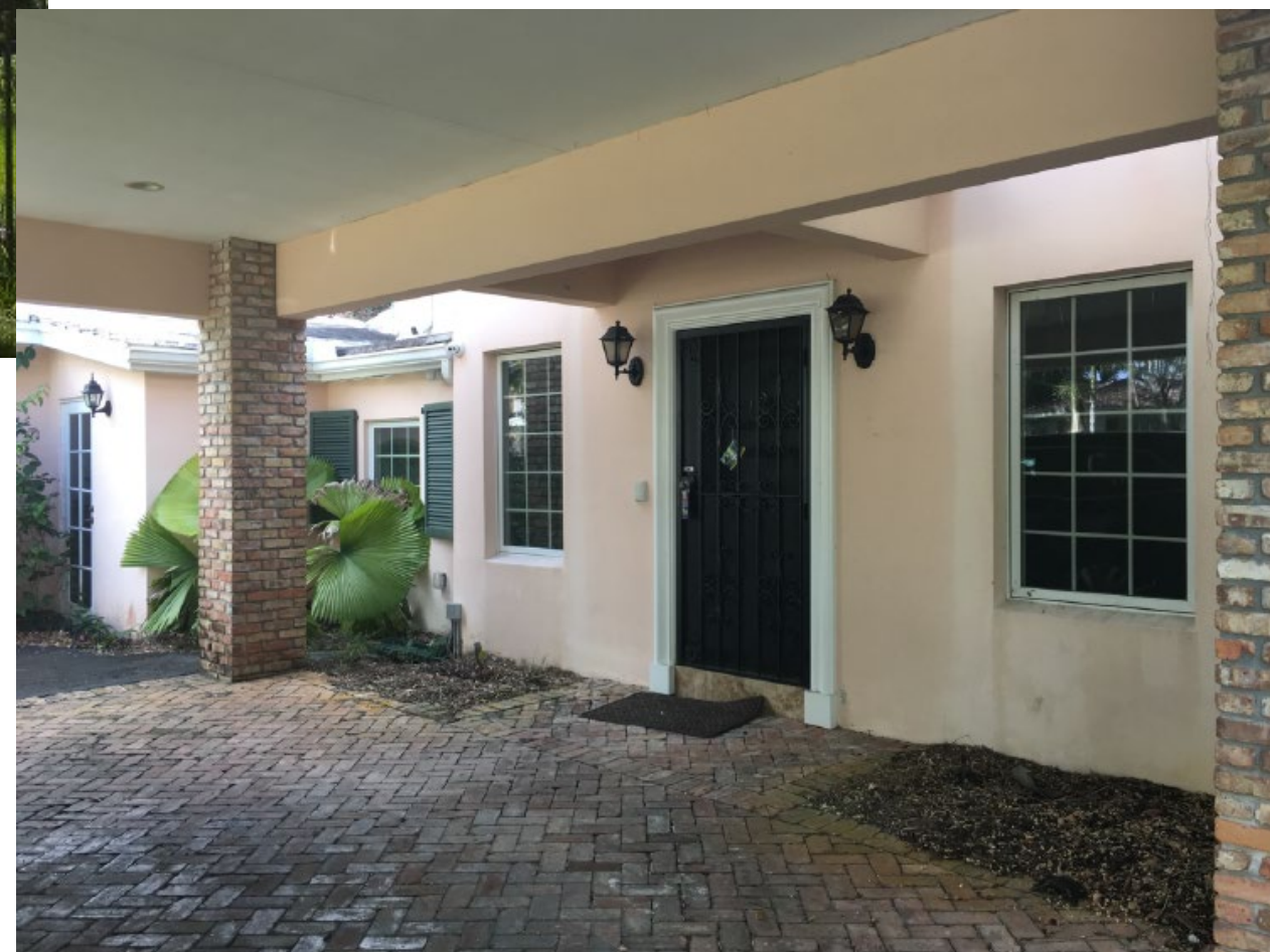
Front Façade – Before