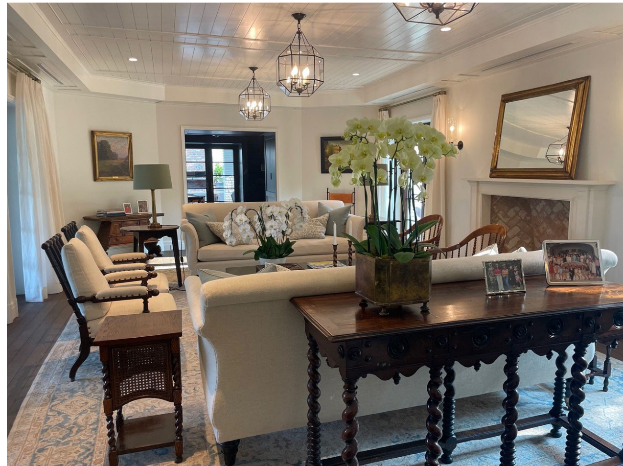
Living Room – Before & After