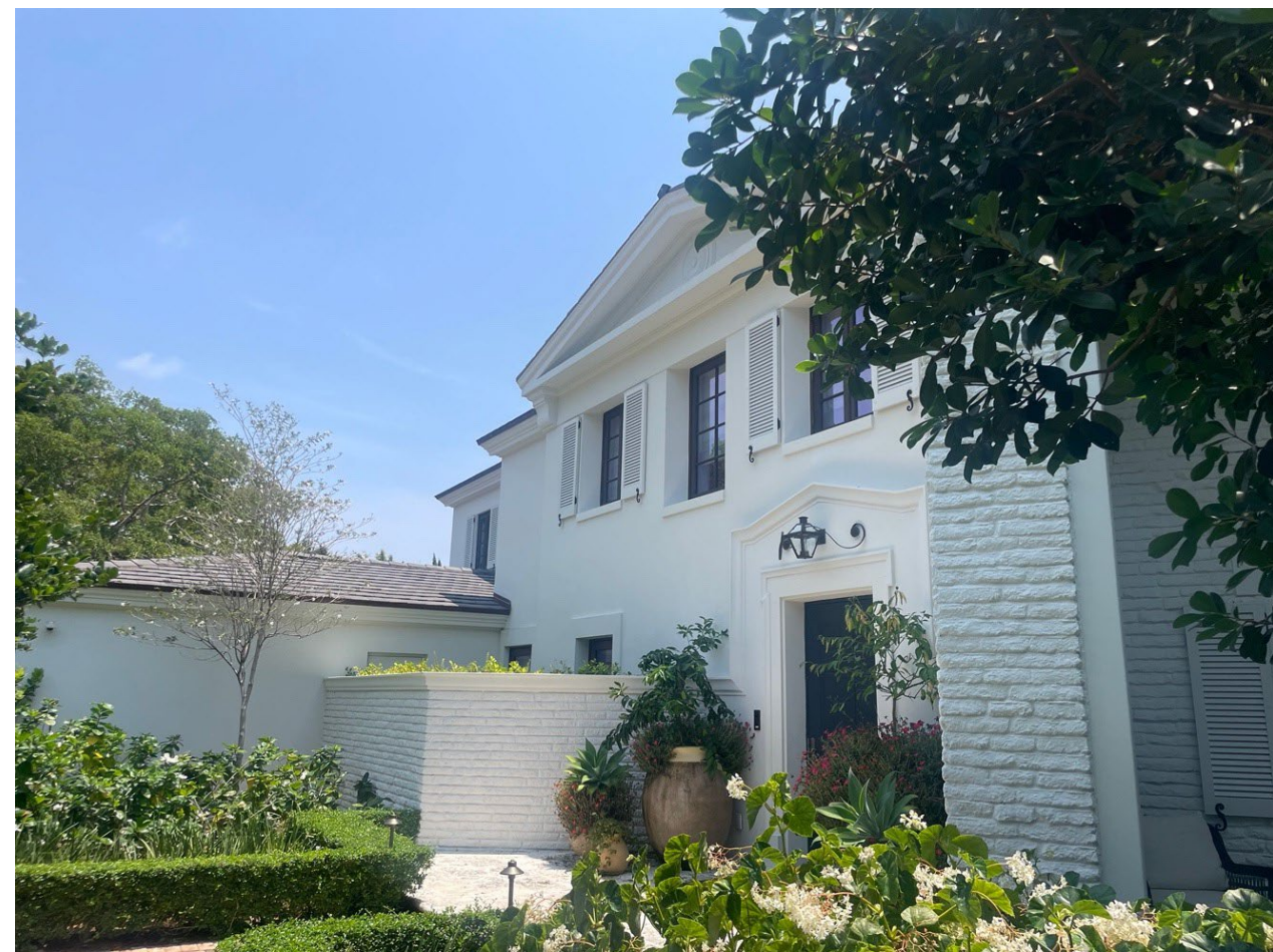
Front Façade –After