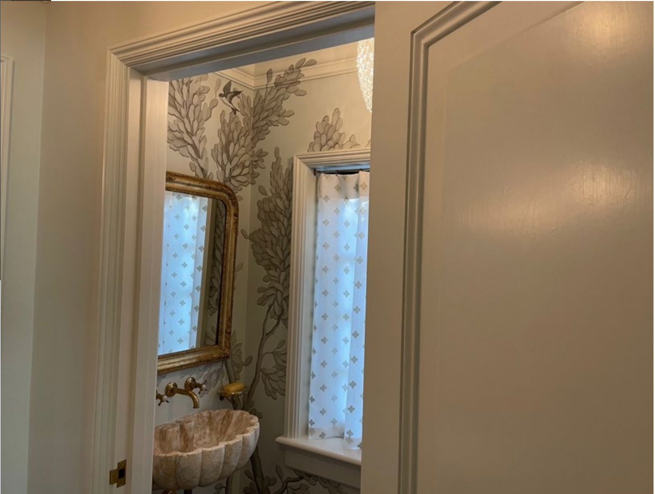
Vestibule – Before & After