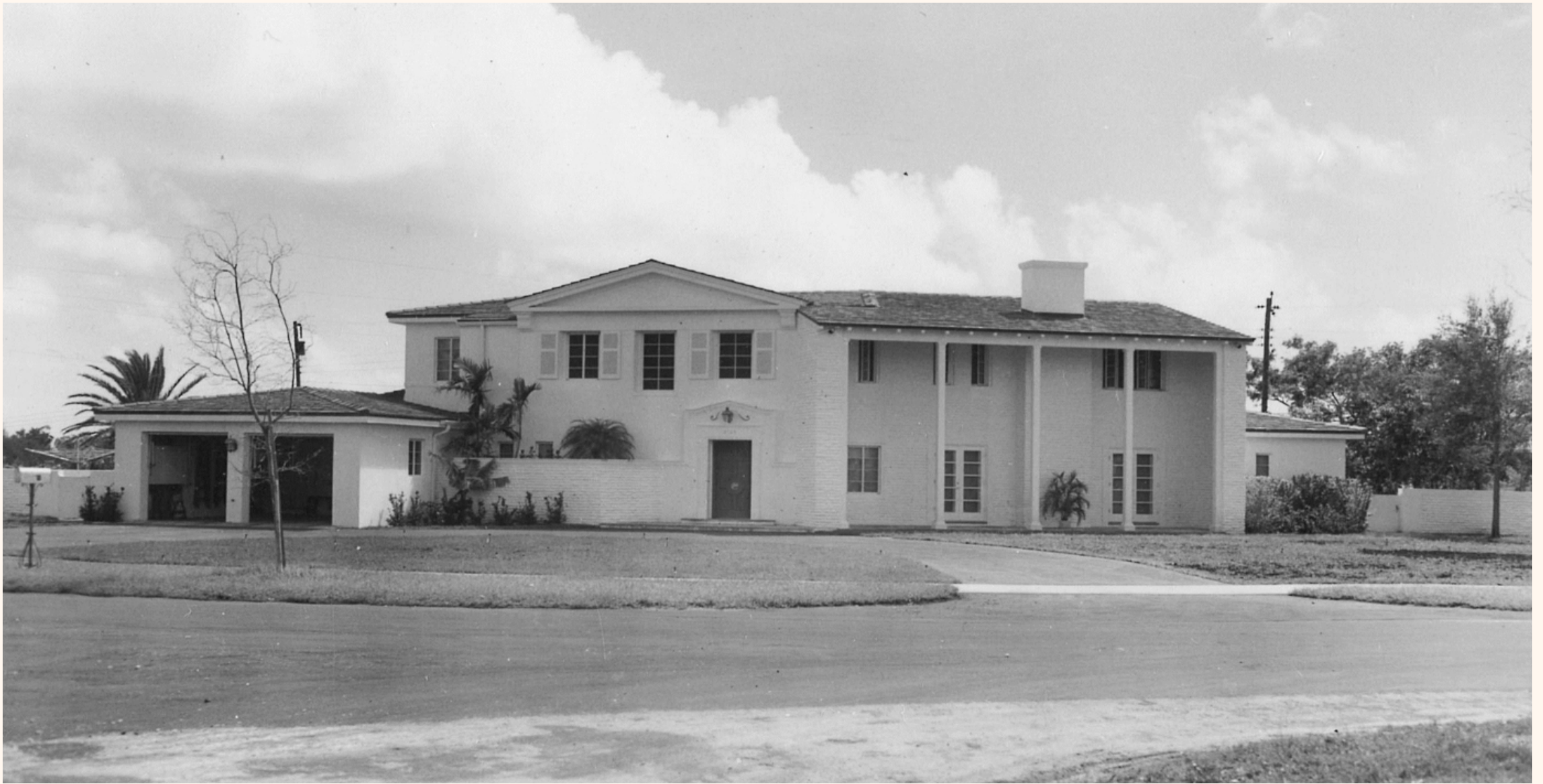
Historic Photograph ca. 1940s 4125 Santa Maria Street