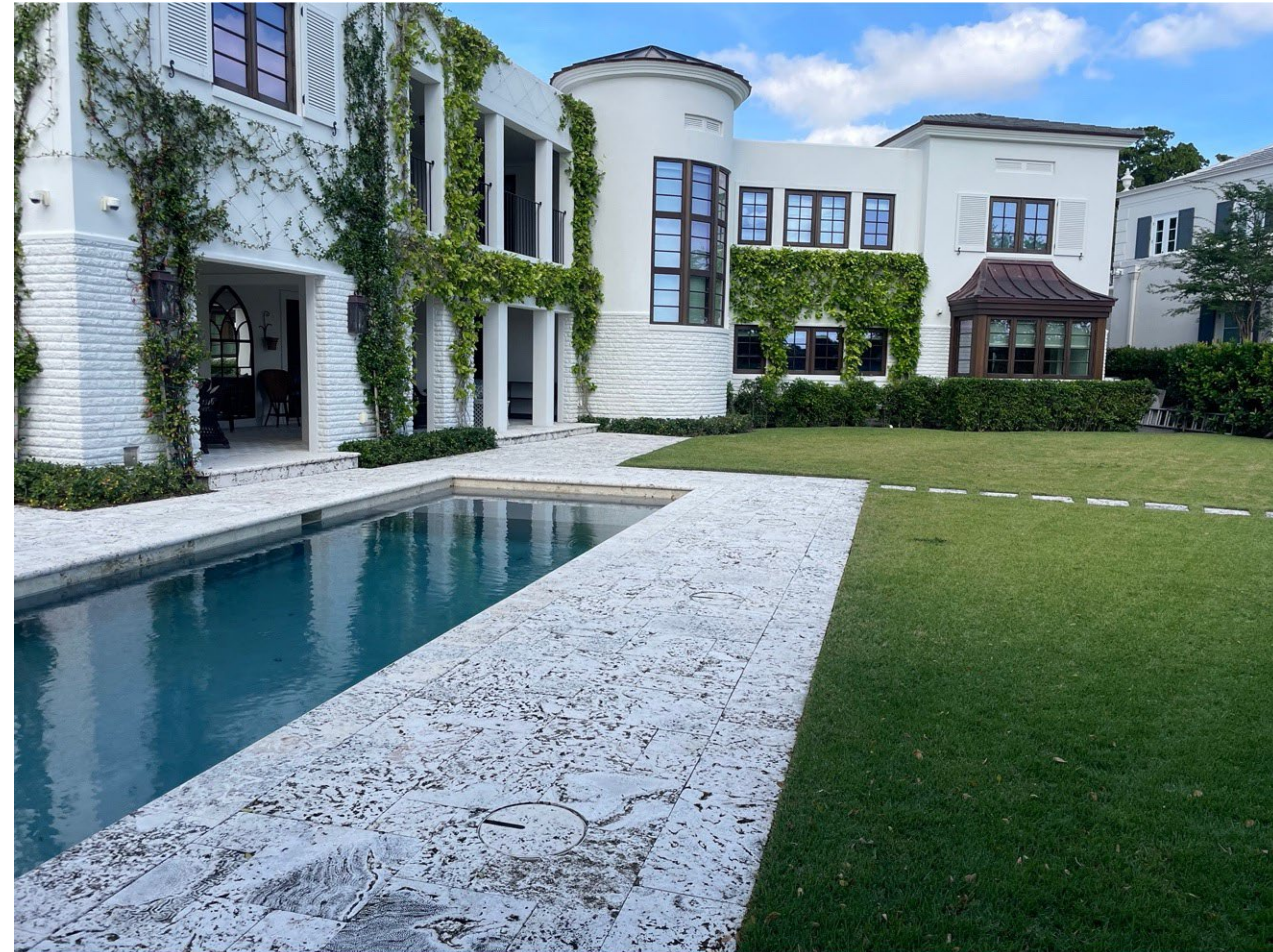
Rear Façade – After