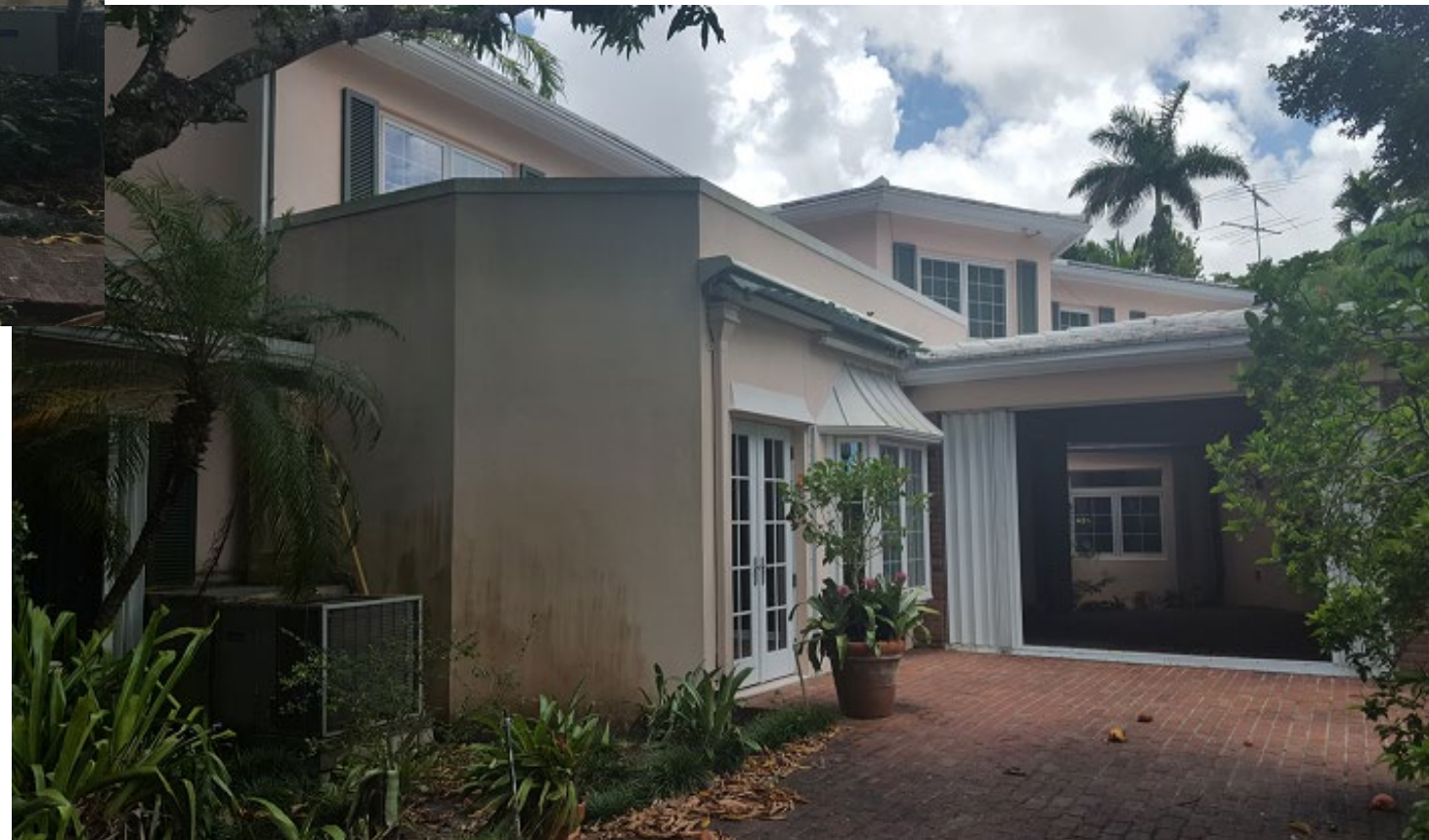
Side (South) & Rear Façade – Before