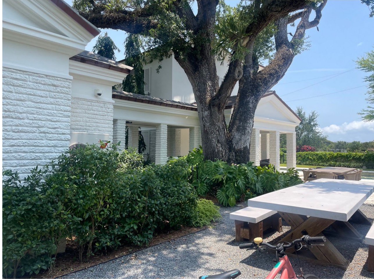
North & South Façade – After