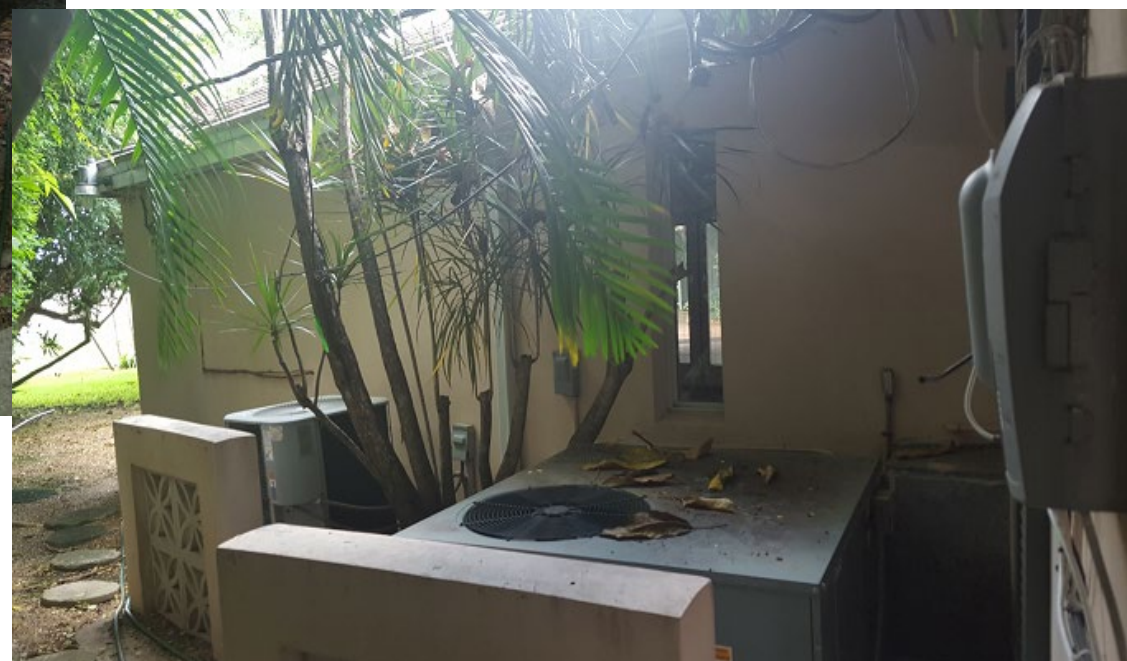
Rear & North Façade – Before