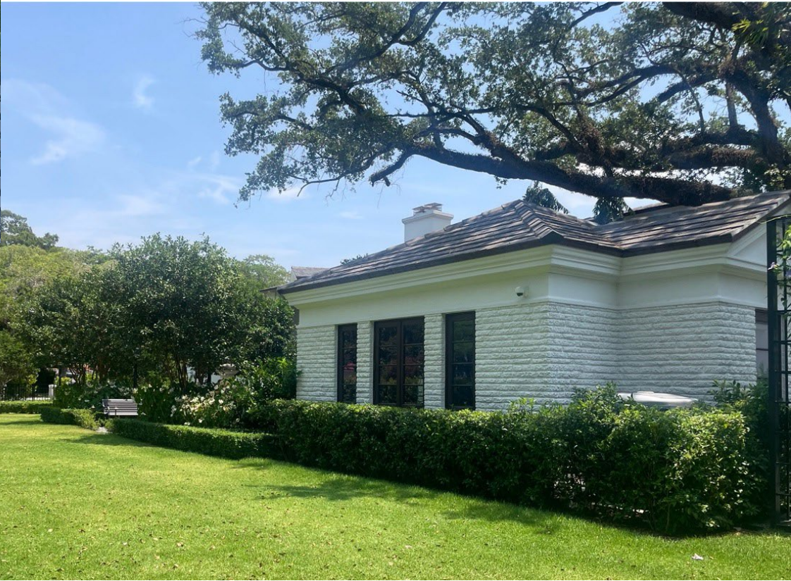
North & Front Façade (Library Addition) – After