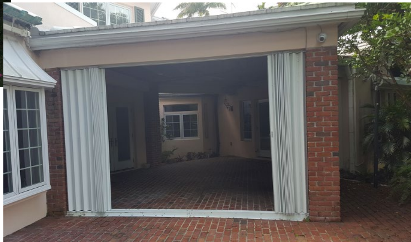
Rear Façade – Before