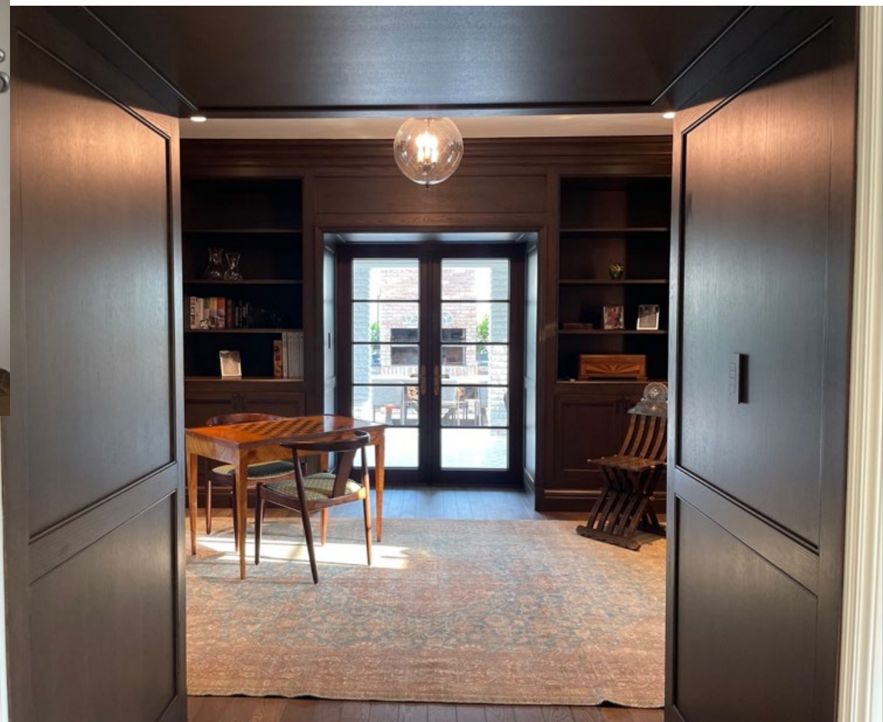
Study – Office/Gameroom – Before & After