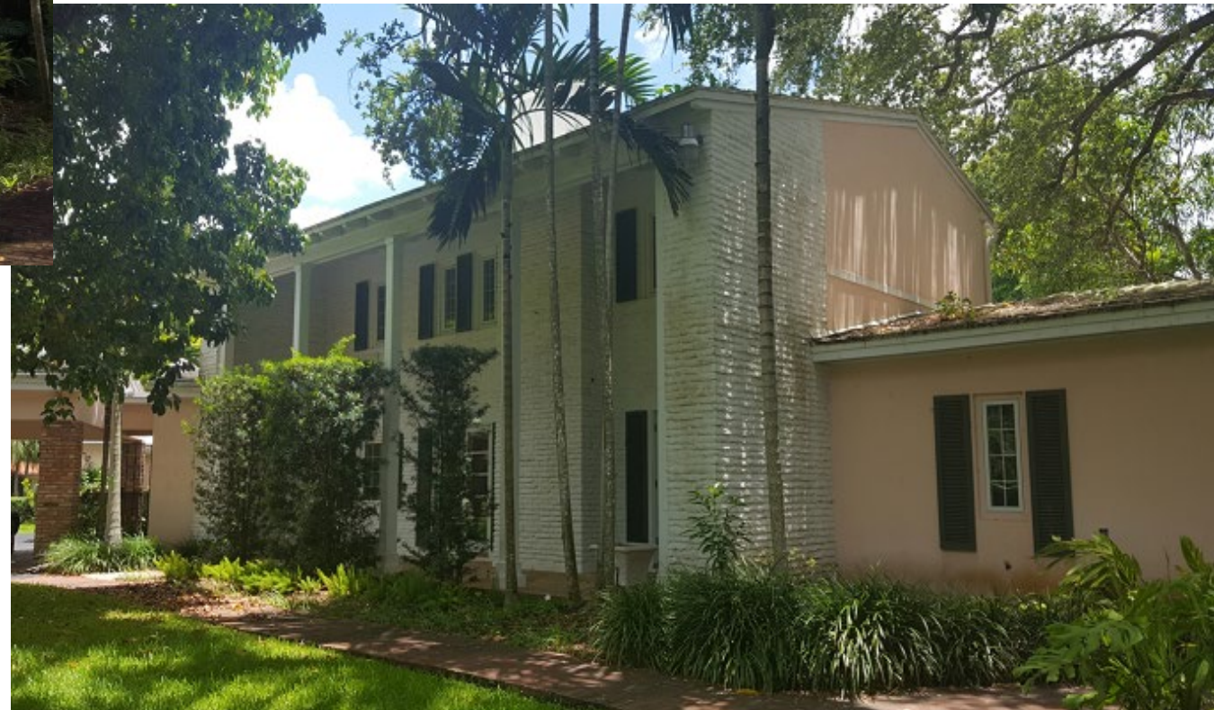
Front Façade – Before