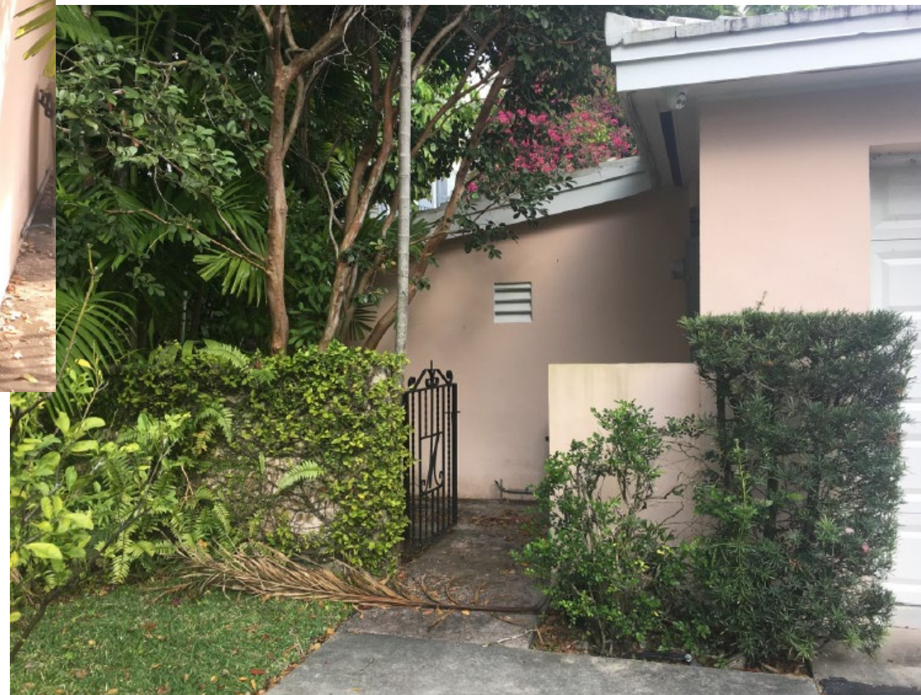
North & Front Façade – Before