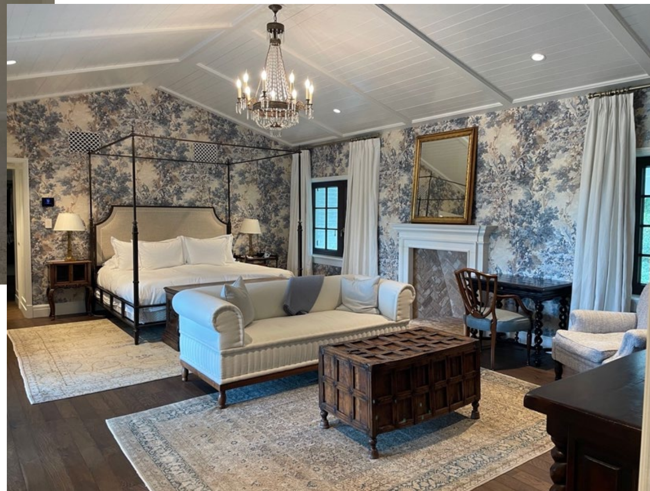
Master Bedroom – Before & After