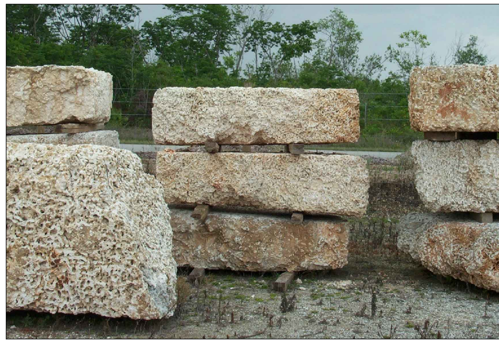
OOLITE STONE SLABS