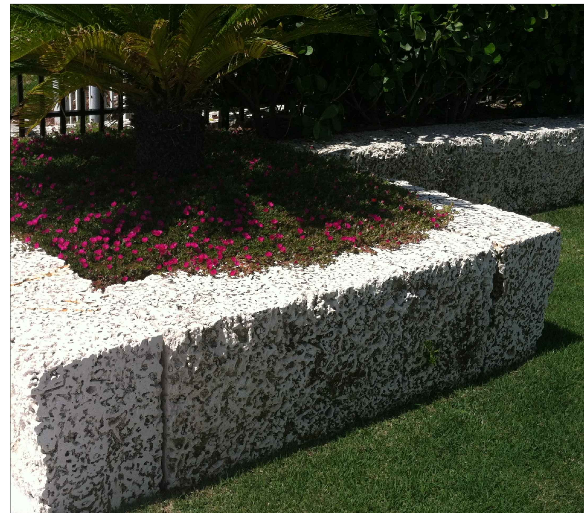
OOLITE RAISED PLANTER