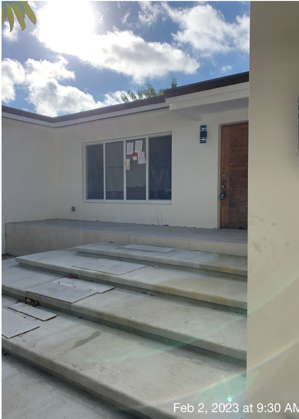
Feb 2, 2023 at 9:30 AM