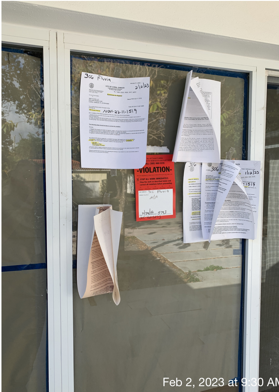
Feb 2, 2023 at 9:30 AM