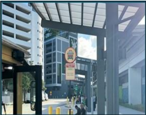
A./D. Douglas Road Metrorail Station