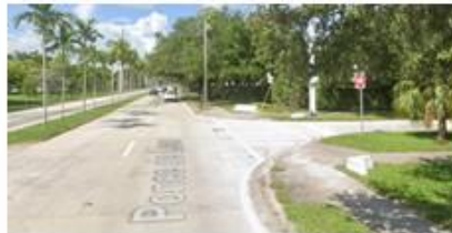
D. 5400 Carillo St.