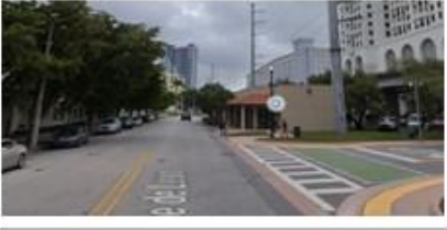
C. 4520 Ponce de Leon