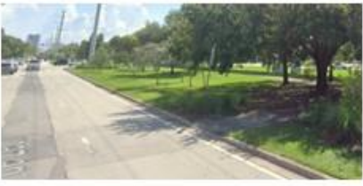
5086 Ponce de Leon