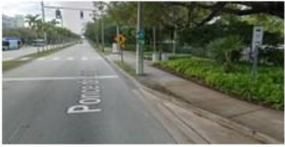
E. UM Train Station