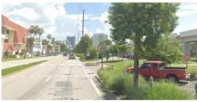
B. 4675 and Ponce de Leon