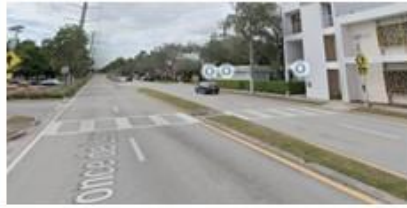
C. 4675 and Ponce de Leon