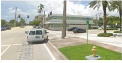
G. San Amaro and Ponce de Leon