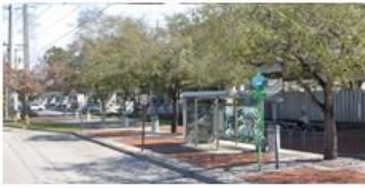
E. UM East