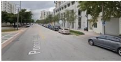
B. 4520 Ponce de Leon