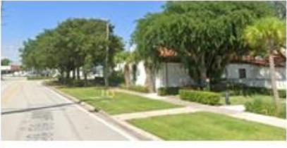
H. 6921 Ponce de Leon