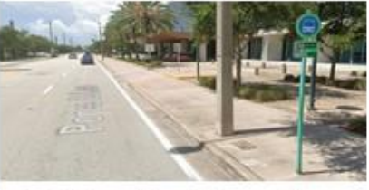
F. Dickinson Dr and Ponce de Leon