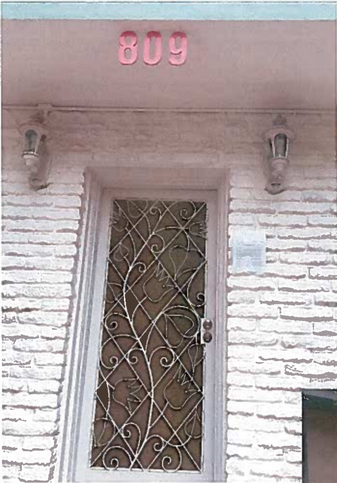
809 FERDINAND STREET