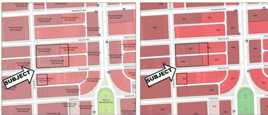
FUTURE LAND USE MAP

Commercial Mid-Rise Intensity and Commercial High-Rise