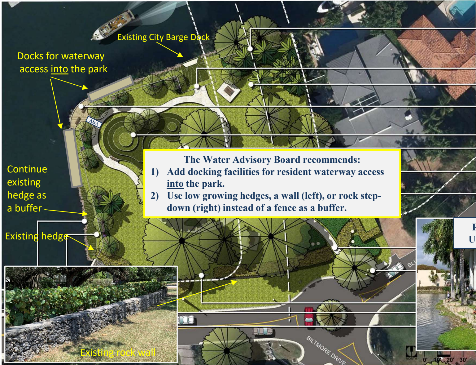
Rock Step-down at UM's Student Union