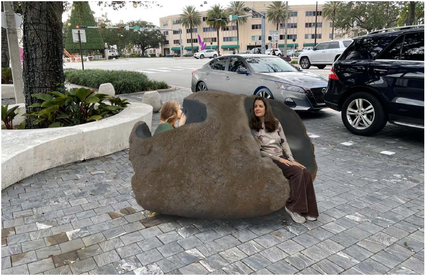
On Coral Way outside of Dicky's