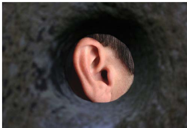
Listening through the hole.

My past work has concerned itself with how the body impresses itself onto the world and the world onto the body. This could be described as the process of living. “Whispering through a stone” will be carved to conform to the negative shape of the body, encouraging the viewer to immediately imagine a body in the negative cavity. The cavity’s bodily impression, along with its smooth, polished inner surface, will invite the viewer to inhabit the space. The rough, weathered outer surface of the rock will carry the traces of the stone’s history of formation. The hole through which to whisper through will be a discovery at first. Over time and with use, the sculpture will become known as a tool for communication and will call the public to use it. What if we were to replace our phone with a stone? How do these objects shape our communication? The iPhone forces us to speed up time while “Whispering through a stone” allows us to slow down time. No matter how much we slow down for a moment of connection with another person it will always stand in sharp contrast to geological time. Our conversations punctuate a history and a future that extends far beyond us in both directions. This humbling realization about our own ephemerality will give rise to the need to make our conversations more meaningful.