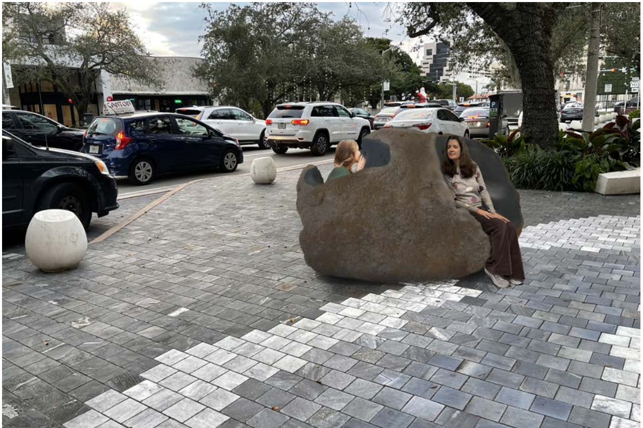
On Coral Way in front of the bridal shop.