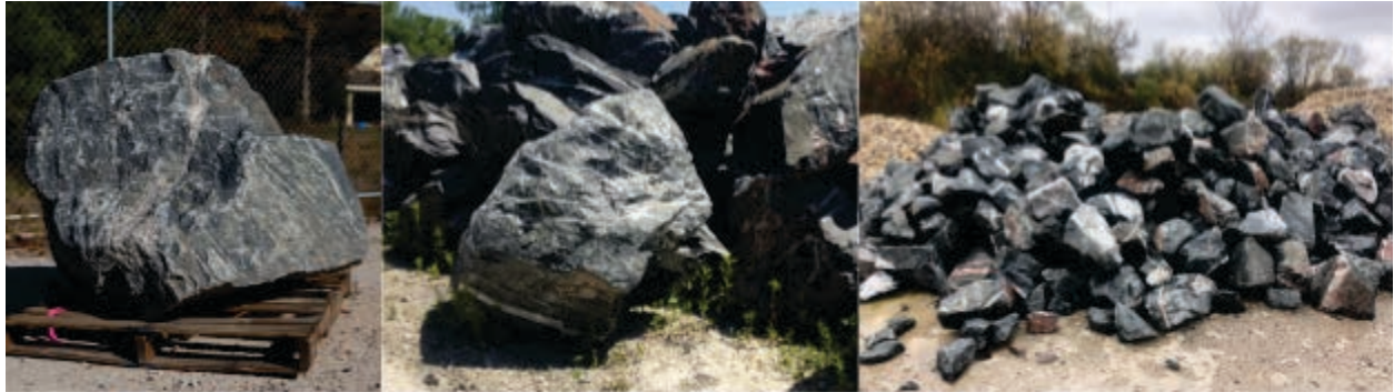
Searching for the perfect stone