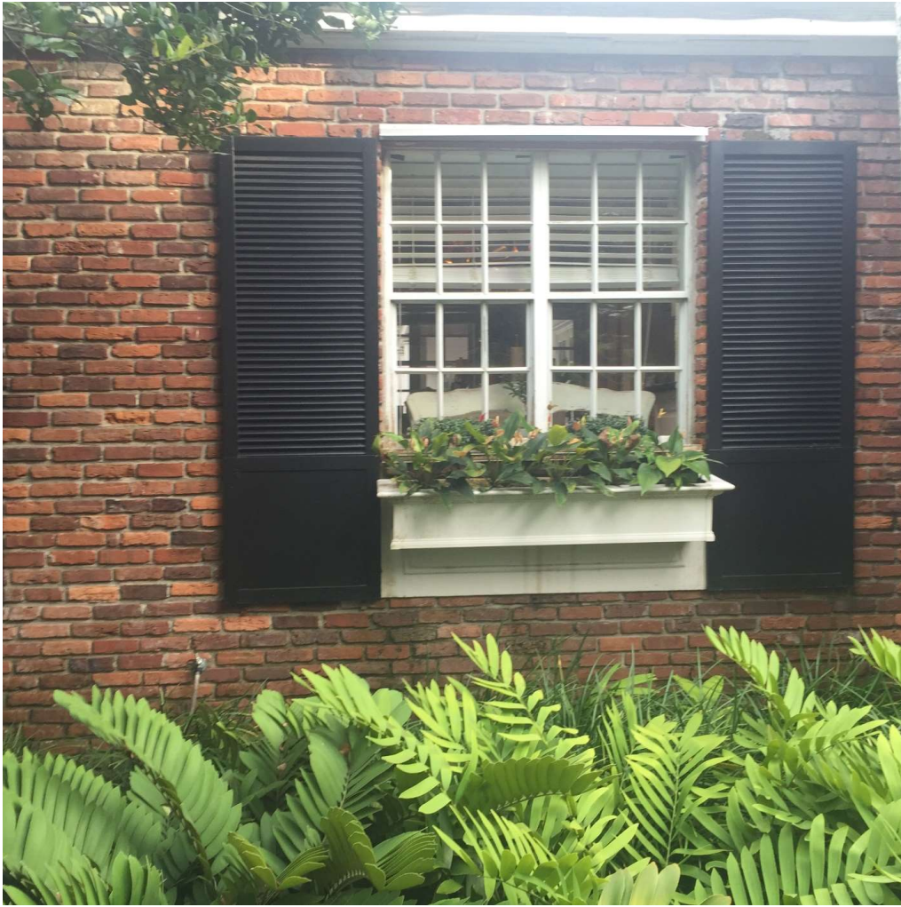
Before – left After - right