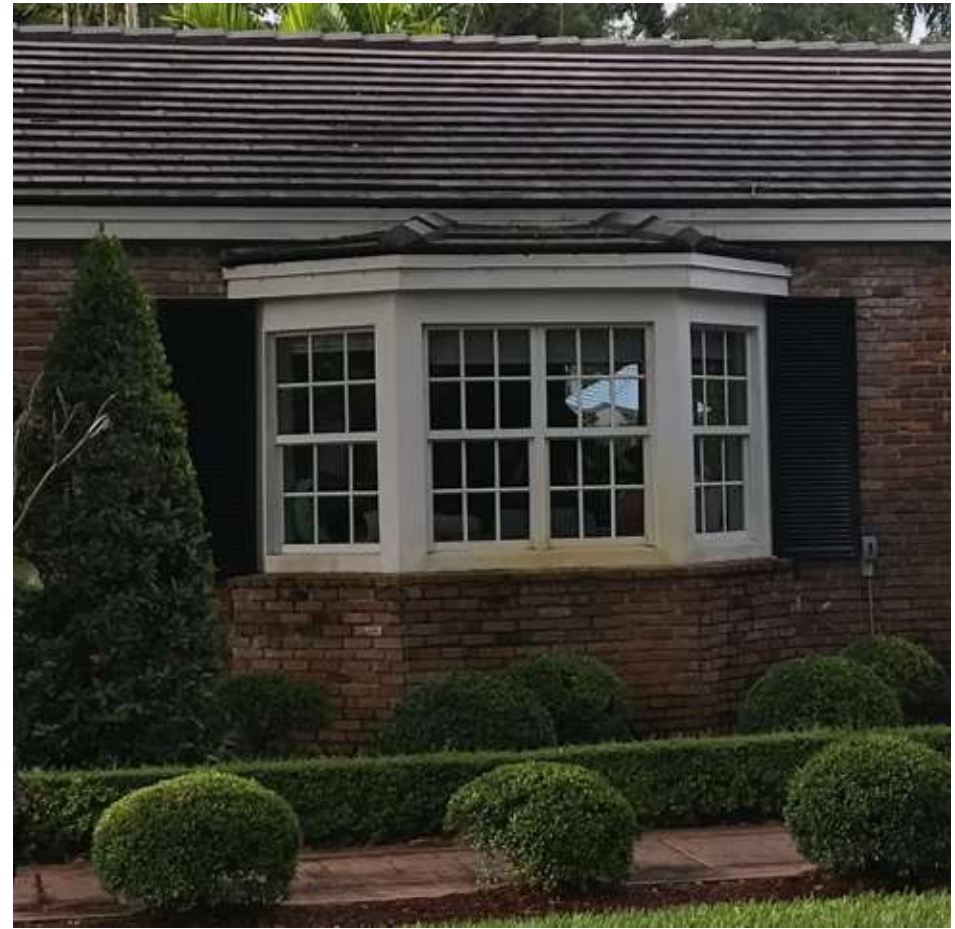
Before – left, After - right