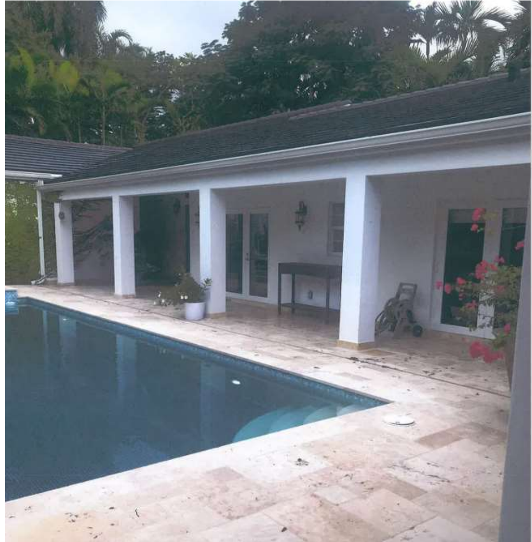
Before – left, After - right