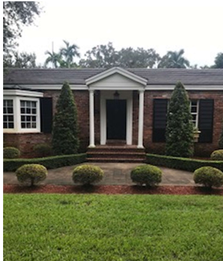
Before – left, After - right