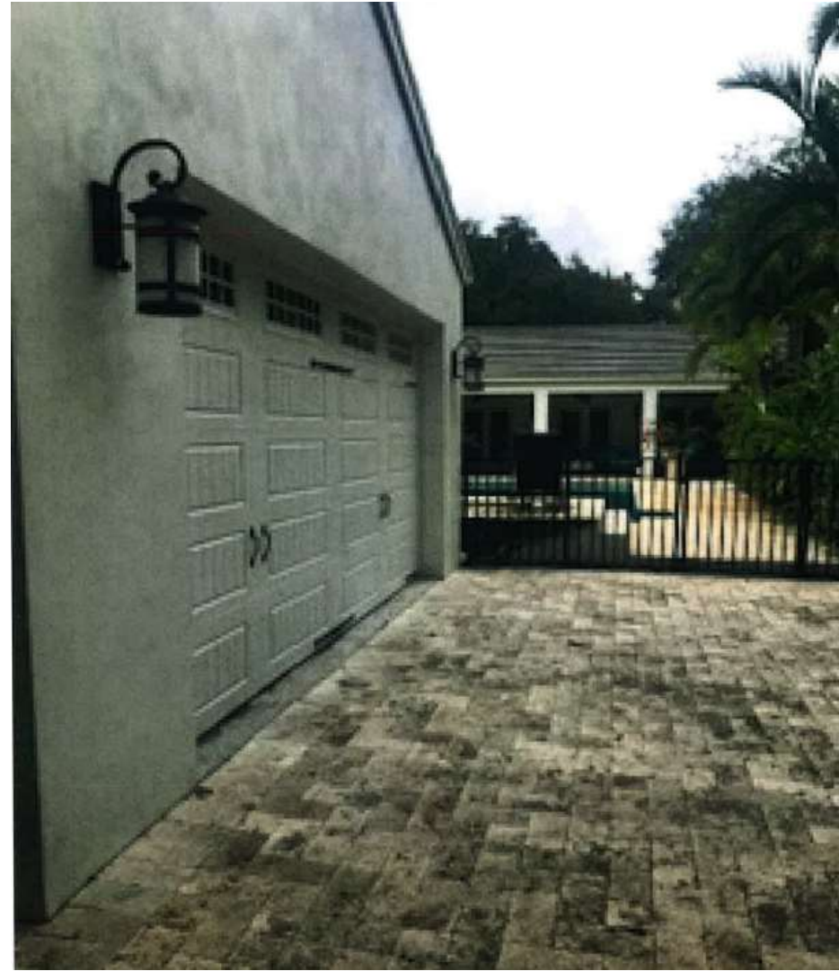
Before – left, After - right