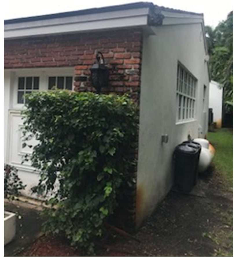
Before – left, After - right