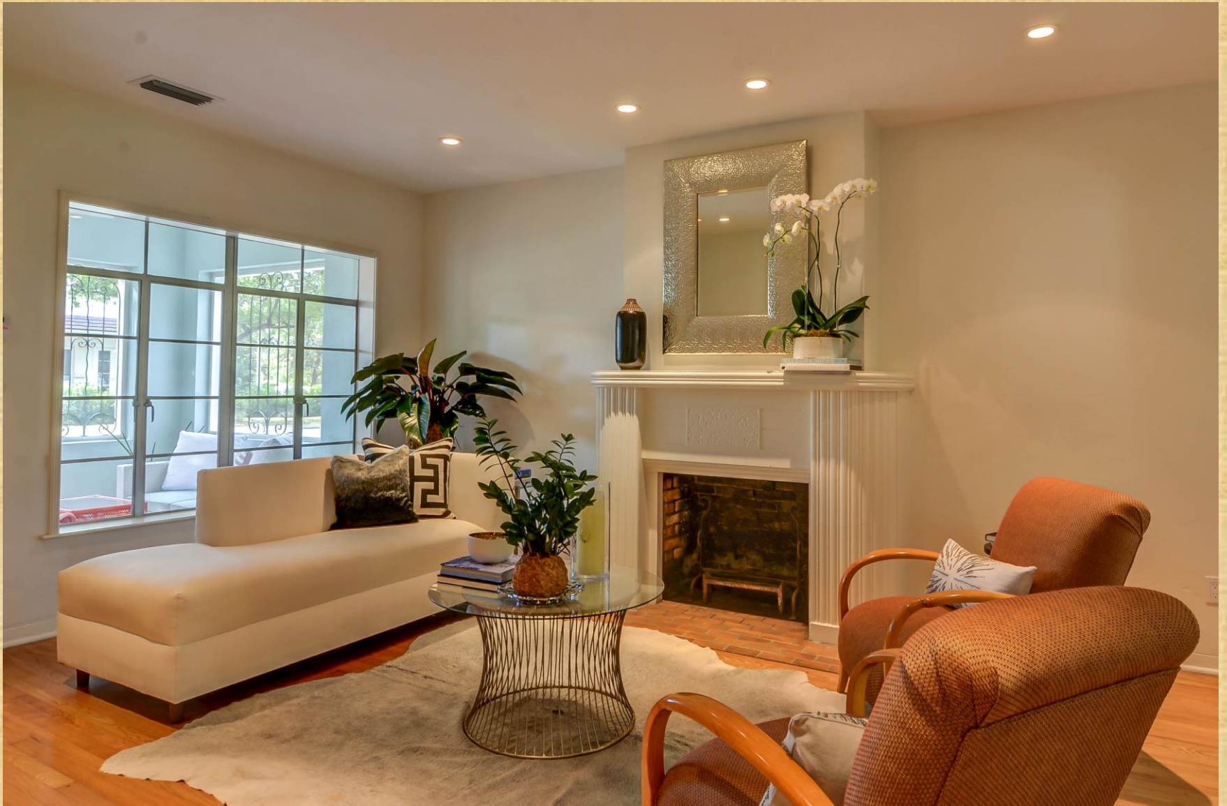
Living Room - After