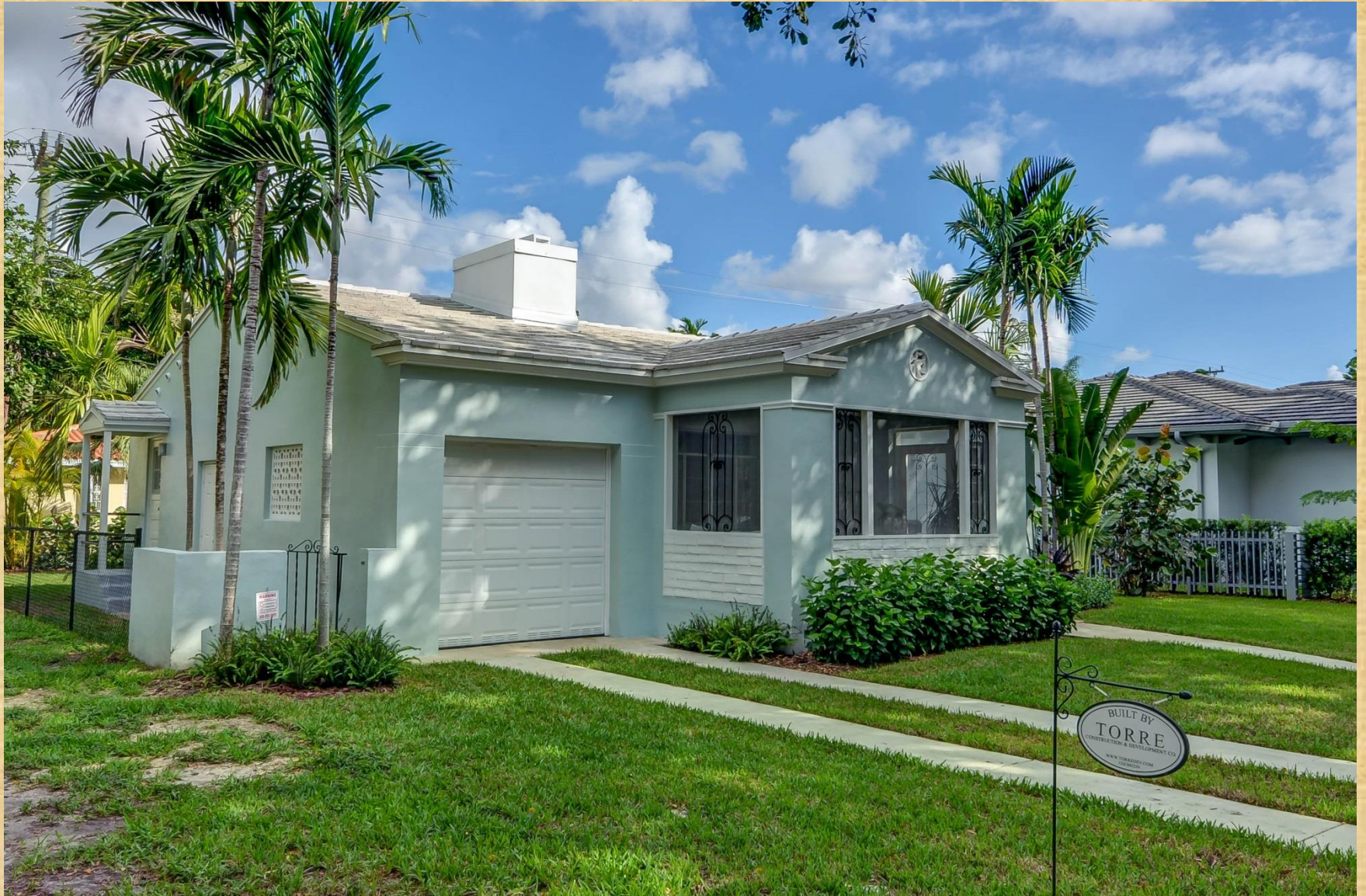
Southwest Corner - After