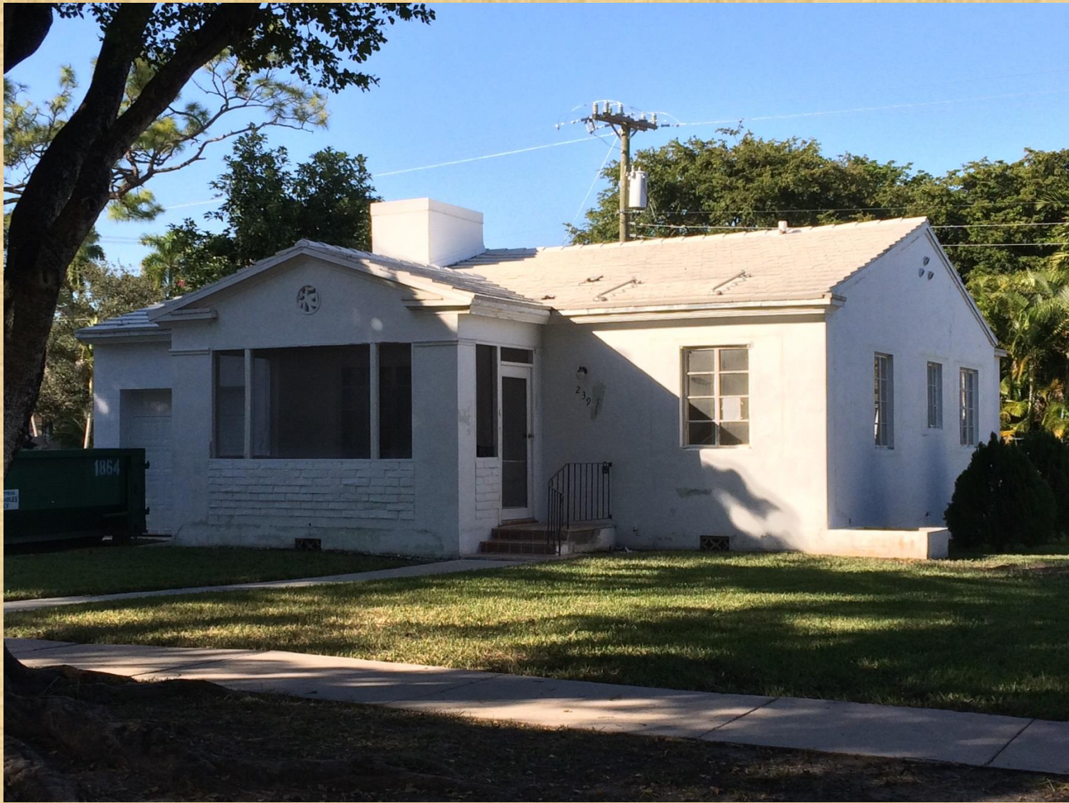
Southeast Corner - Before