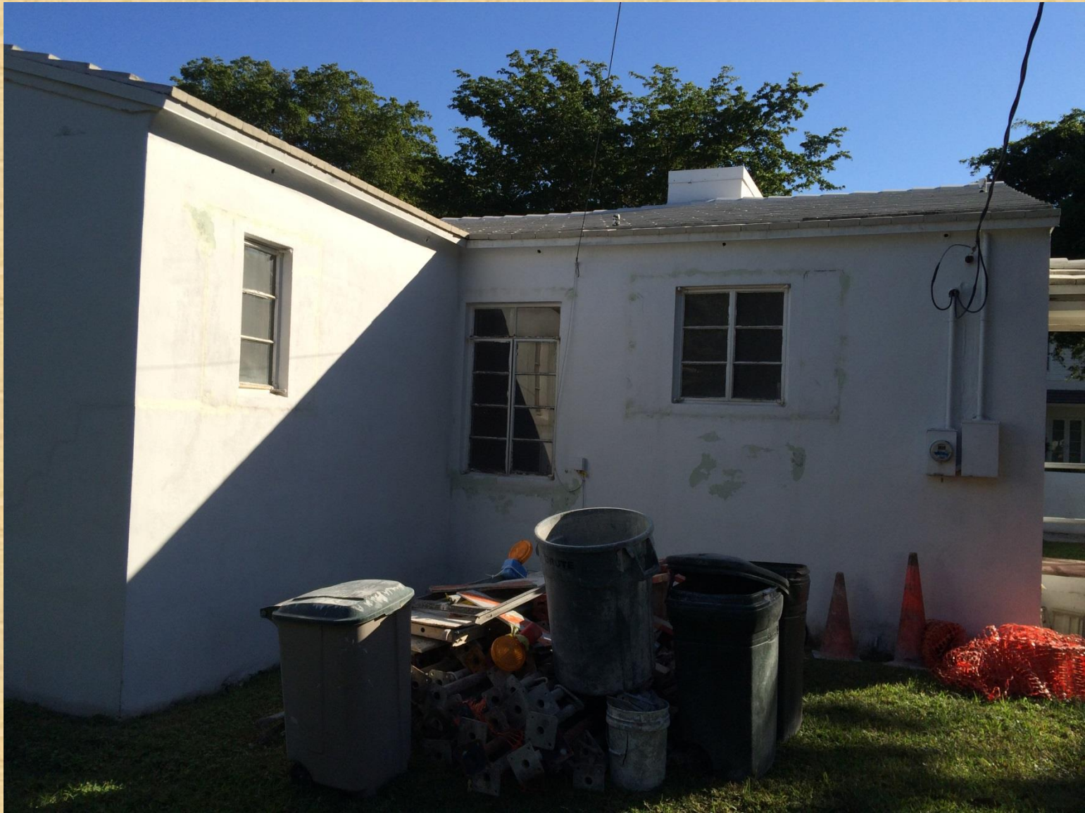
North Façade - Before