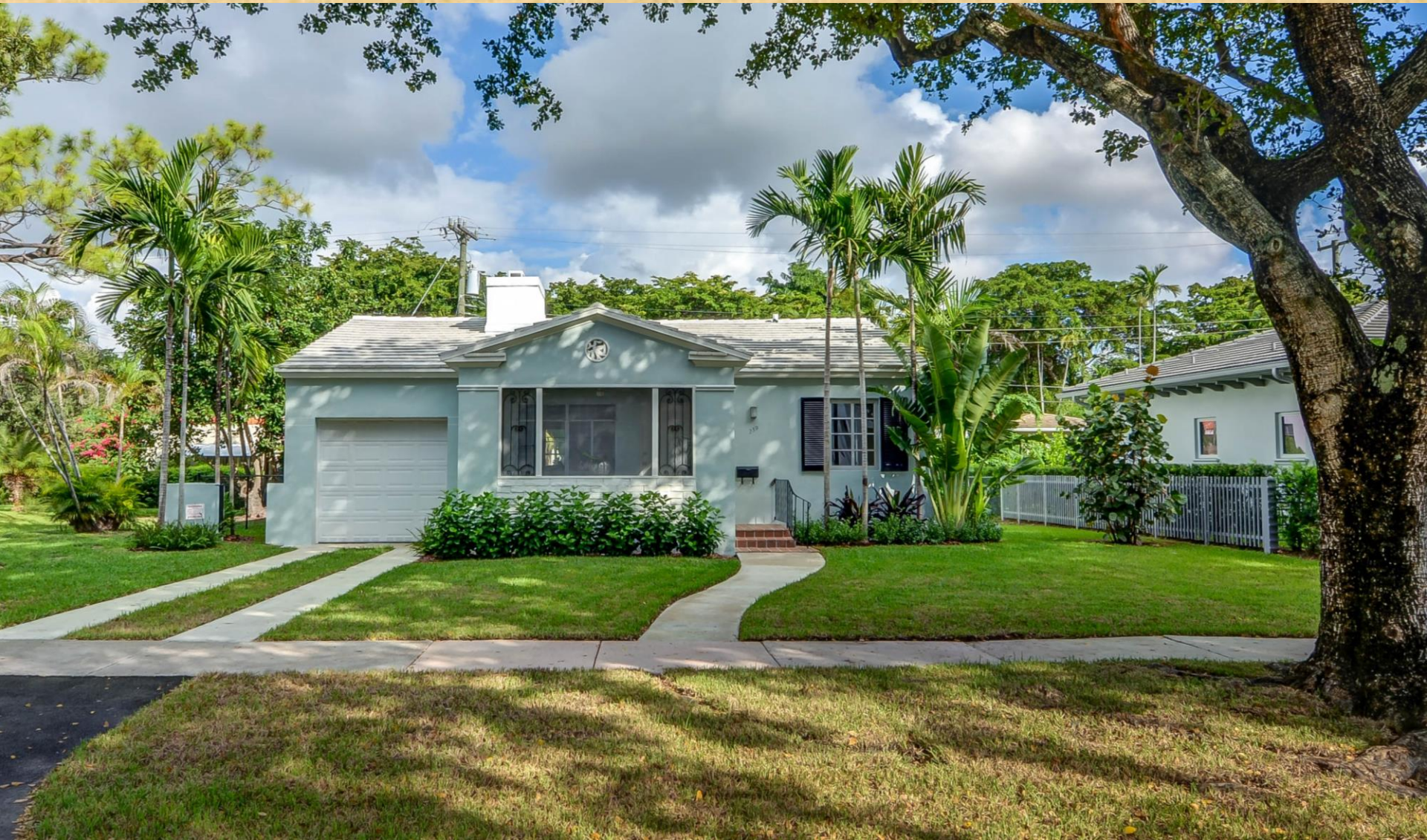
South Façade - After