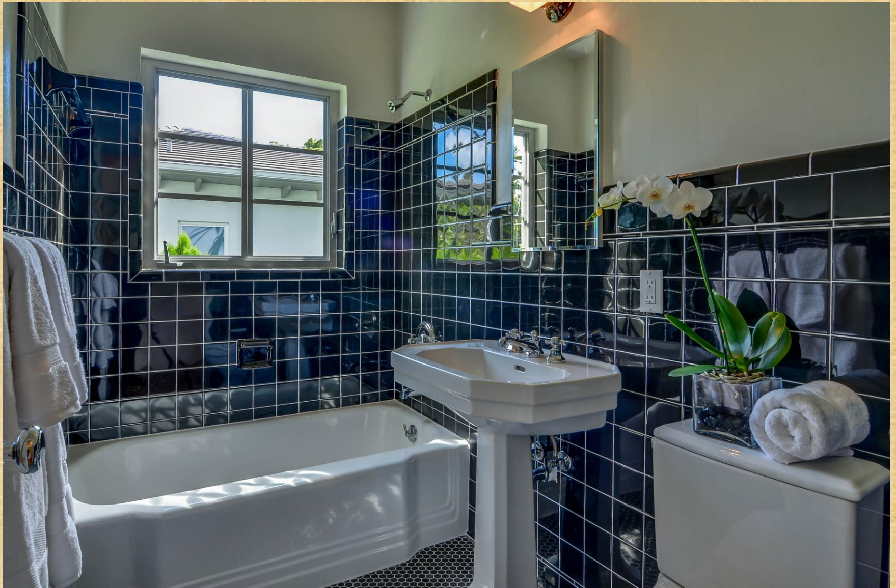
Bathroom - After