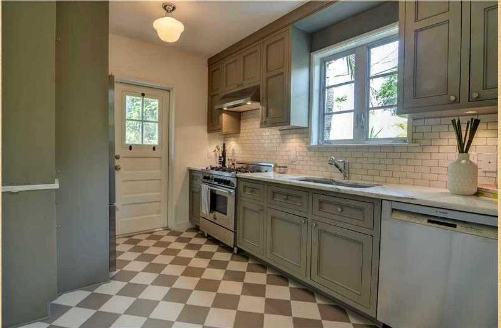
Kitchen - After