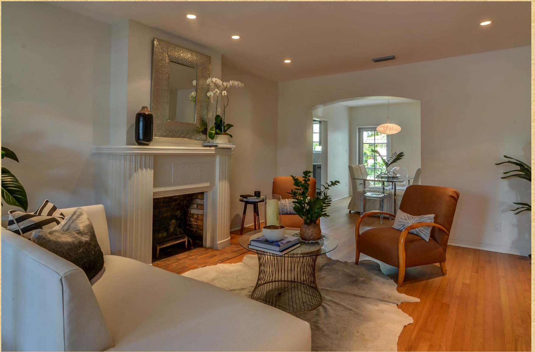
Living Room - After