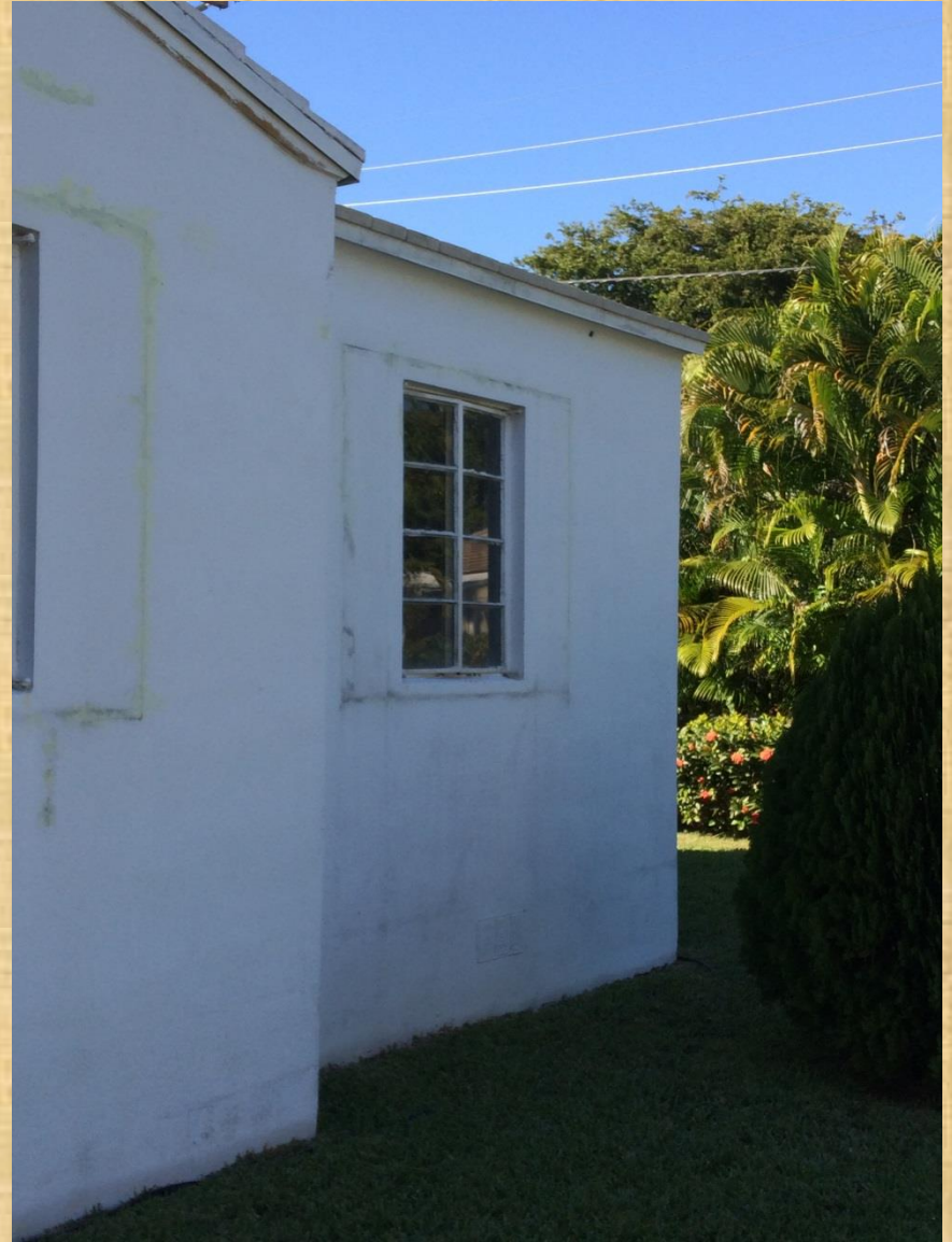
East Façade - Before