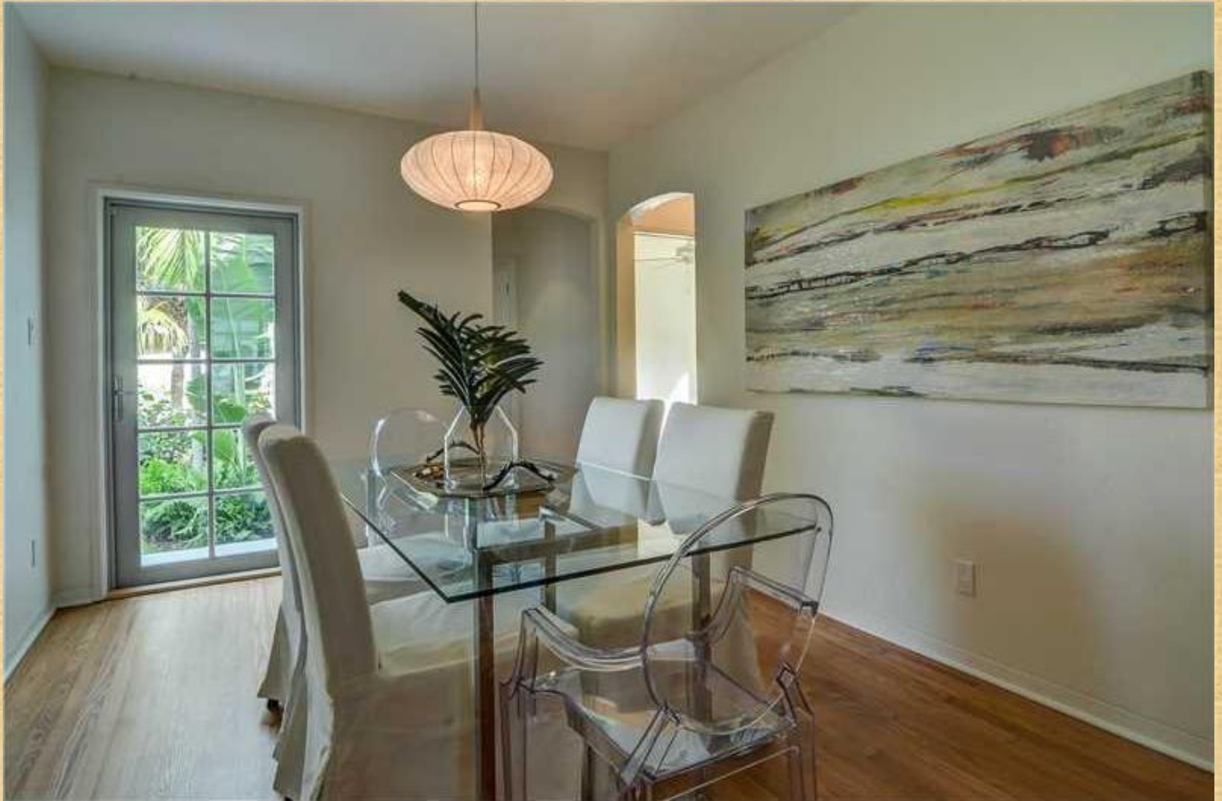
Dining Room - After