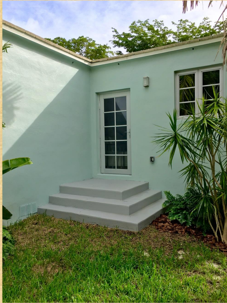
North Façade - After