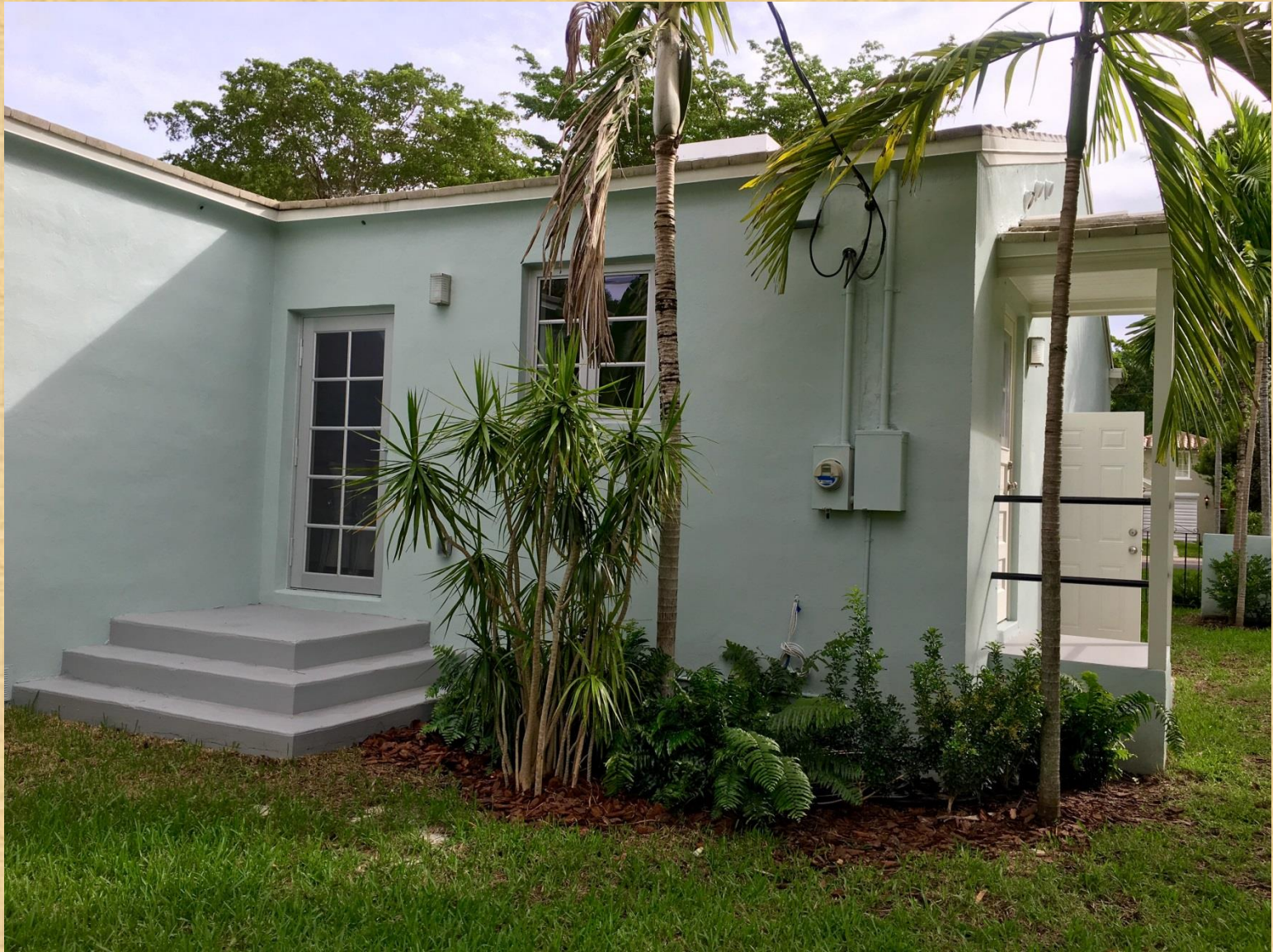
North Façade - After