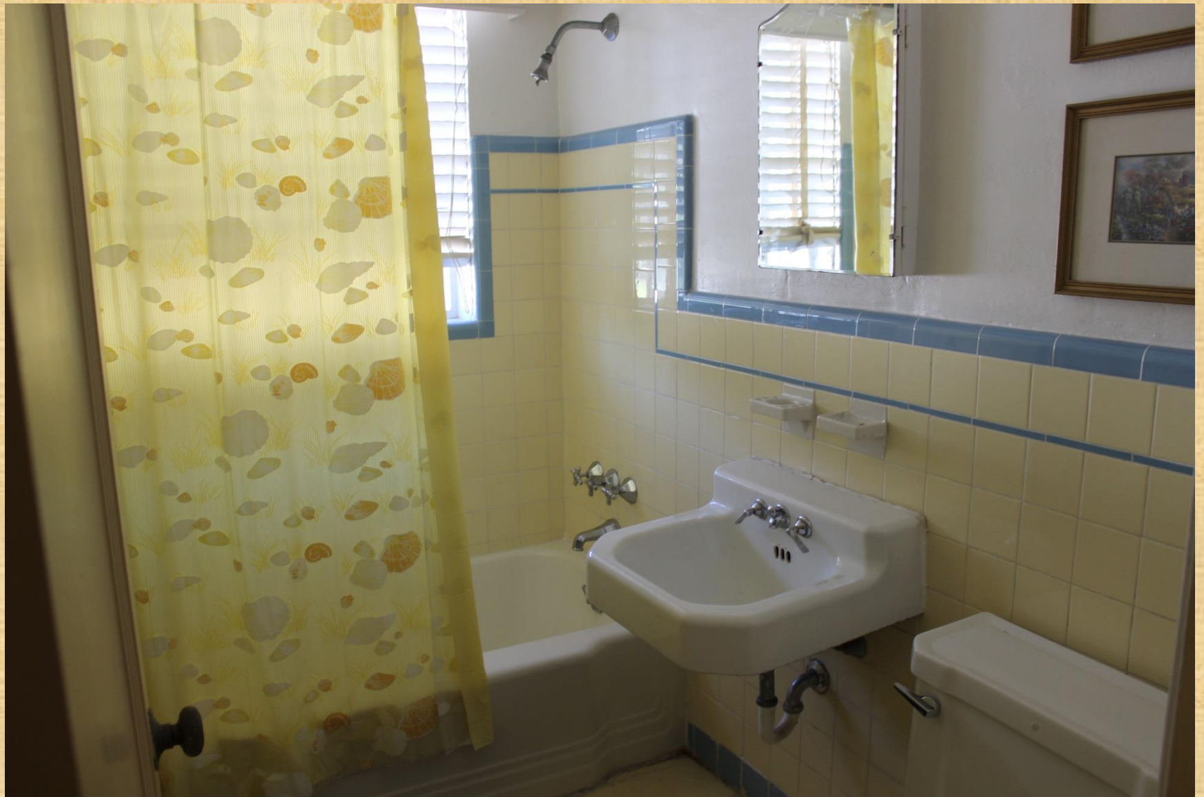
Bathroom - Before