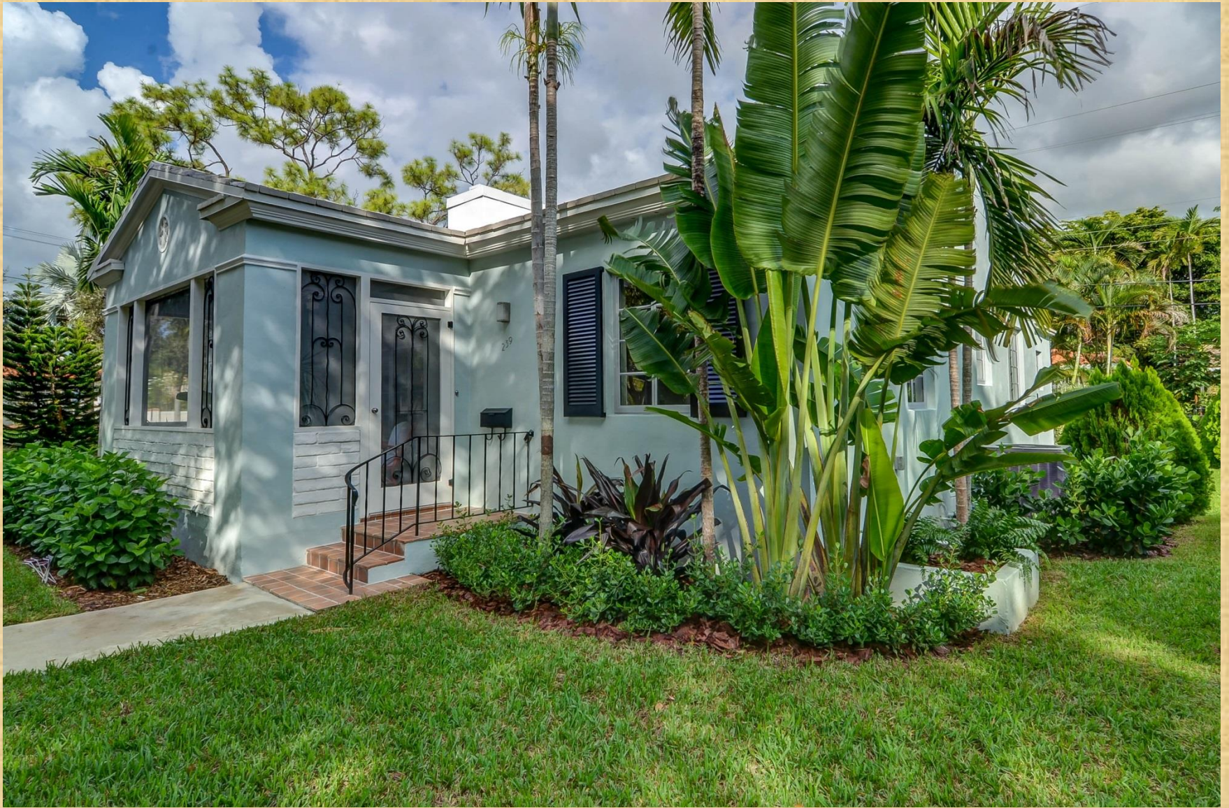
Southeast Corner - After