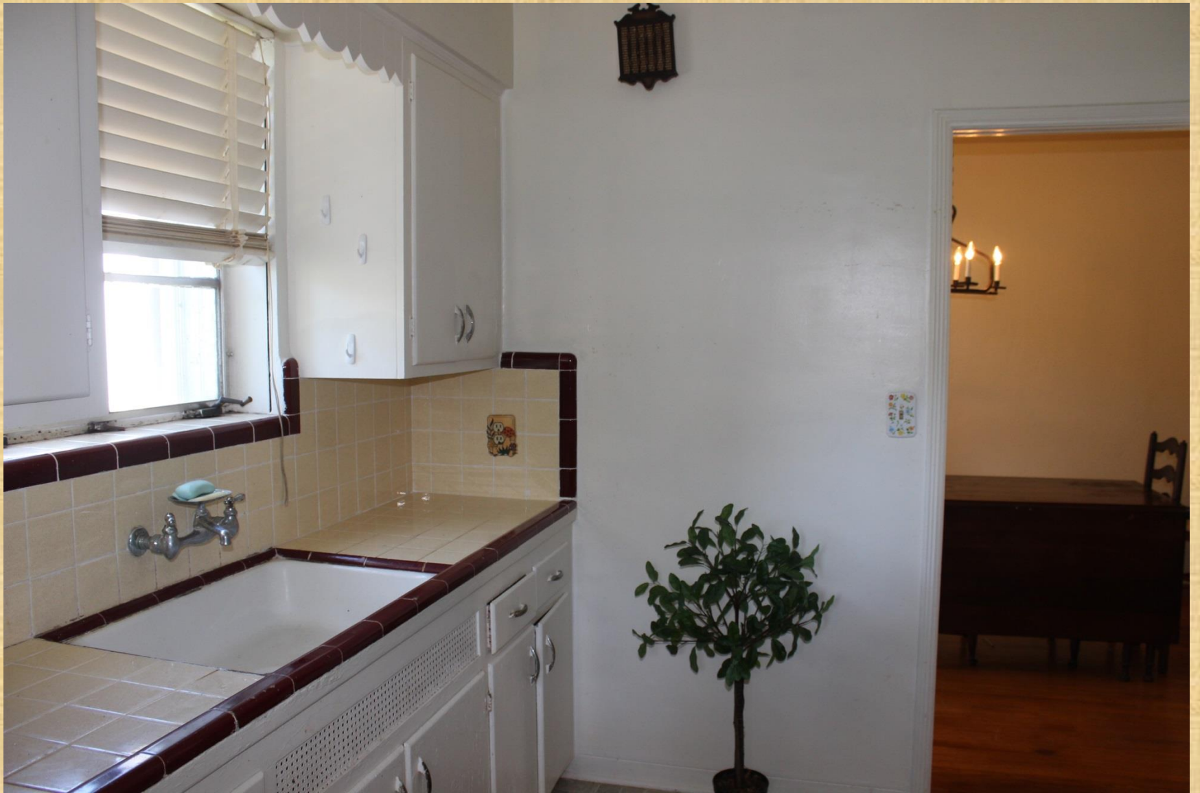
Kitchen - Before