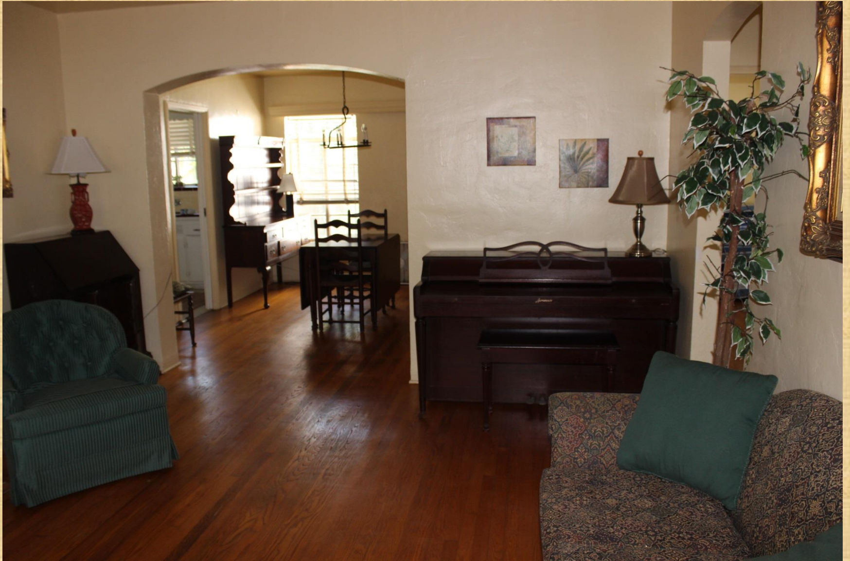
Living Room - Before