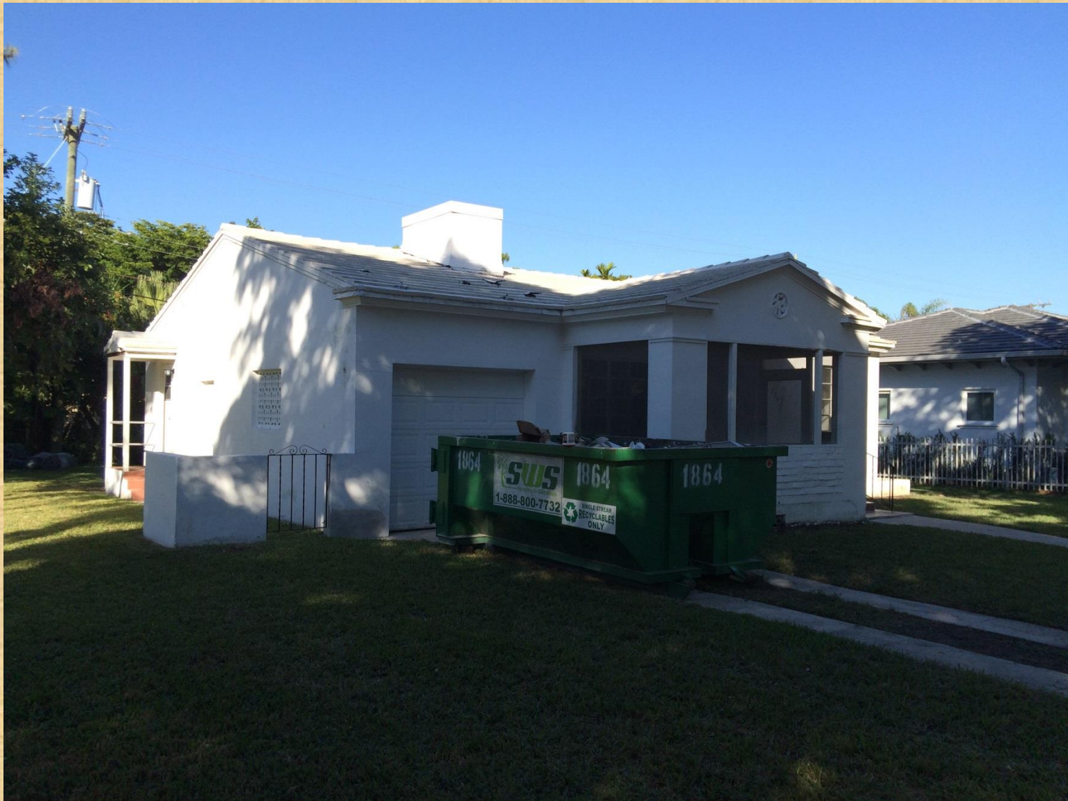
Southwest Corner - Before