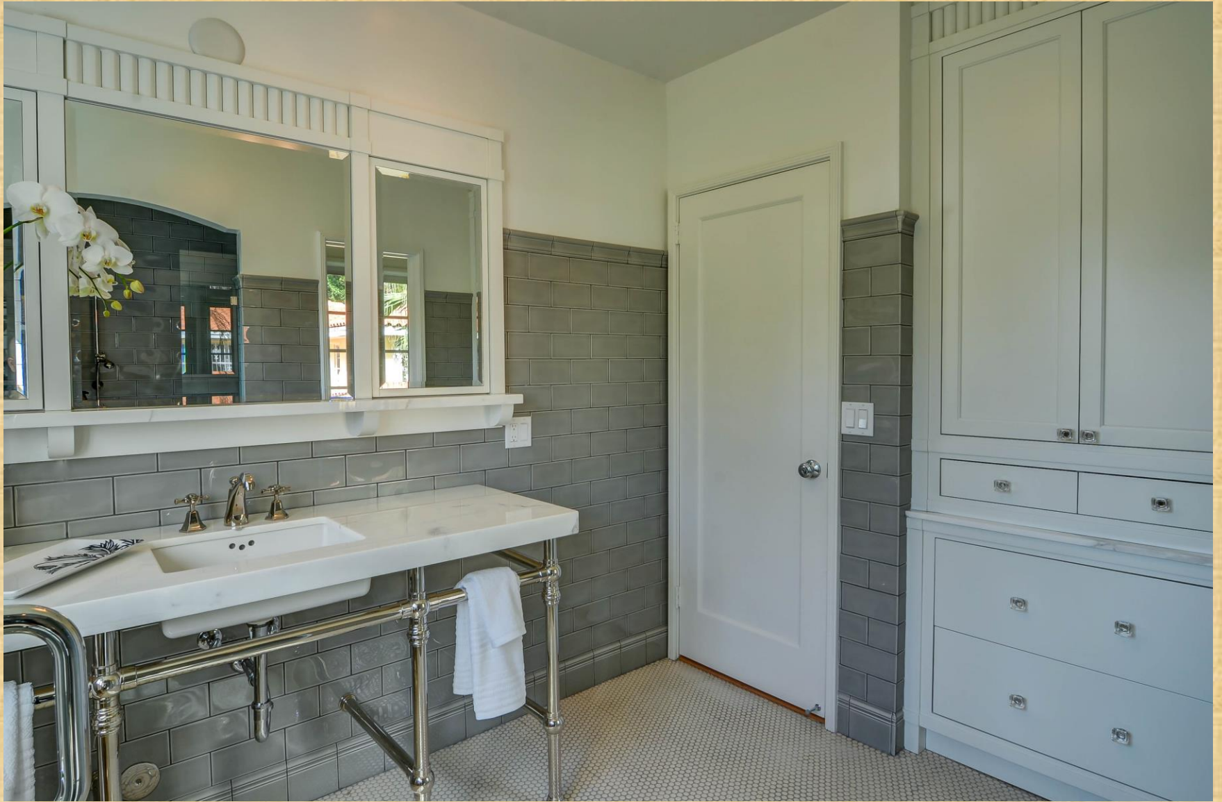
New Master Bath Addition