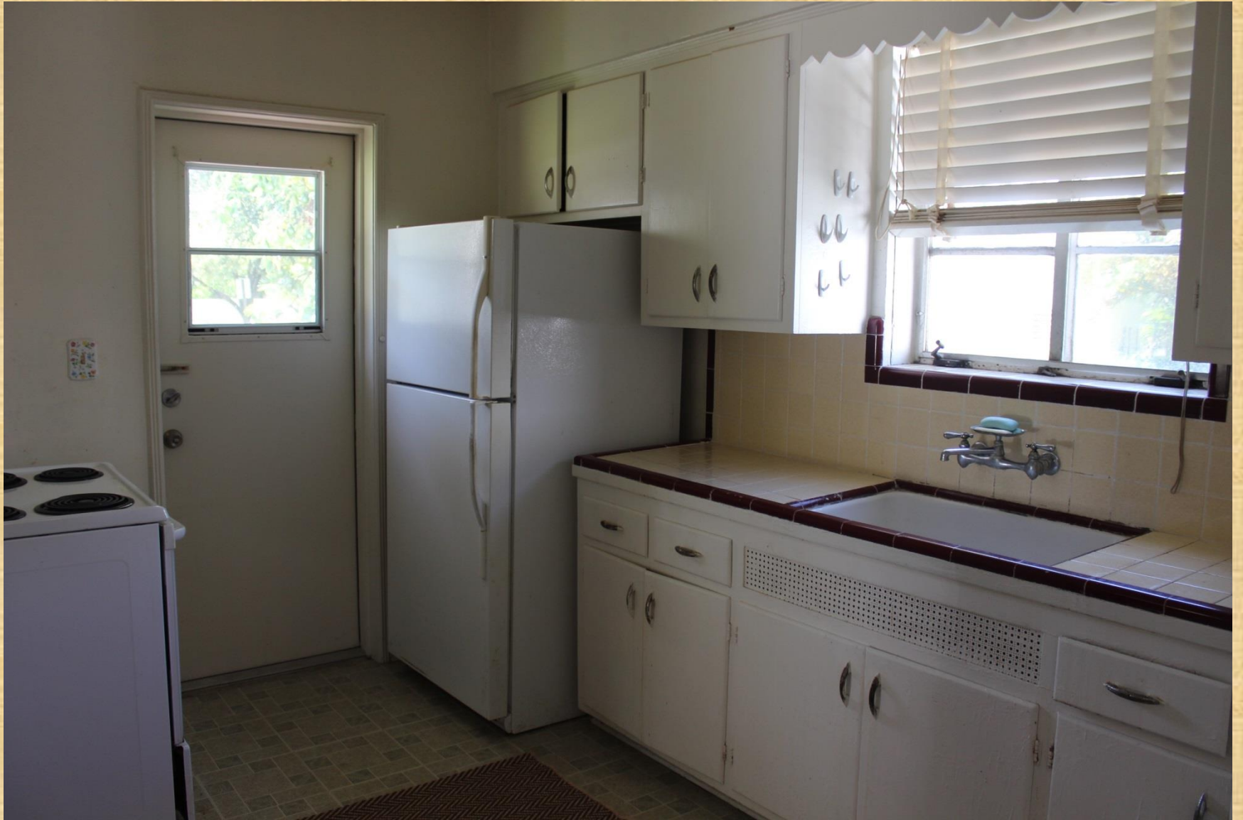
Kitchen - Before