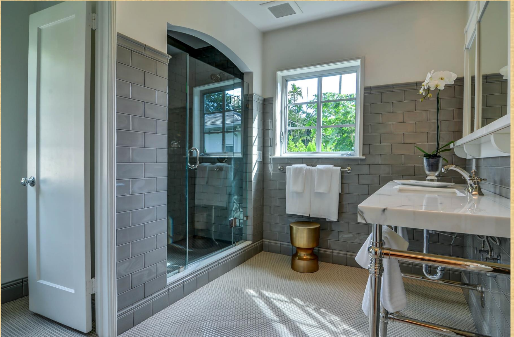
New Master Bath Addition