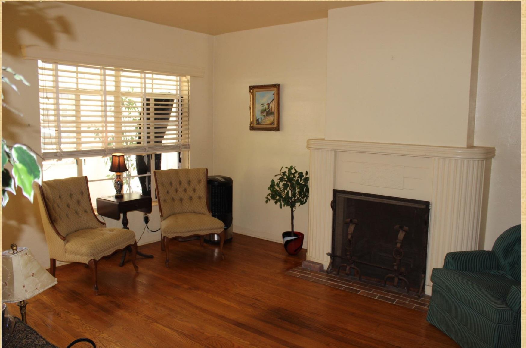
Living Room - Before