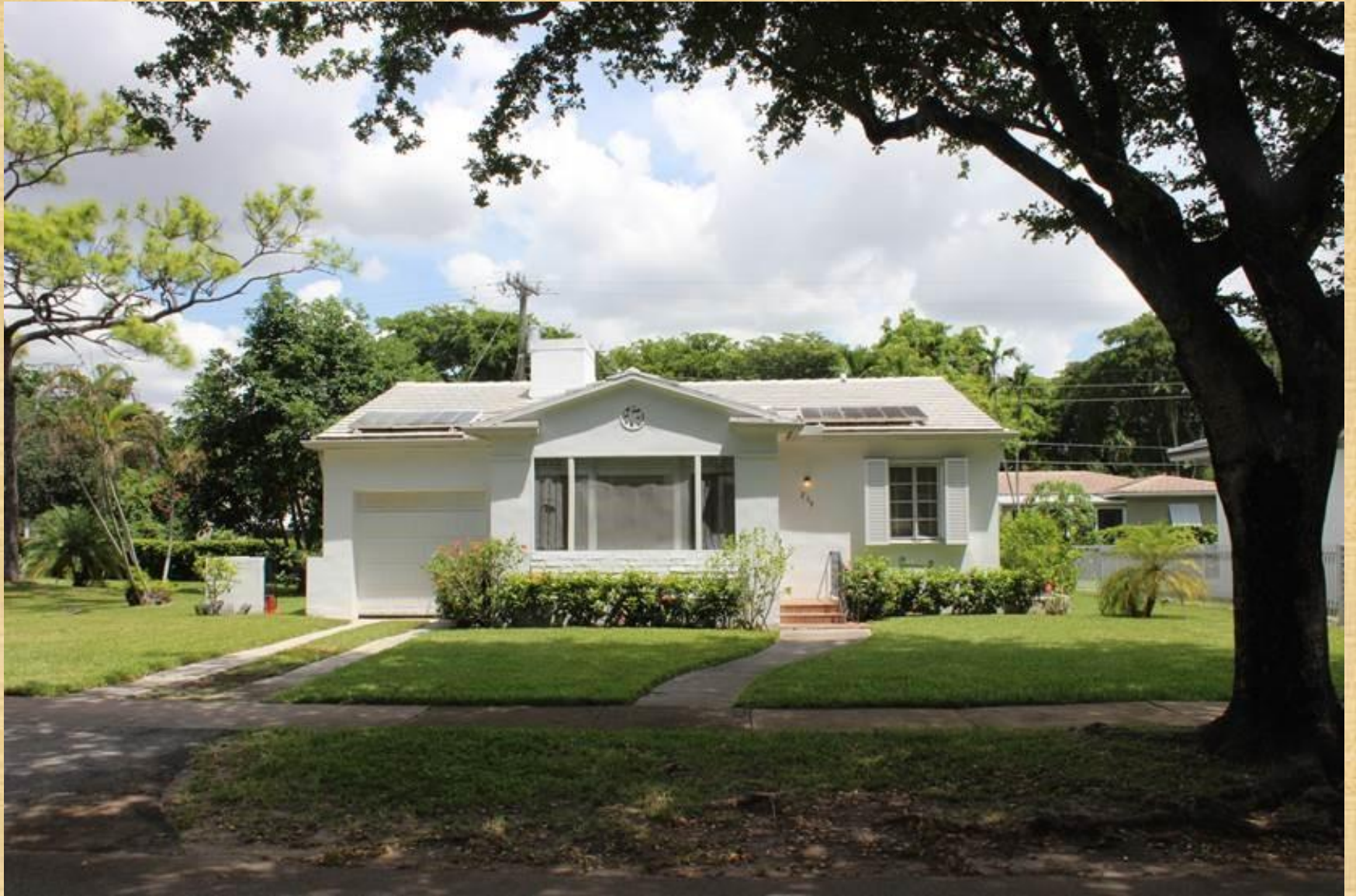
South Façade - Before