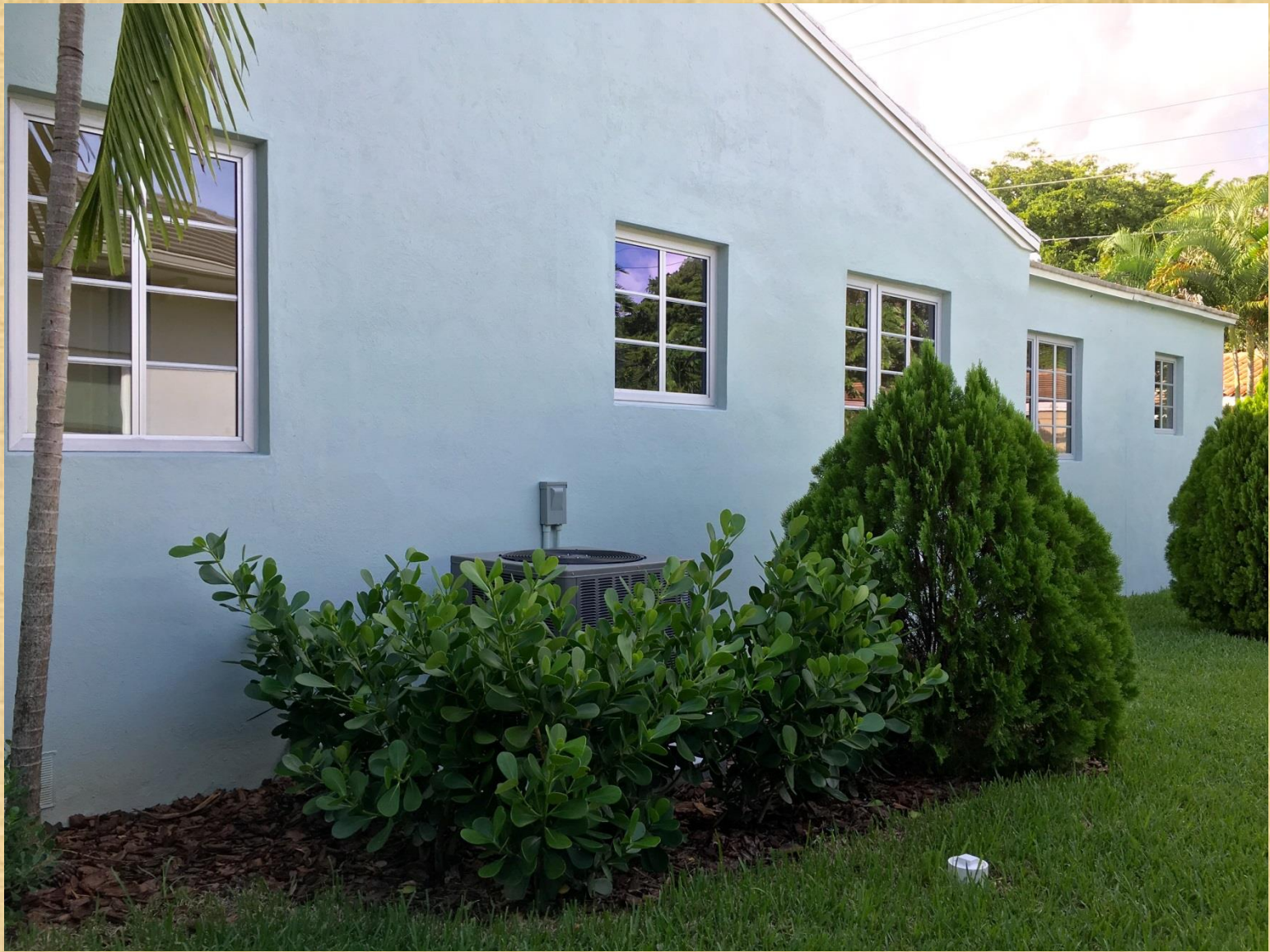
East Façade - After