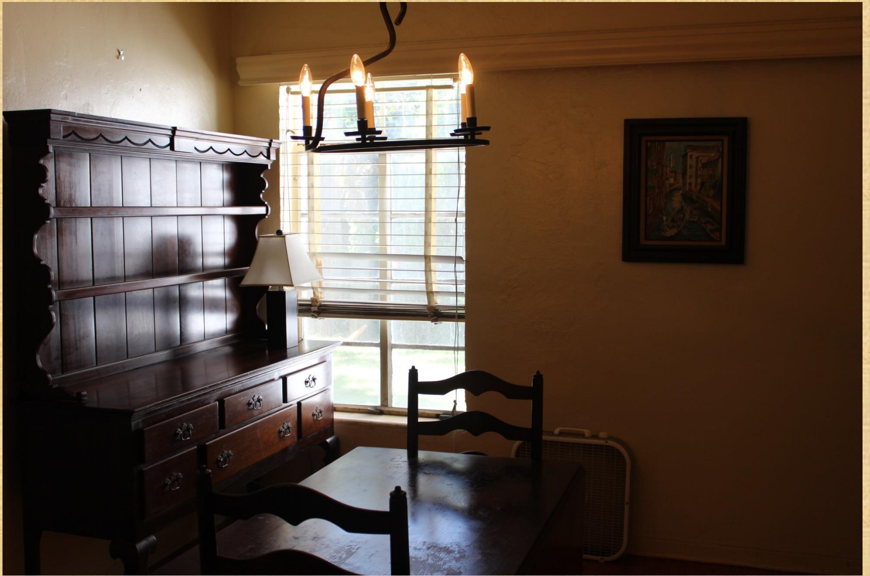
Dining Room - Before