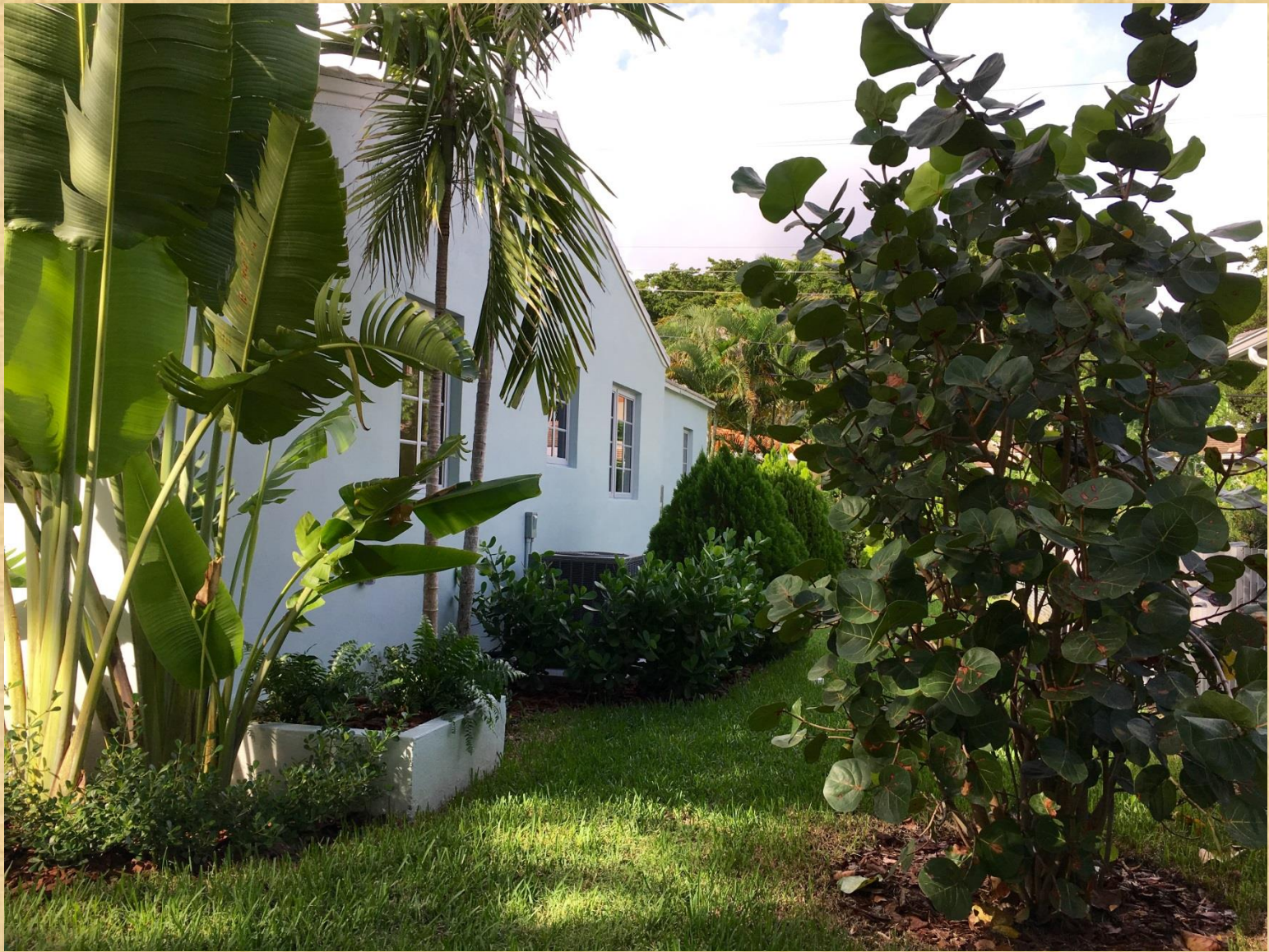
East Façade - After