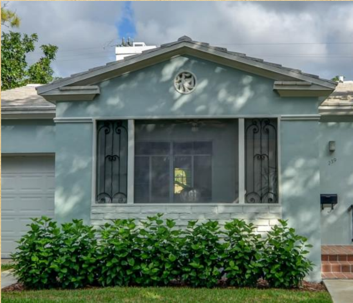
Porch Detail - After