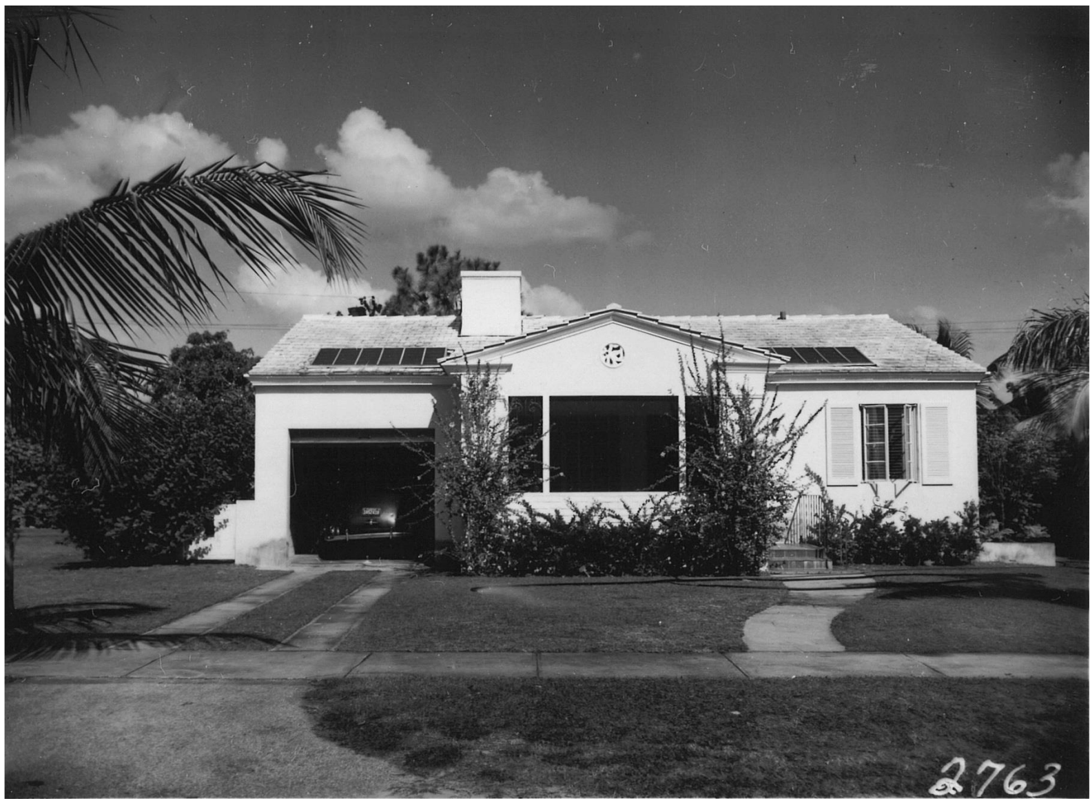
ca. 1940s photo of 239 Sarto Avenue