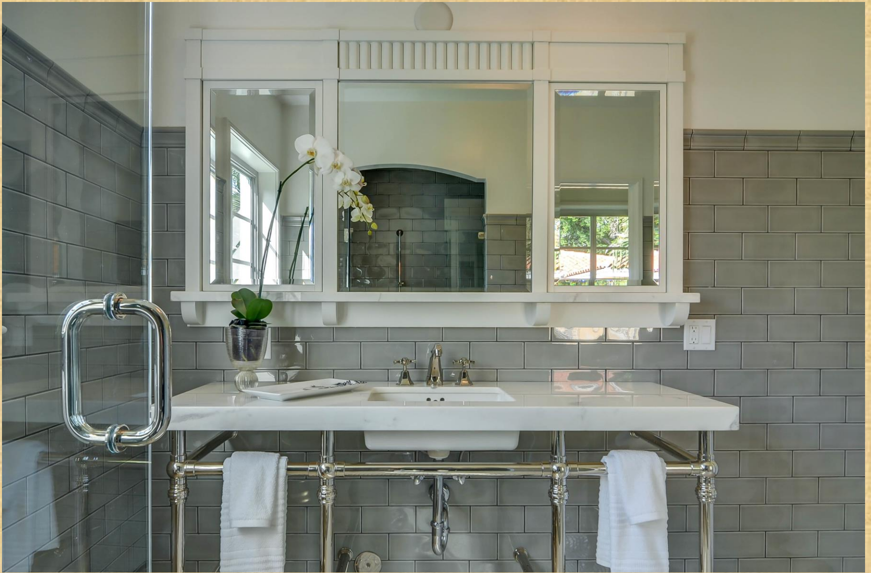
New Master Bath Addition