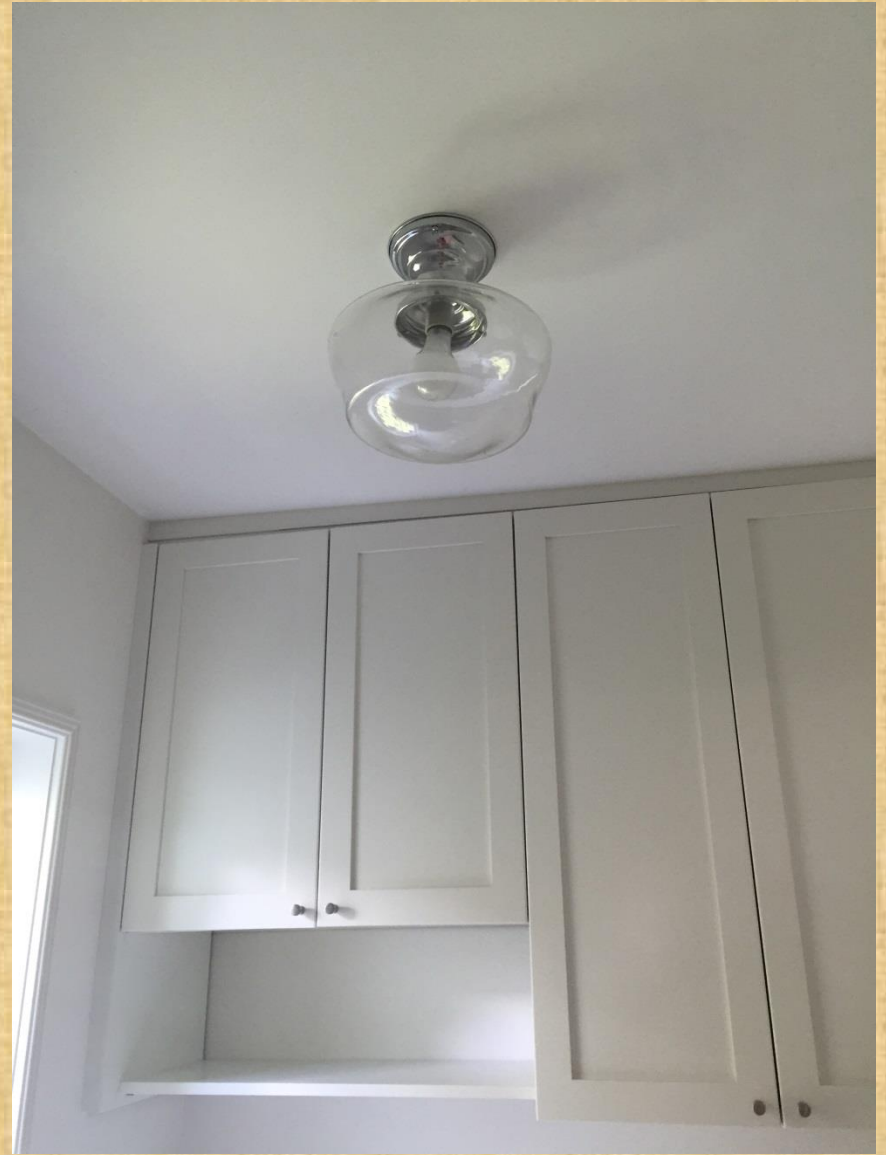
New Laundry Room and Butler's Pantry