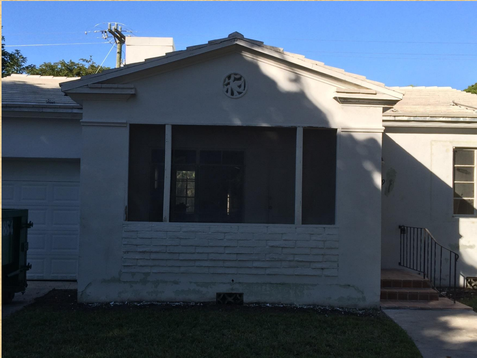
Porch Detail - Before