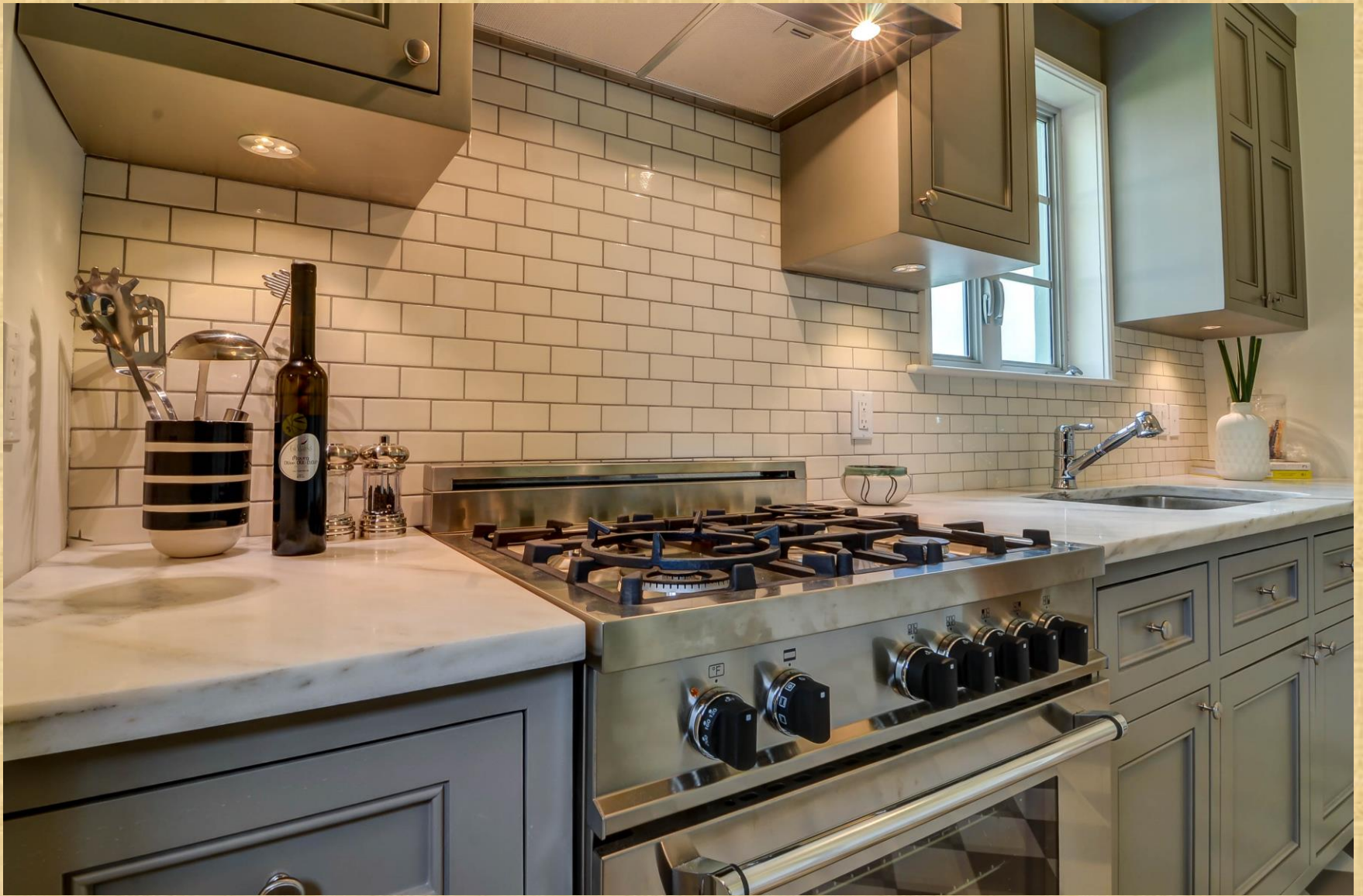
Kitchen - After