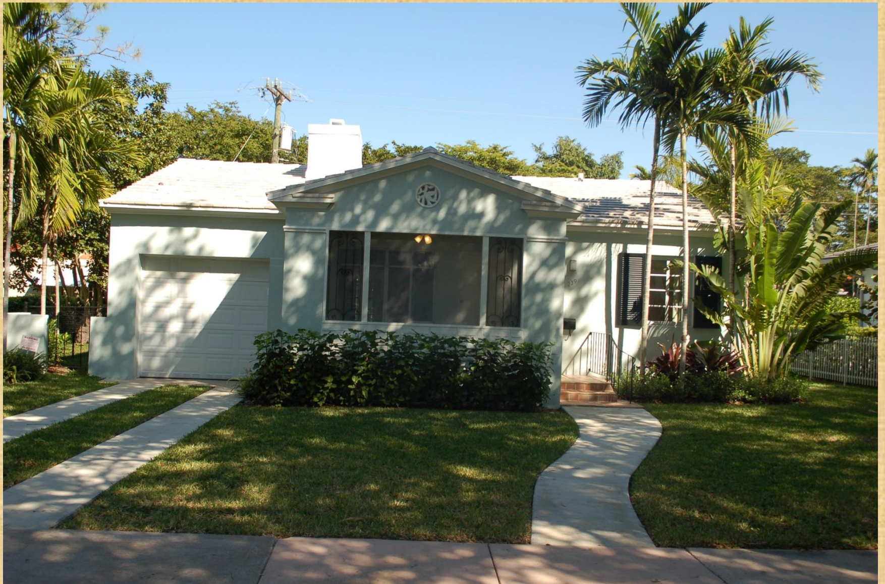
Current Photograph of 239 Sarto Avenue – South Elevation