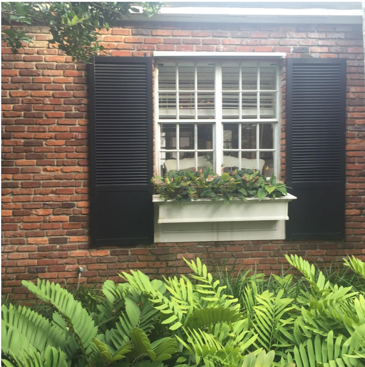
Before – left After - right