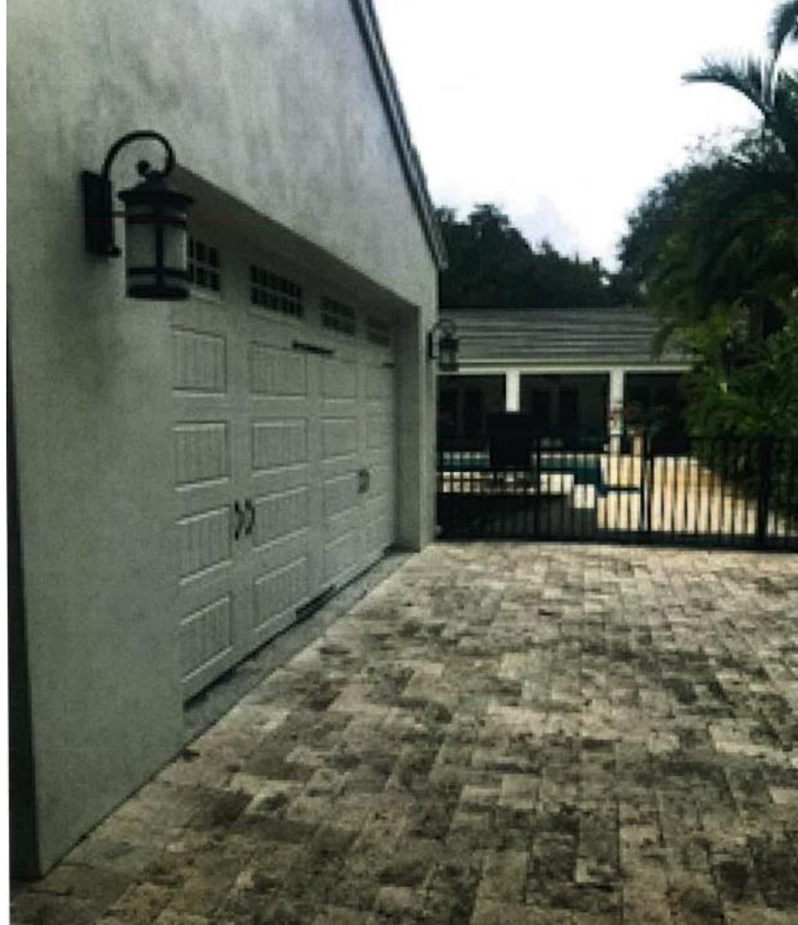
Before – left, After - right