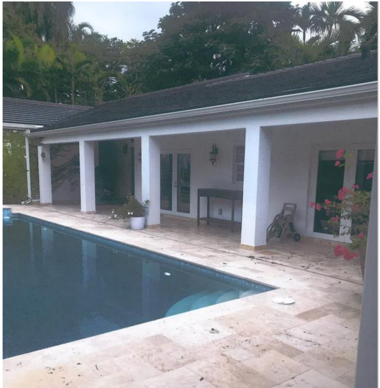
Before – left, After - right