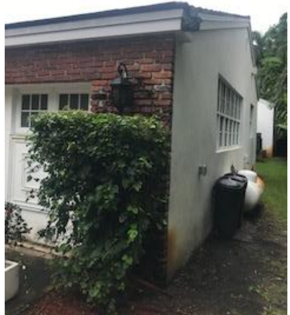
Before – left, After - right