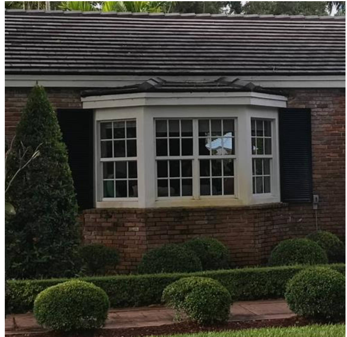
Before – left, After - right