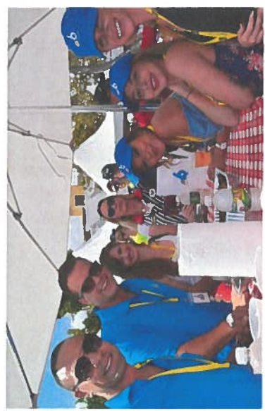
NBC6 Team Gets Ready to Compete

Wings For Wishes and Make-A-Wish Southern Florida are proud to reach more than 50,000 followers via social media. Make-A-Wish Southern Florida has the largest social media following of any Make-A-Wish Chapter in the US!