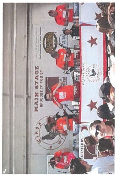
MLE with Joey Chestnut On The Main Stage