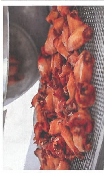
Sports Grill's Famous Special Grilled Wings