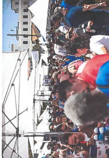
Block Party Fun