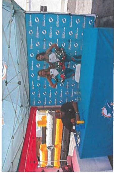
Miami Dolphins In The House