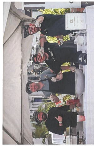
2022 Chicken Wing Recipe Winners