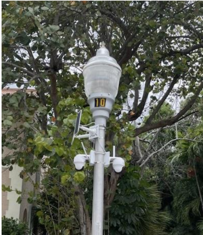
Dual camera deployment sample