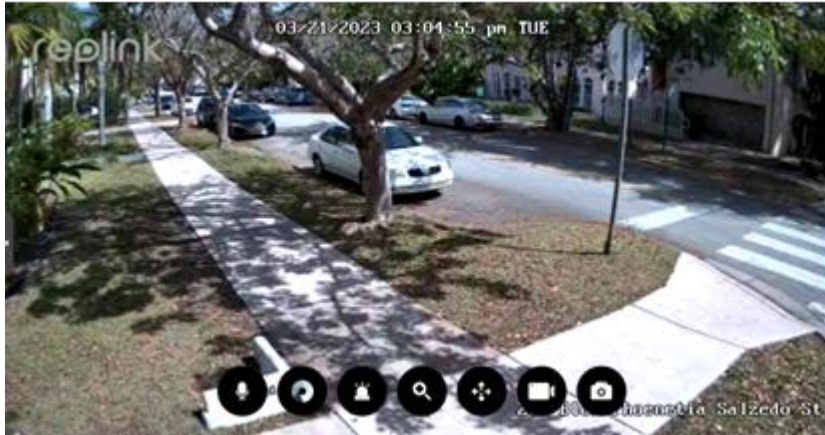
Cam 1 at 200 Block of Phoenetia and Salzedo