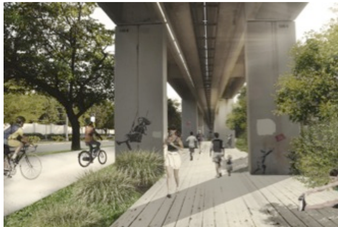
Trail Vizcaya after