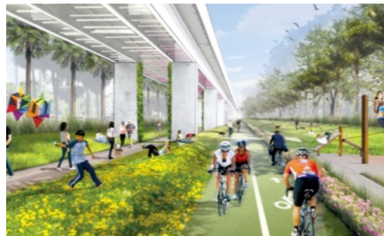
Park & Trail Univ. of Miami before and after