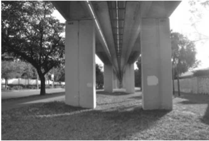
Trail Vizcaya before

Trail – 10 miles long, 100' wide, with lighting, seating and landscaping Parks - Hundreds of acres of new parks and green spaces serving 400,000 residents along the urban corridor.