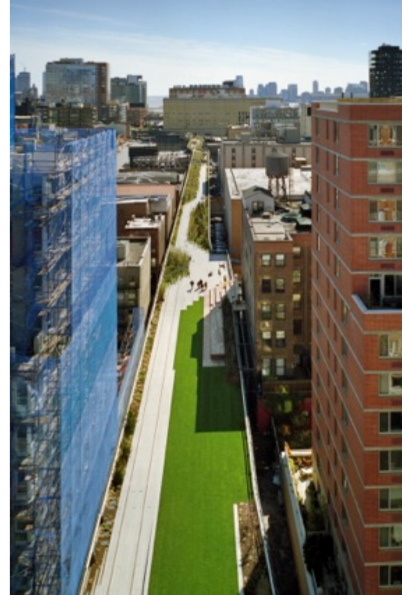
High Line, NYC