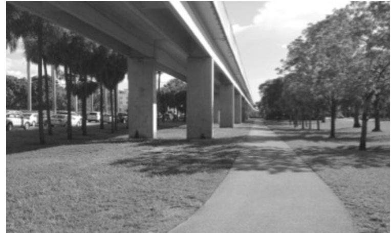
Trail Univ. of Miami before