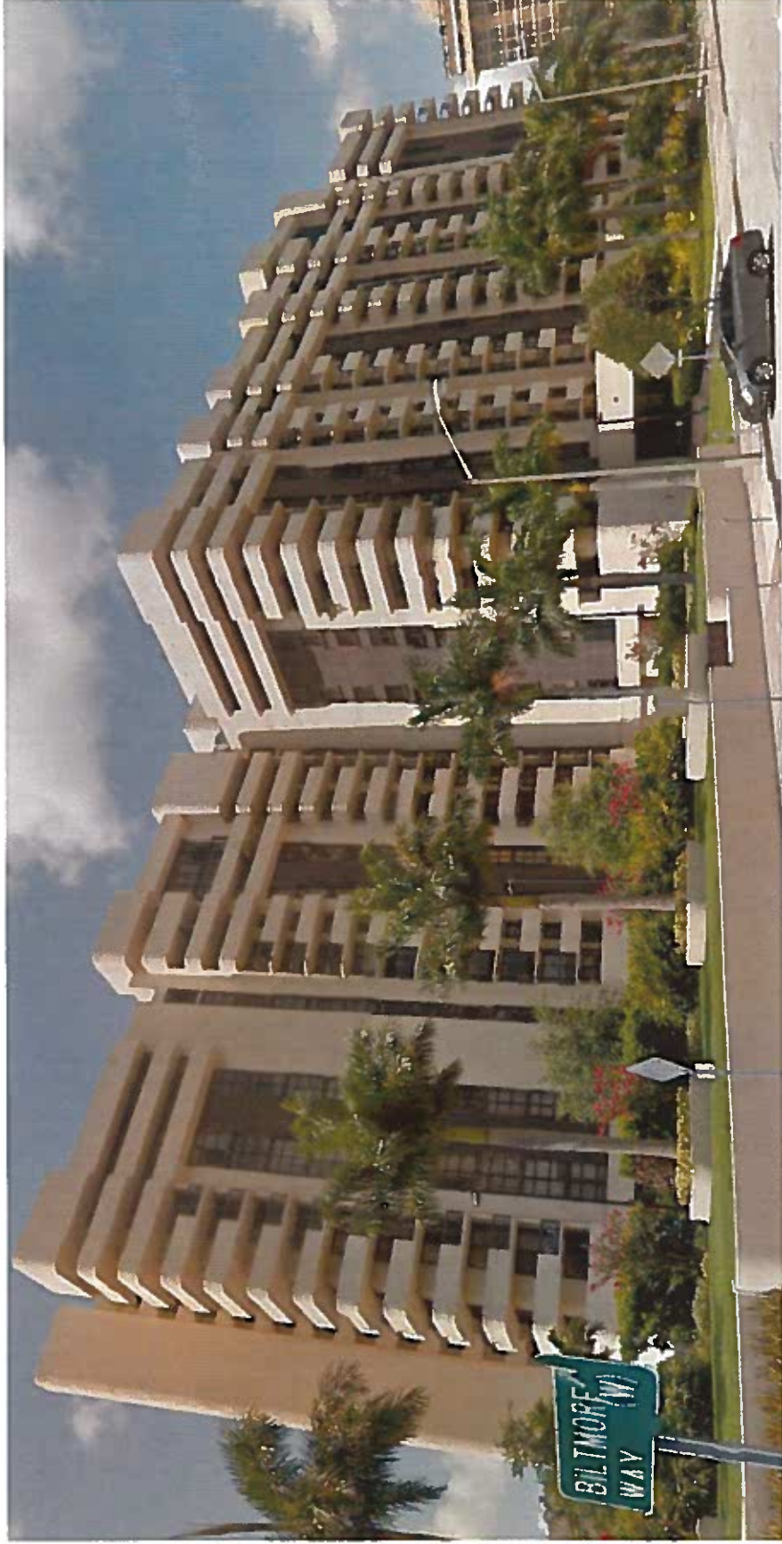
600 Biltmore Way