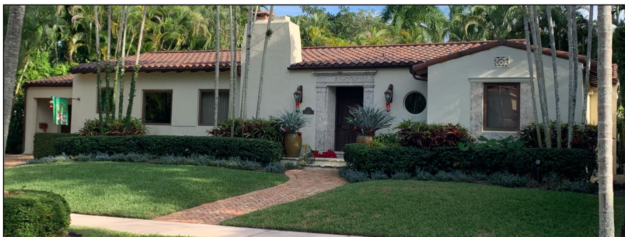
Figures 2: 2515 Indian Mound Trail - ca. 1940s photo (above); Current photo, 2025 (below)