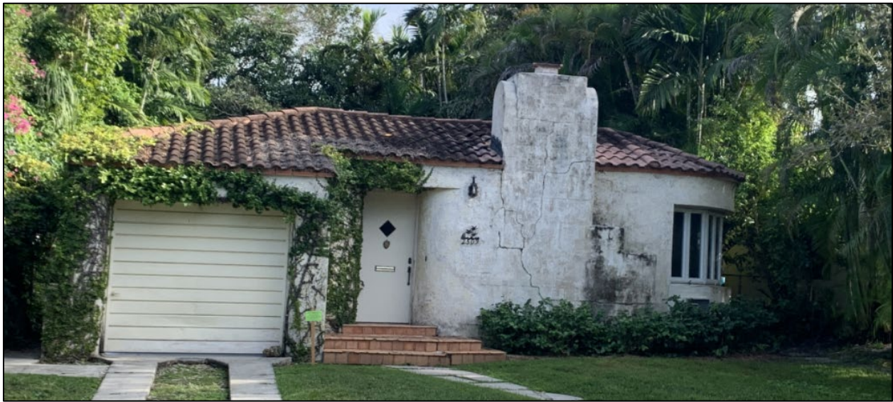
Figures 1: 2509 Indian Mound Trail - ca. 1940s photo (above); Current photo, 2025 (below)