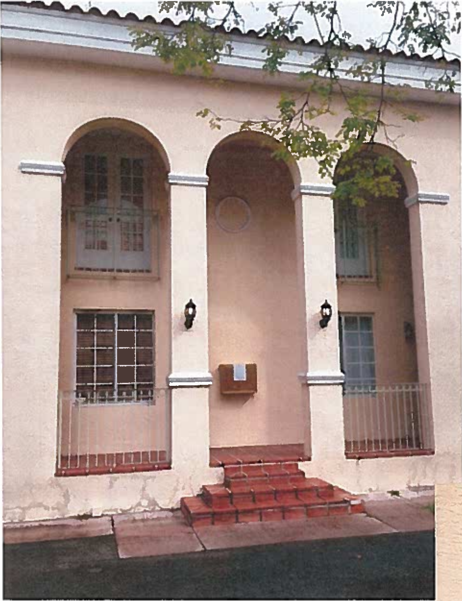
15 MADEIRA AVENUE