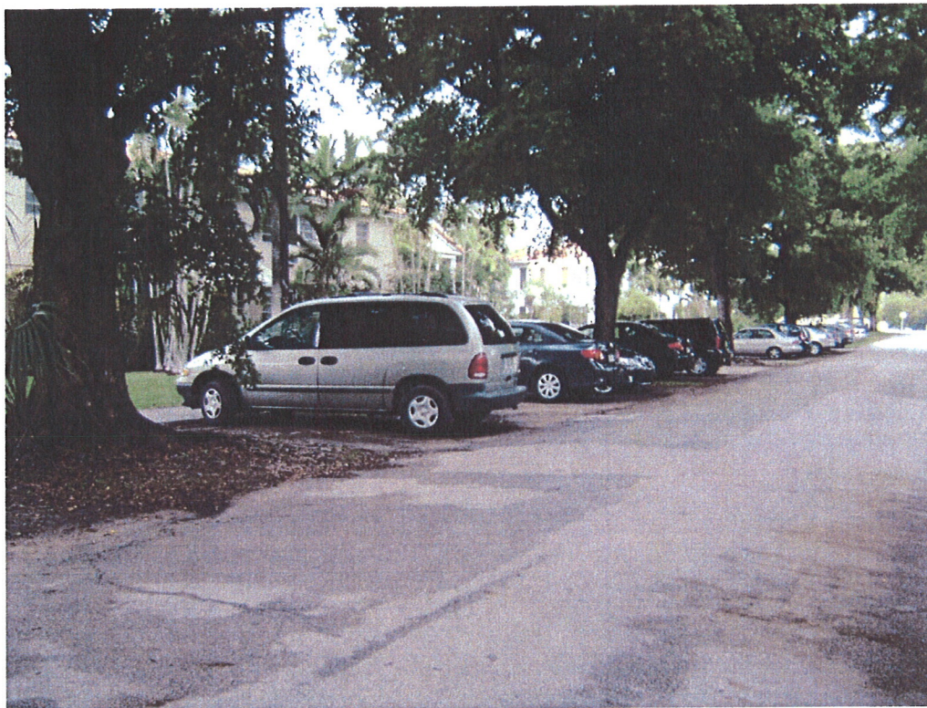
Example #8: Vehicle parked on approved surface on public property