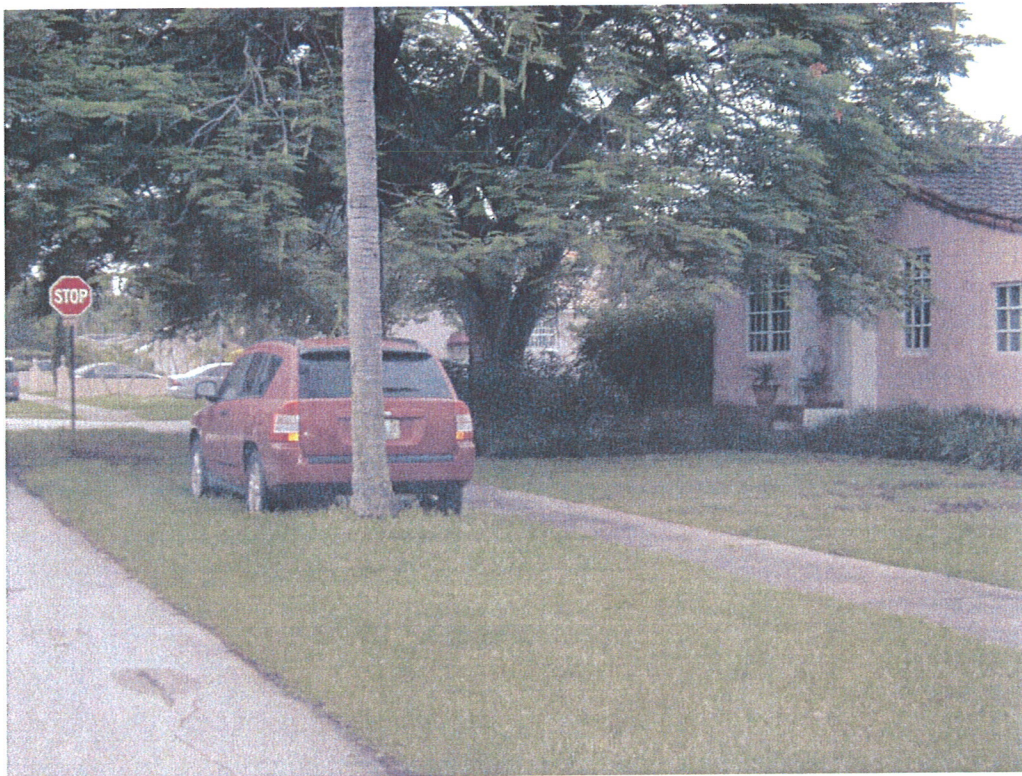
Example #6: Vehicle parked on approved surface on public property