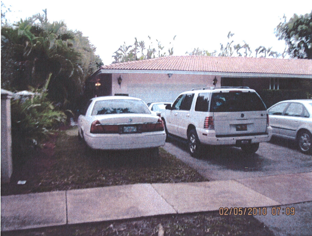
Example #2: Vehicle parked on unapproved surface on private property