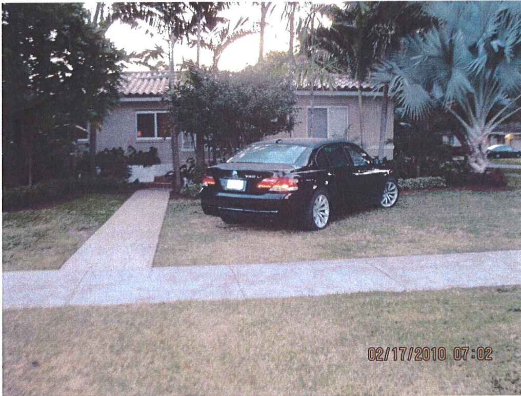
Example #4: Vehicle parked on unapproved surface on private property