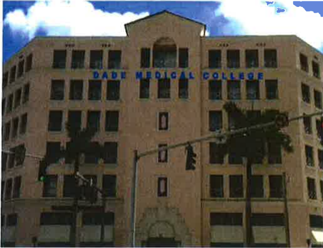
DMC requested signage location