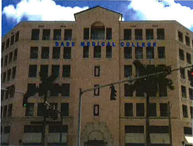
DMC requested signage location